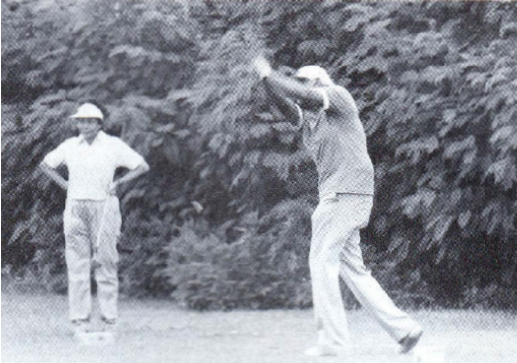
Driving at the Royal Colombo Golf Club.