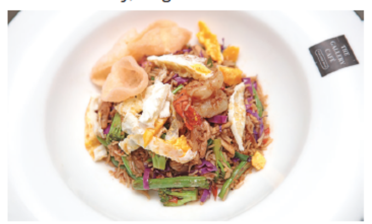
Flavoursome Nasi Goreng with chicken and prawn