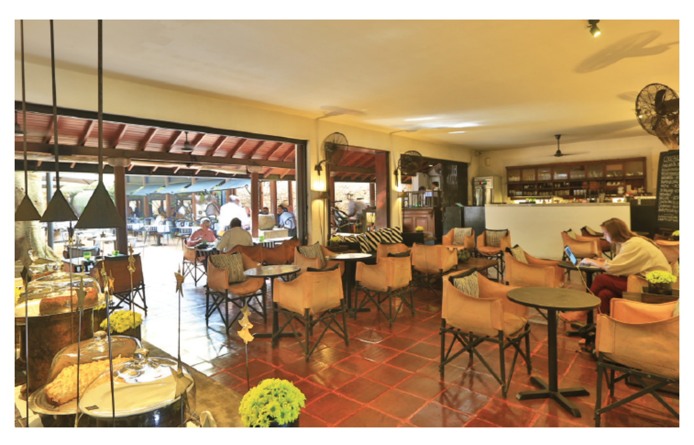
The café is a perfect fusion of eclectic charm.