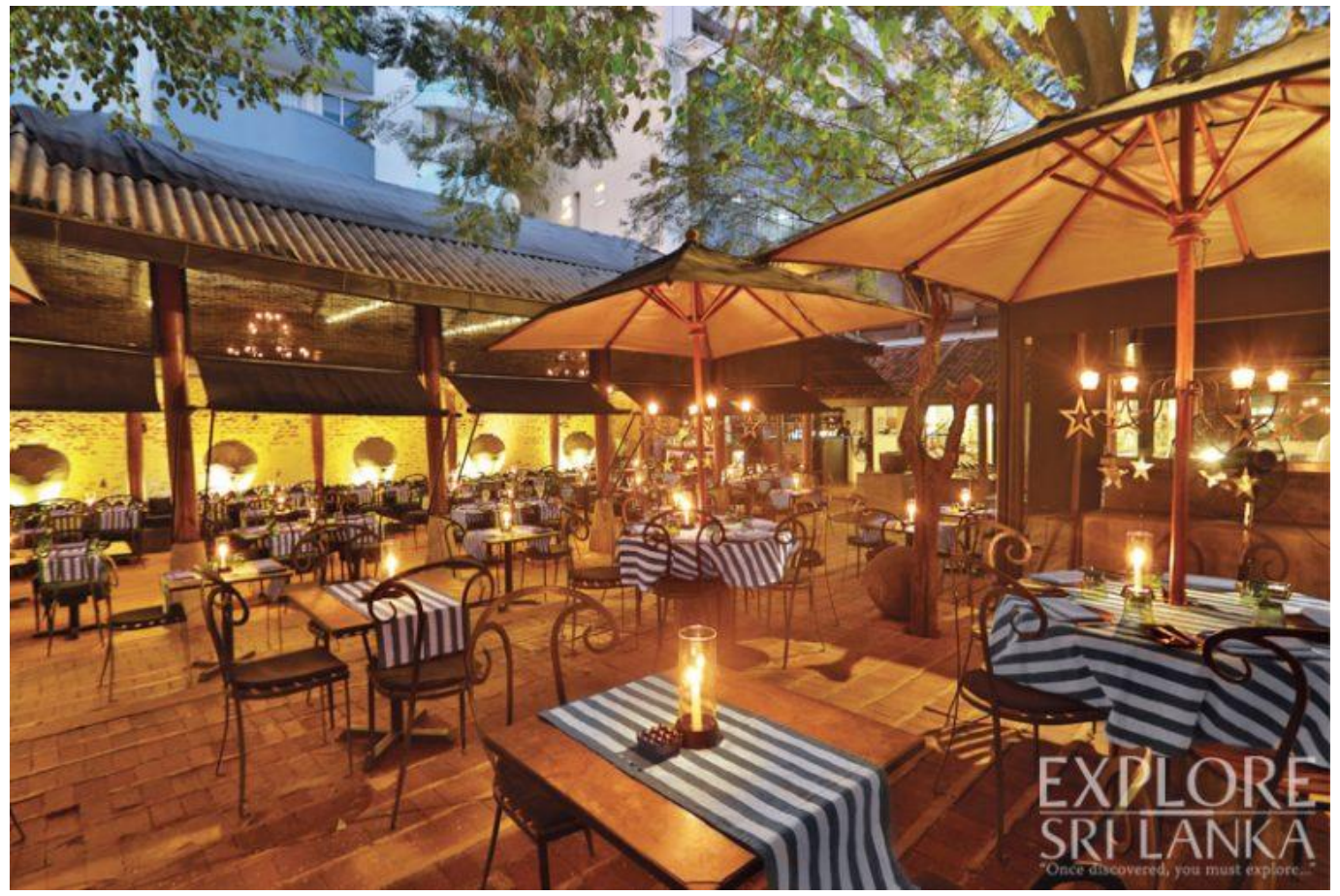
The open courtyard provides a unique tropical elegance

The exterior and interior maintain the vernacular architecture. Together with the characteristic Paradise Road black and white stripes that adorn the various features of the restaurant and subtle yet exquisite furnishing, the perfect fusion of the old and contemporary has enabled the timeless ambience of the Paradise Road The Gallery Café. The open courtyards and dining areas provide a unique tropical vibe.