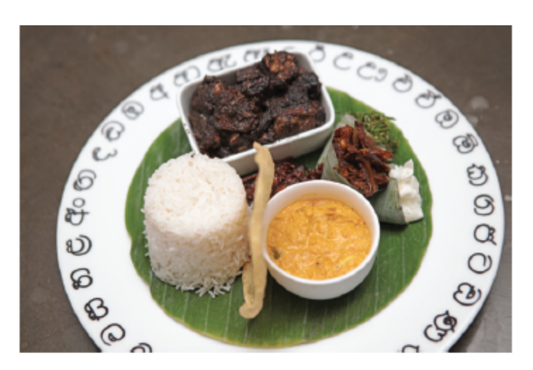
Black Pork Curry, a signature dish