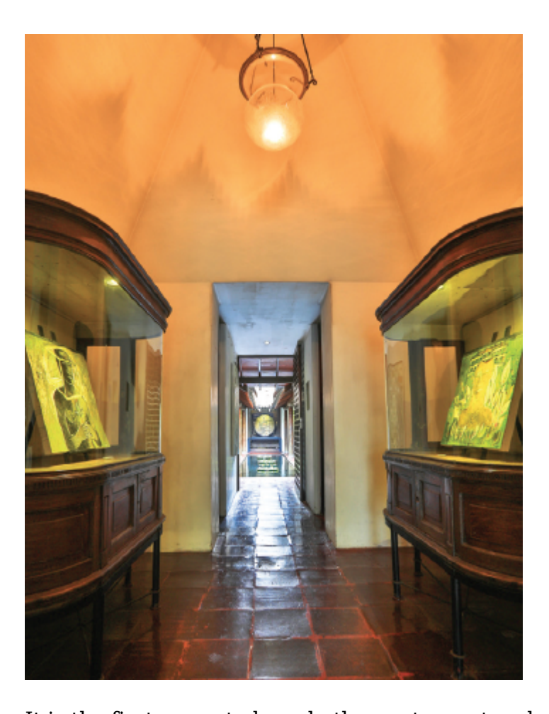
It is the first space to have both a restaurant and art gallery.