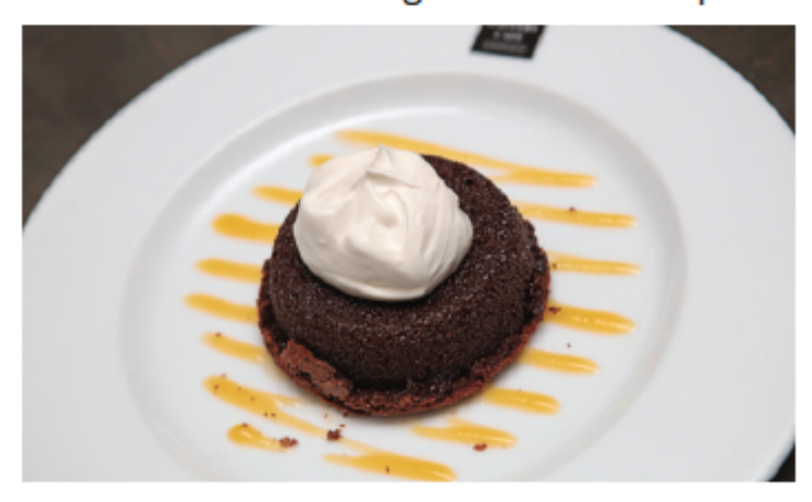
A sweet delight, the Chocolate Nemesis