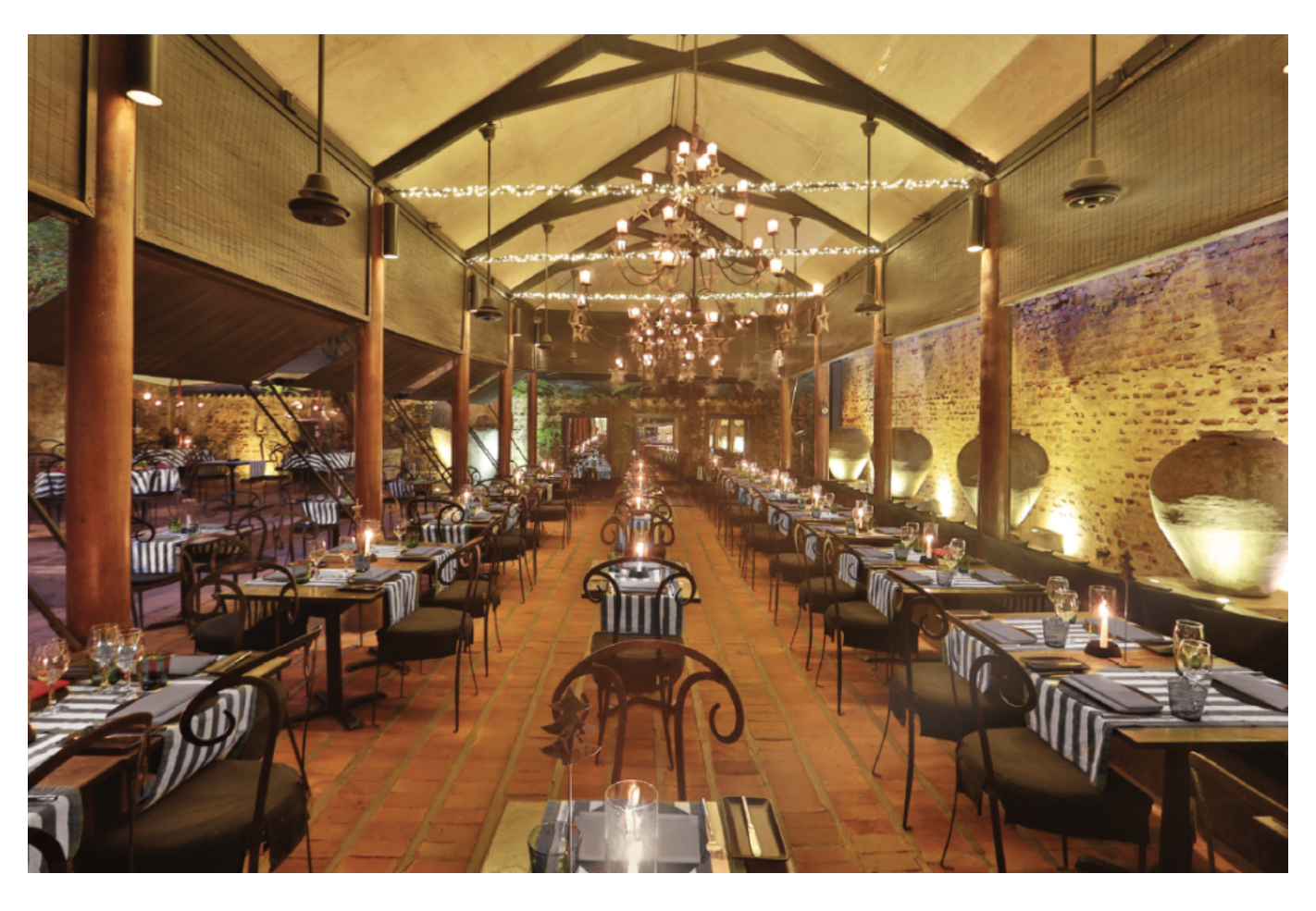
Paradise Road The Gallery Cafe fosters a timeless and chic ambience