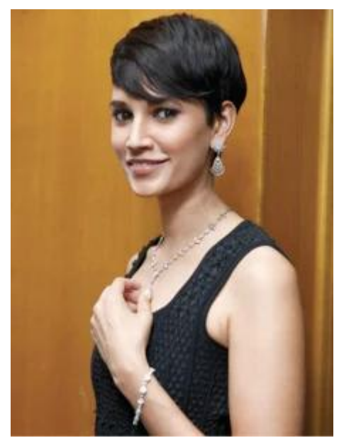
An elegant jewellery set from the Timeless Glamour collection