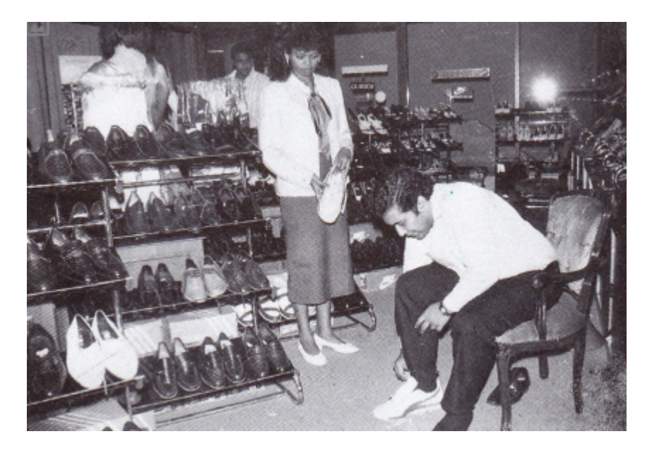
Several well known makes of footwear on sale at Fairline.

Nuwara Eliya making a wide range of purchases of the latest seasonal wear from Fair line. This is true of tourists both from the East and West. The Fashion conscious tourists too think the same. They take away suit cases full of "buys" as they shop at leisure at Fairline Emporium and consider prices not merely competitive but cheap by their standards back home. Fairline Emporium is an approved Tourist shop and is authorised by the Ceylon Tourist Board to transact business in foreign currency. The retail stores at Star Tower, Galle Road Colombo 3 (near Kollupitiya junction) is open from 9.30 a.m. to 7.30 p.m. every day except on Full Moon Poya days. Parking space right by the Emporium helps for easier shopping.