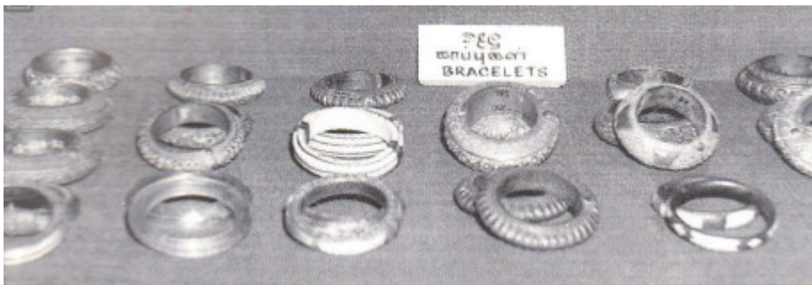
Chunky Kandyan bracelets on display at the Museum.

Whether it be charms and amulets little containers of perfumes which brought good luck and admirers too, beautiful necklaces, handsome bracelets, heavy anklets, ornamental chatelaines on which dangled the keys to many a treasure in gems and jewellery, combs which marked caste and rank, waist chains which measured one’s worth in girth and value of silver and gems that went into their making, all of this and much more are there to be discovered at the Colombo Museum.