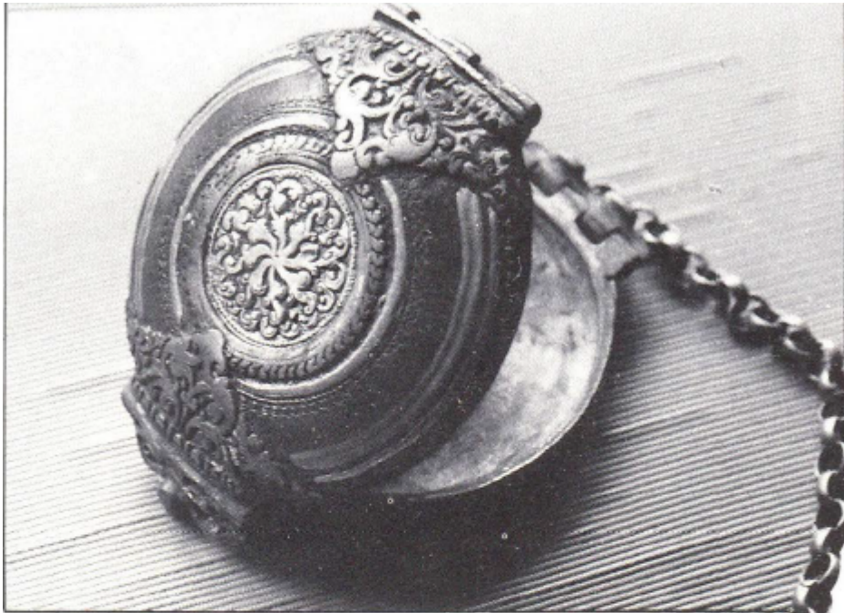
An antique ornamental container for chunam.