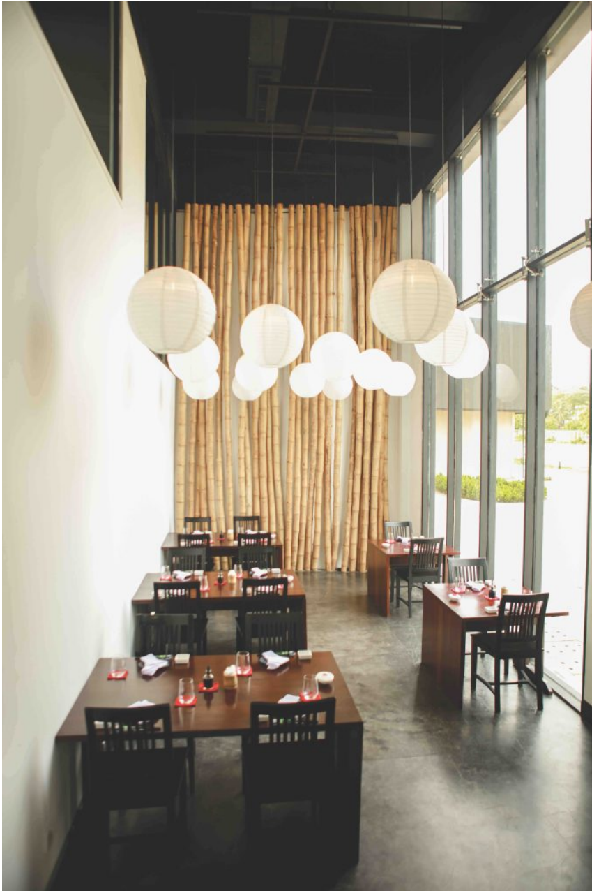
Apart from the eight private rooms, the restaurant's open dining area.