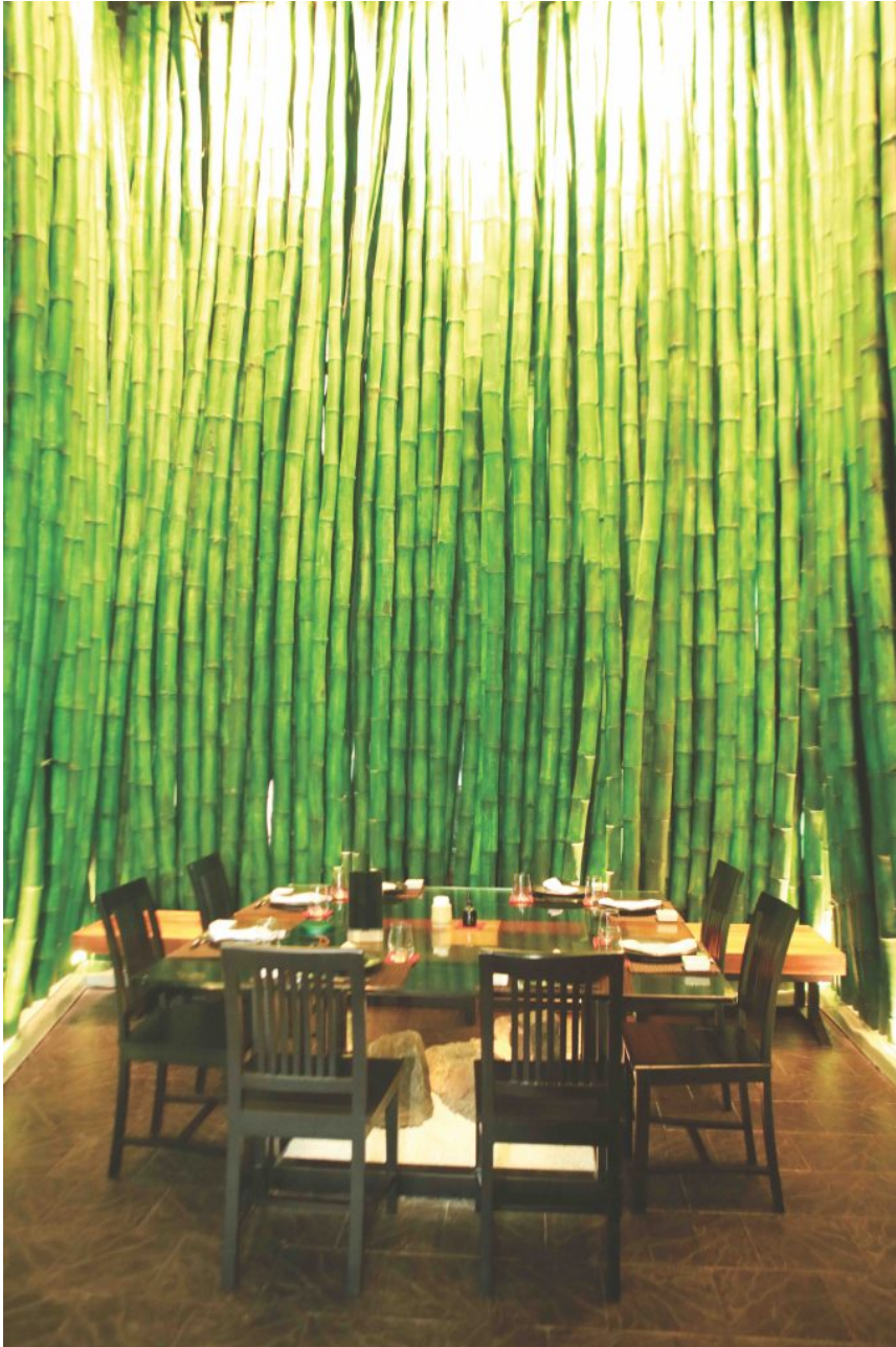
One thousand forest-green bamboo stalks adorn 'Chikurin'.