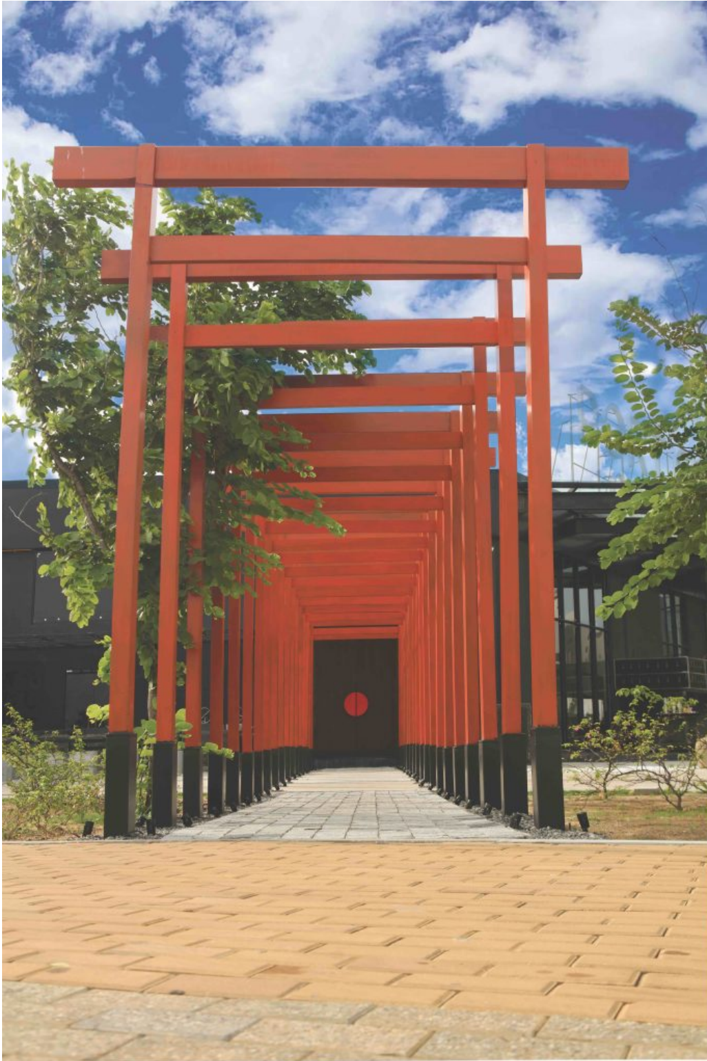
The unique entrance with 18 vivid orange Torri-gate like arches.