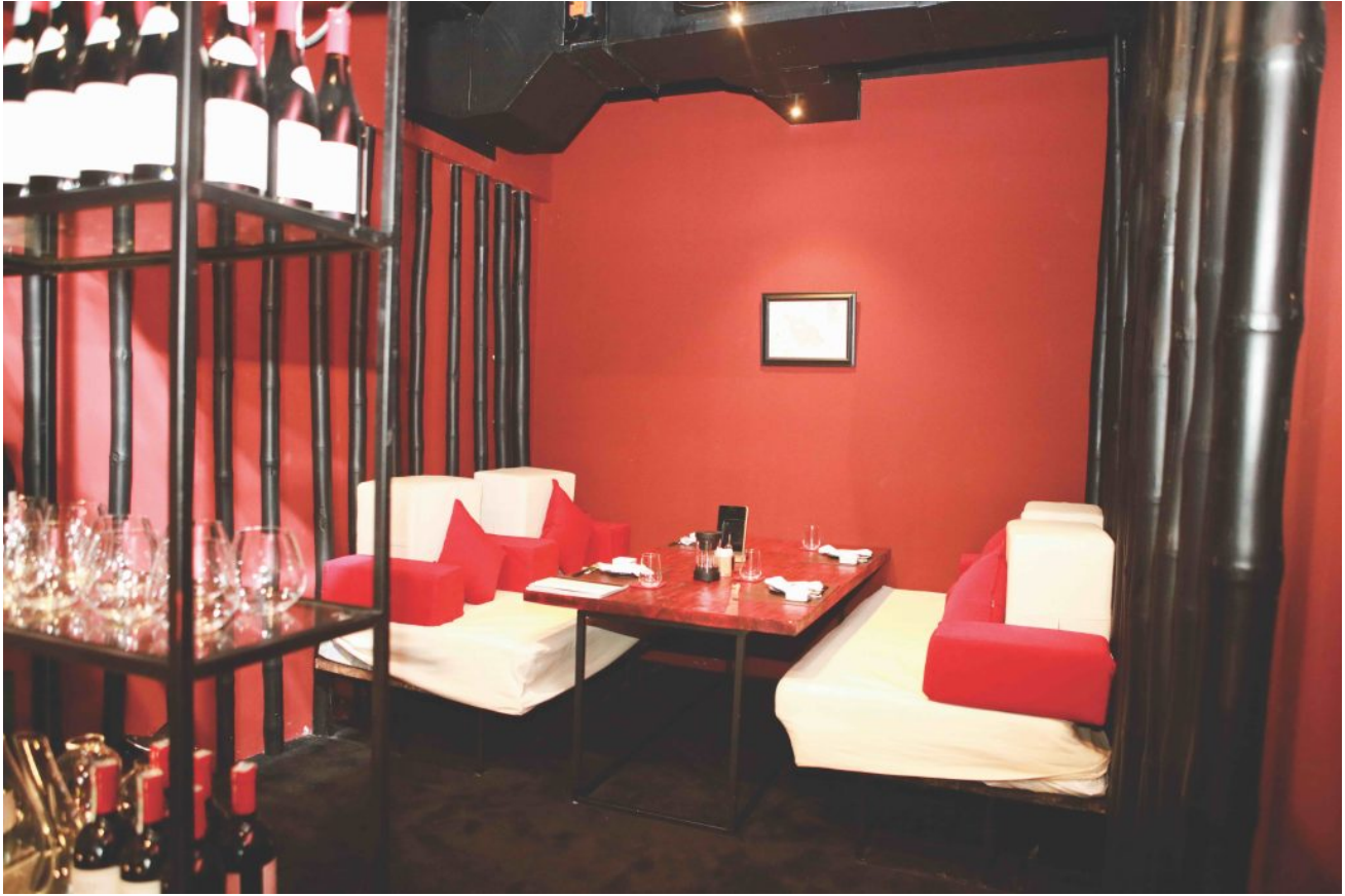
The elegant burgundy wine room.