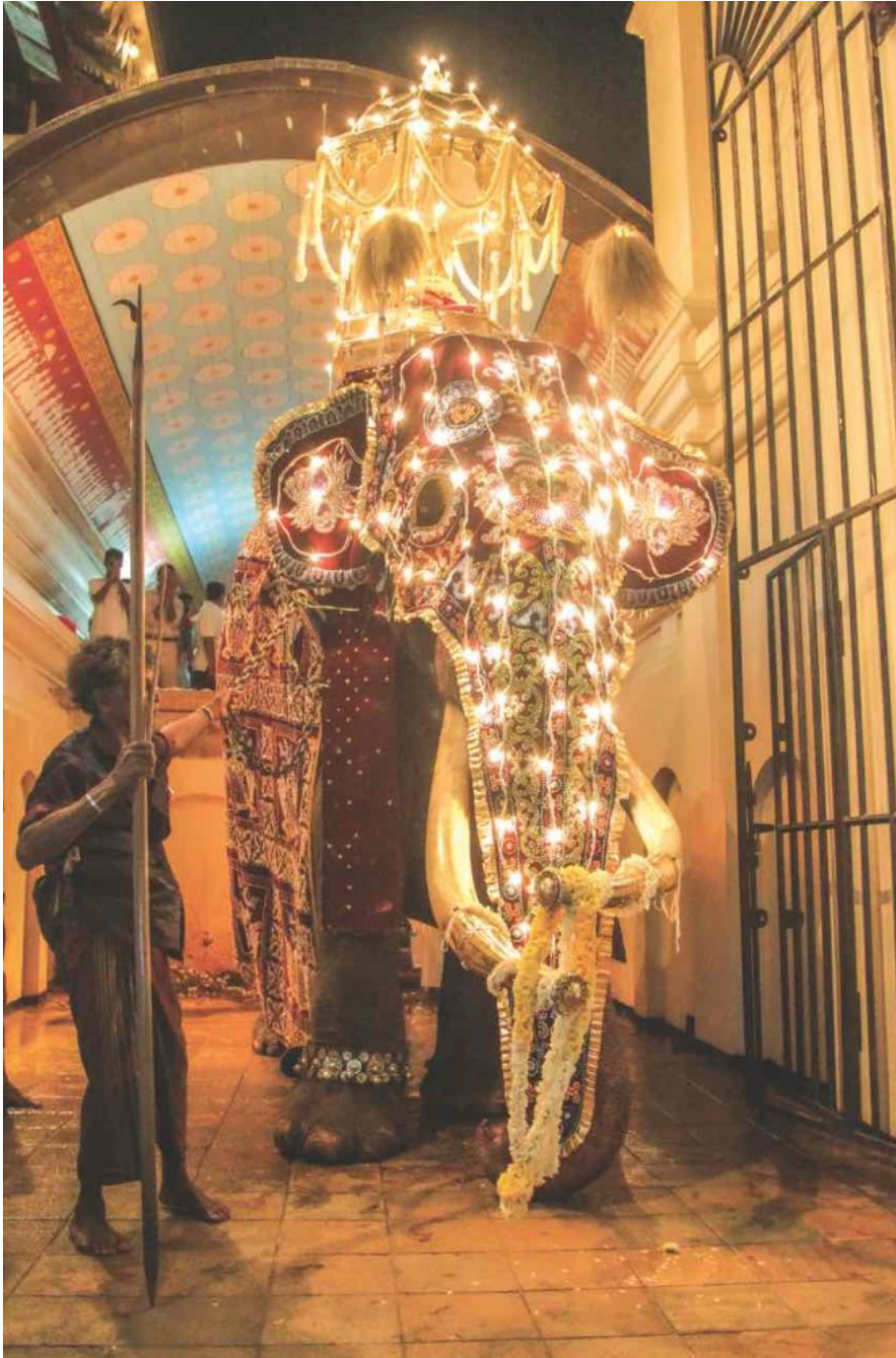
The majestic Maligawa Tusker, carrying the golden casket with the replica of the Sacred Tooth Relic.