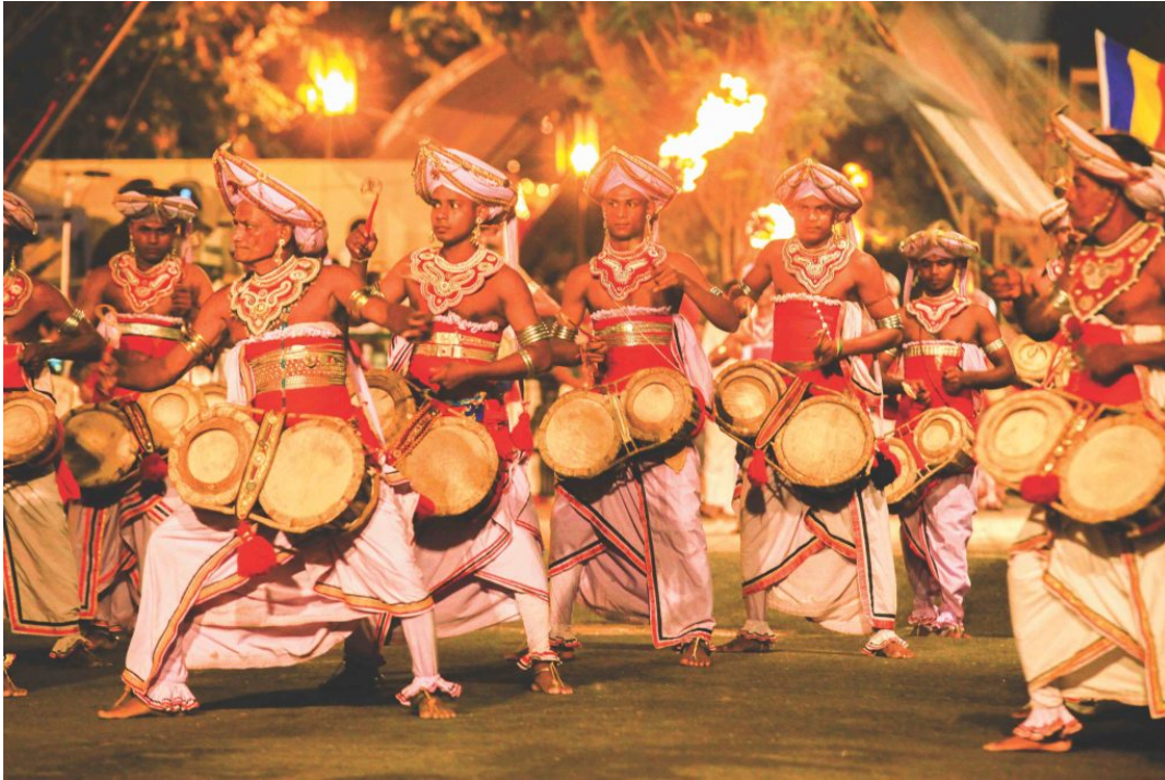
Traditional drummers, focusing on their rhythmic performance.