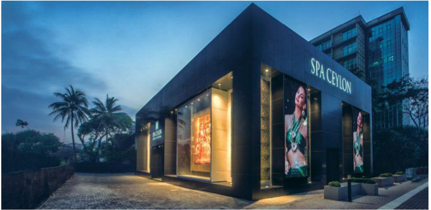
The elegant exterior of Royal Indulgence Spa

Royal Indulgence Spa is an imposing black façade on Galle Road. Synonymous with Ayurvedic creations this store-cum-spa's grandeur is apparent even from its exterior.