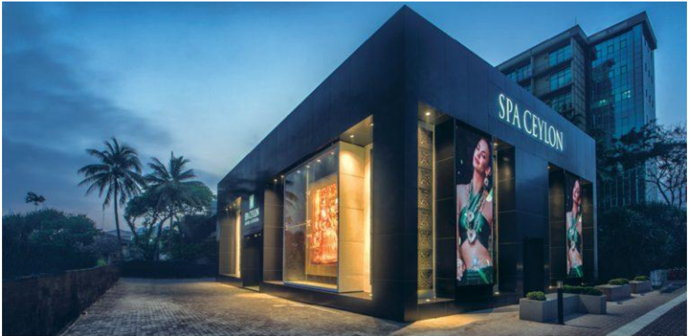
The elegant exterior of Royal Indulgence Spa

Royal Indulgence Spa is an imposing black façade on Galle Road. Synonymous with Ayurvedic creations this store-cum-spa's grandeur is apparent even from its exterior.