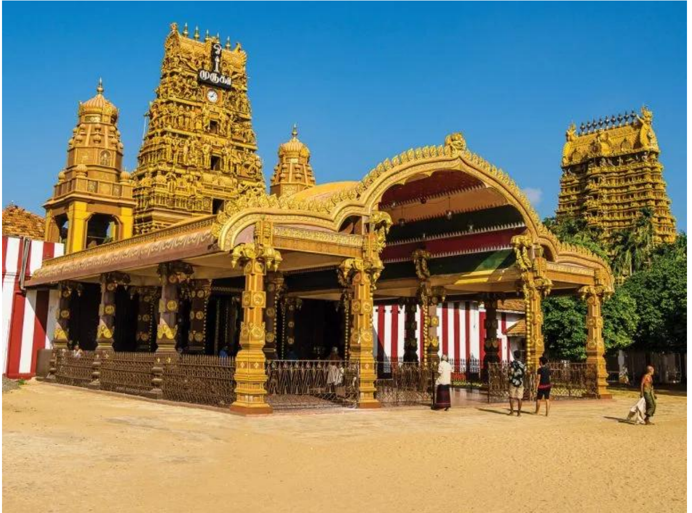
The entrance into Nallur Kandaswamy Kovil.

We stopped for a brief moment at the Nallur Kandaswamy Kovil on the outskirts of Jaffna town. This is the most important temple of Sri Lankan Hinduism. The present temple was founded in 1734, but the sanctuary is very ancient, though not at this precise site. The present temple is known as the fourth temple. The current Nallur Kandaswamy Kovil is a very extensive facility. The temple has great social, religious, and cultural significance to Sri Lankan Hindus.