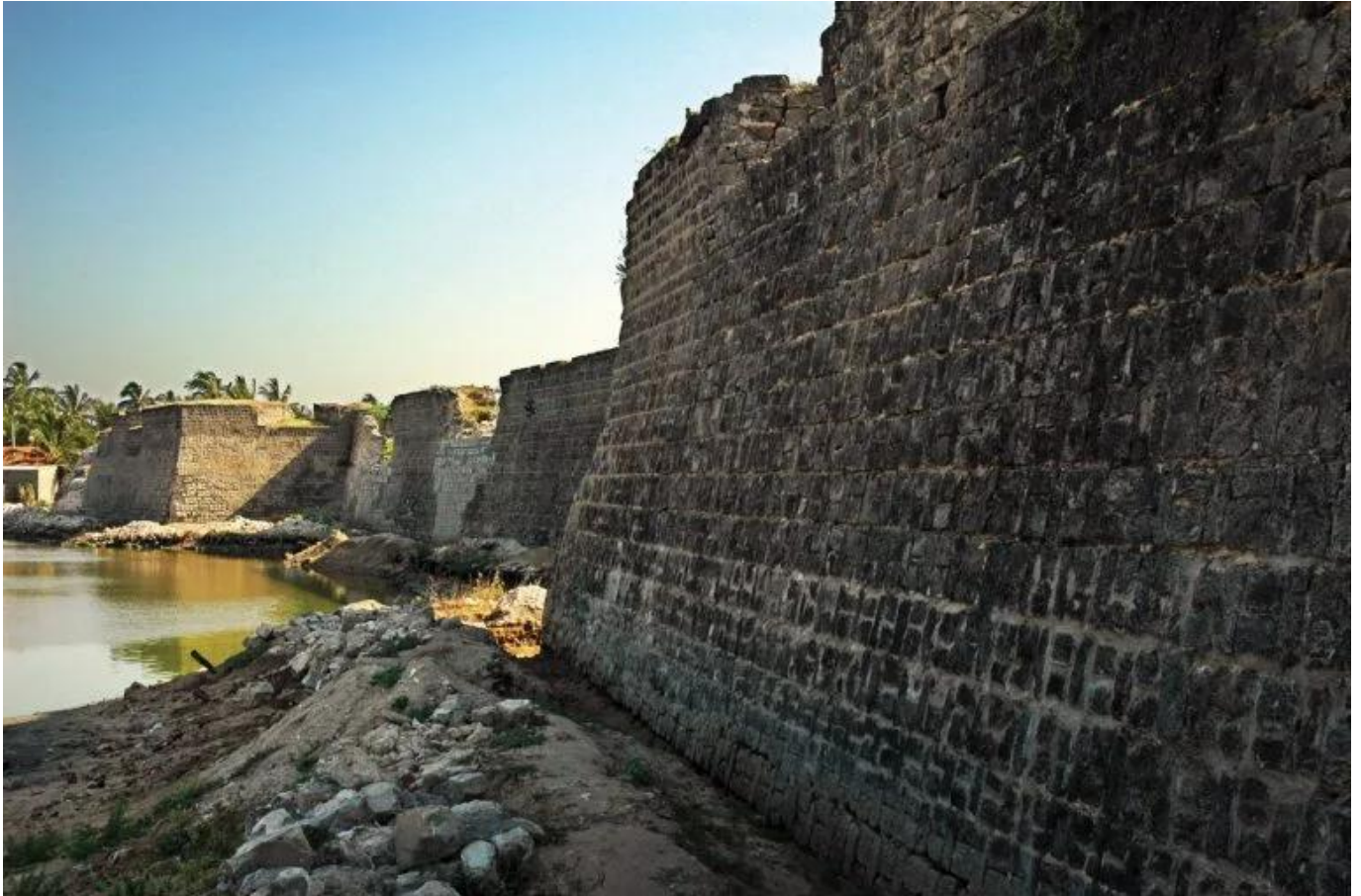
Fort of Mannar (Photo: Anders Tunek).

The 700-year-old Baobab tree in Mannar town (Photo: Anders Tunek).