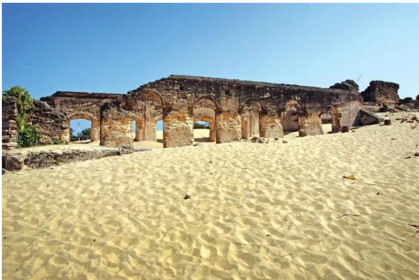
Old Dutch Church in Manalkadu (Photo: Anders Tuneek).