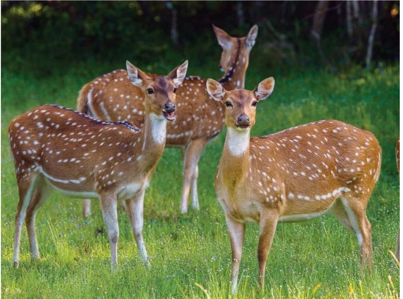
Spotted Deer (Axis Axis).