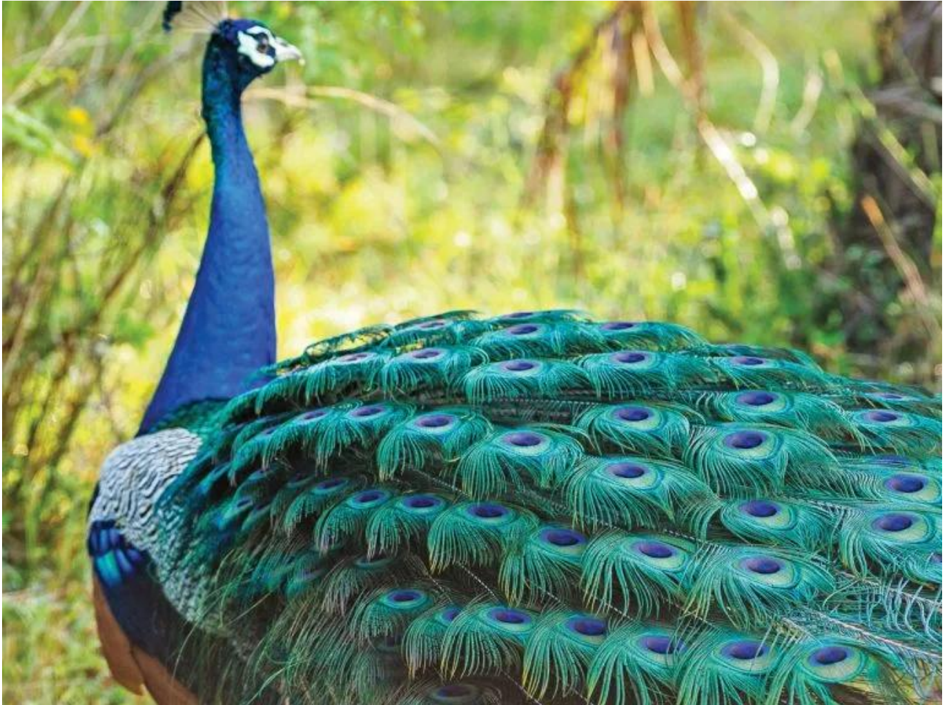
Peacock ( Pavo Cristatus ).

Wilpattu is not the most visited national park in Sri Lanka, although it is the largest.