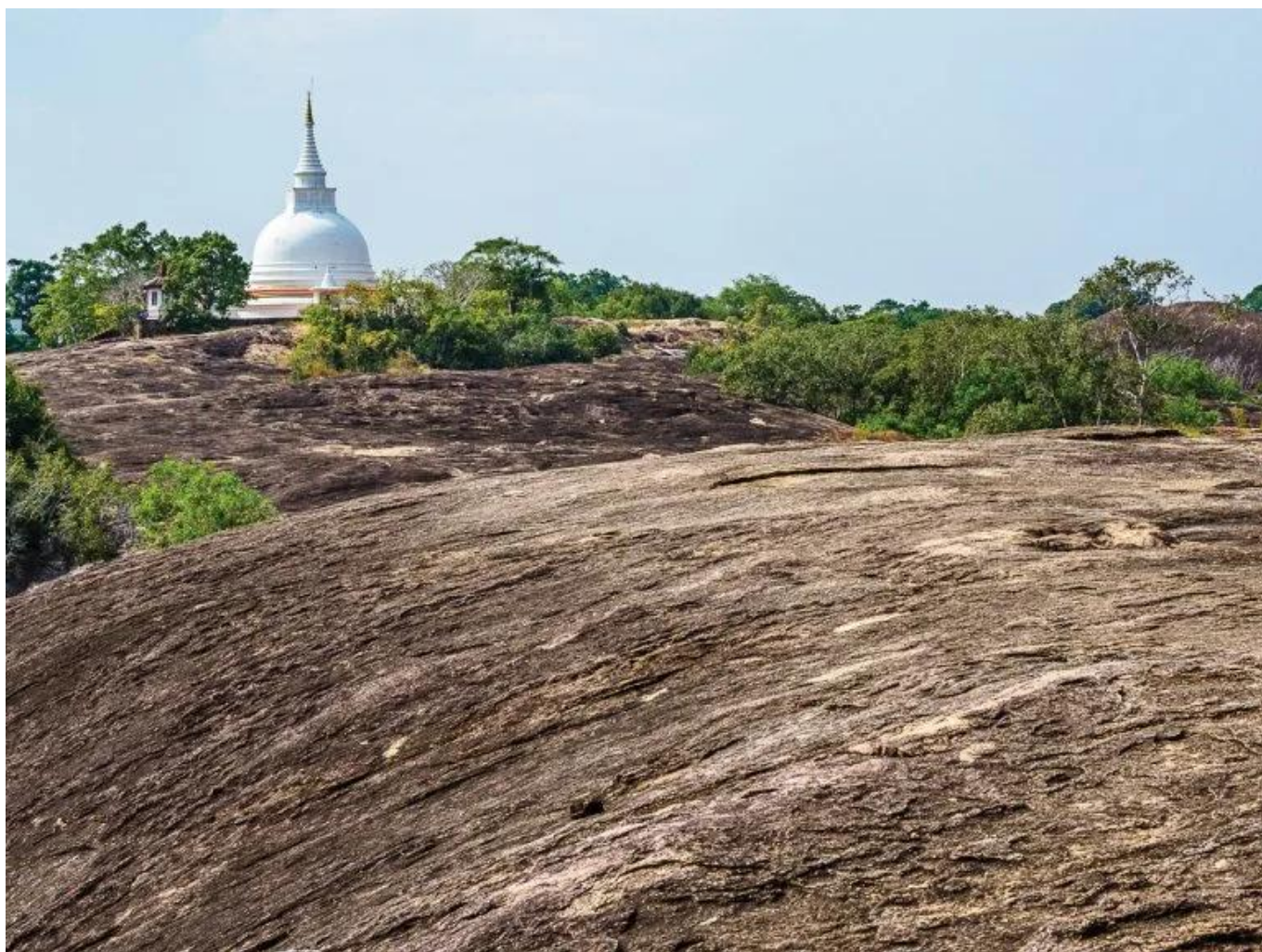
The temple at Thanthirimale, founded in the fourth century AD.