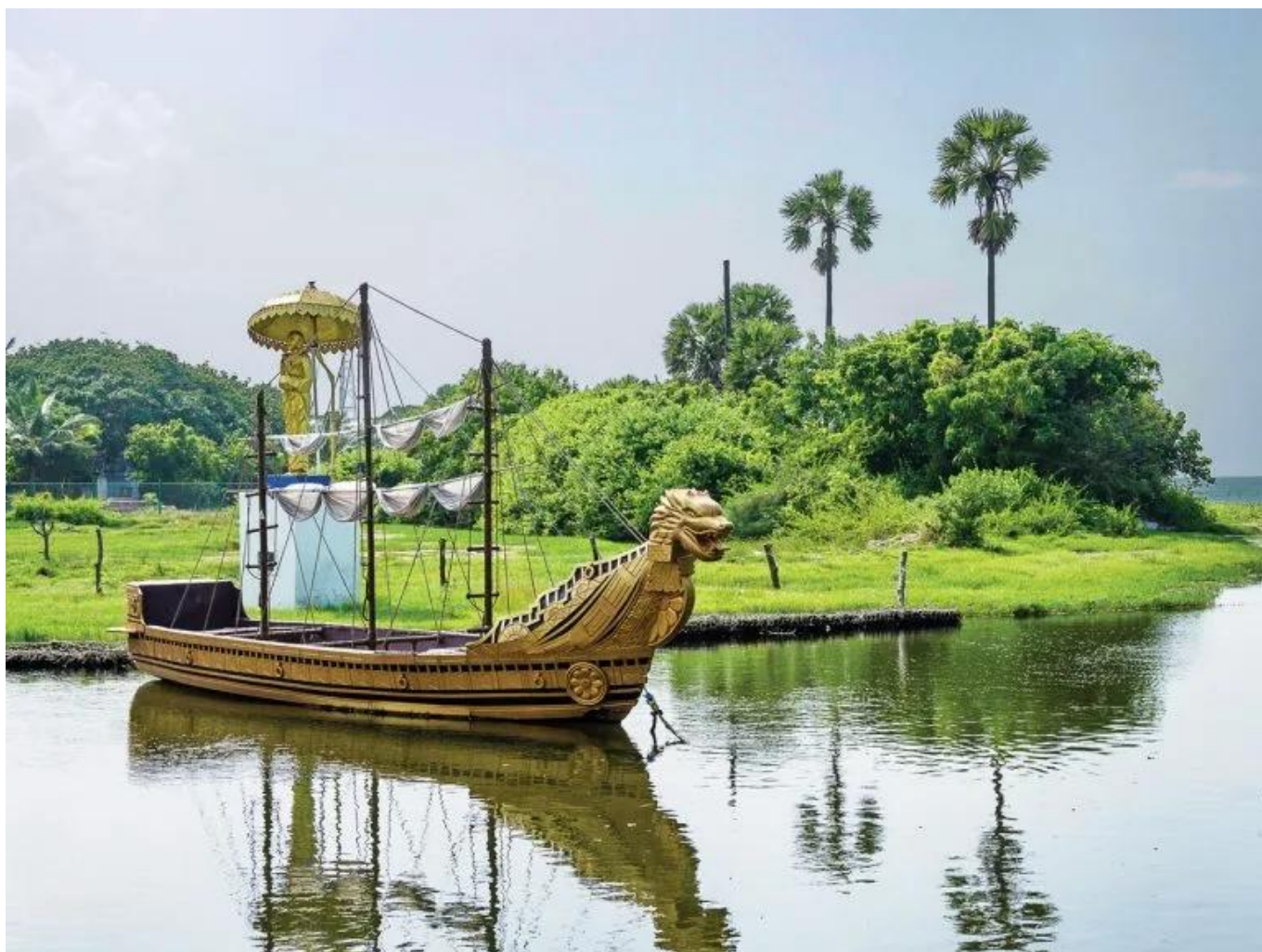
At Dambakola Patuna. A replica of the boat carrying Ven Sangamitta Theri to Sri Lanka from India.