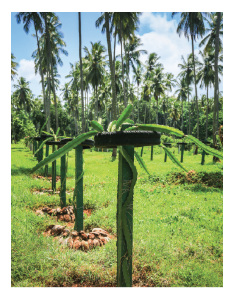
Dragon fruits are planted in an area of about an acre.