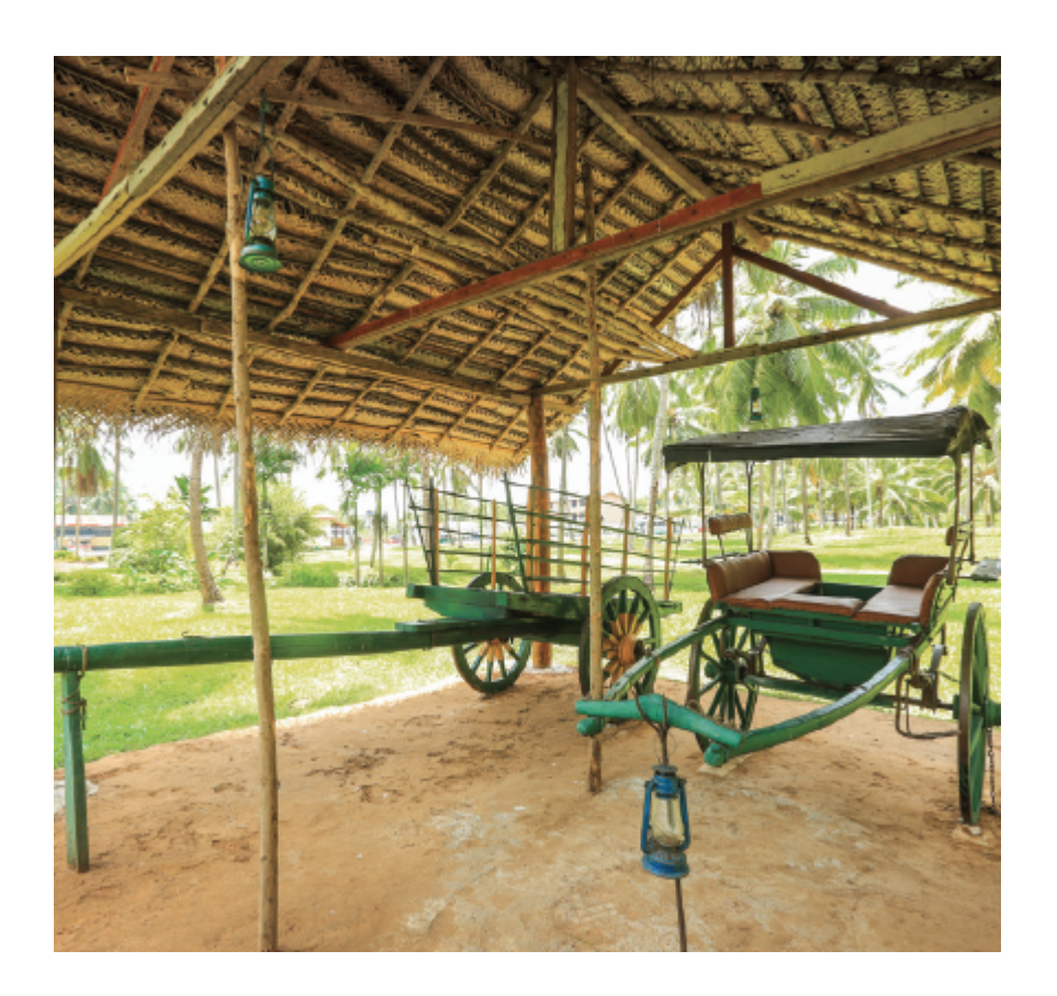
Transport modes of yesteryear.