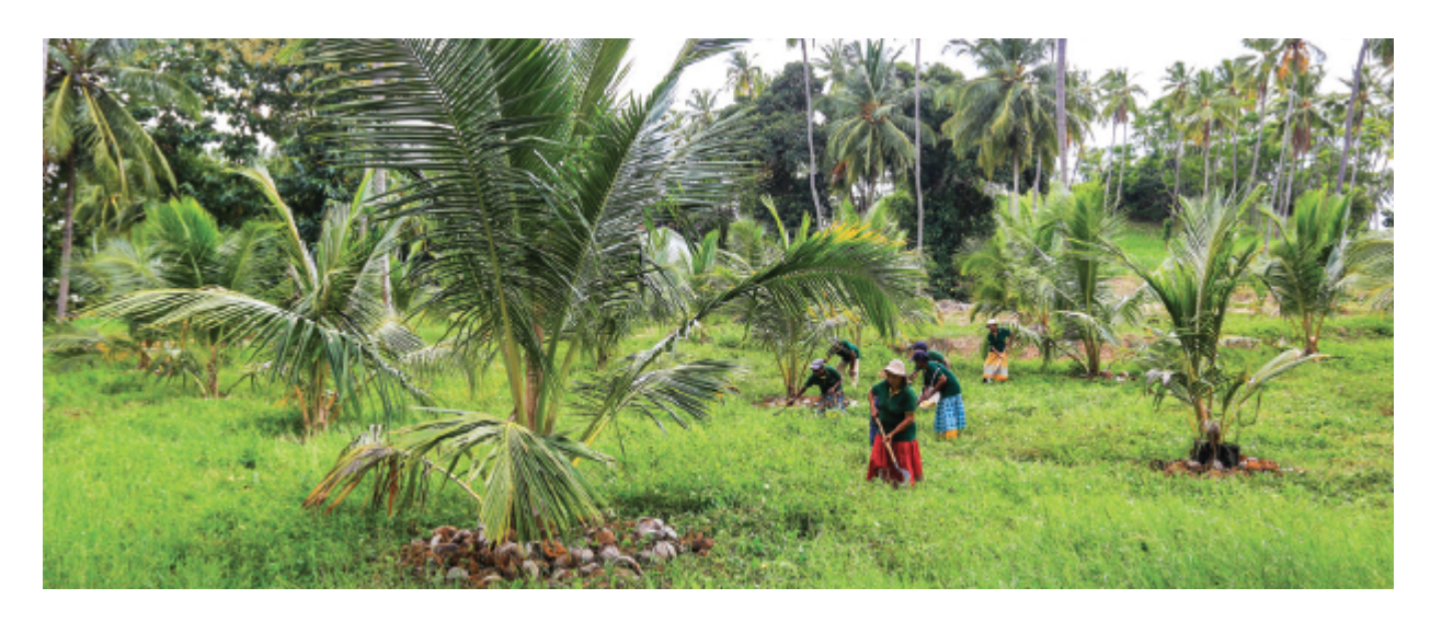
The Plantation is regularly cleaned of undergrowth and well nurtured for replenishment of coconut trees.