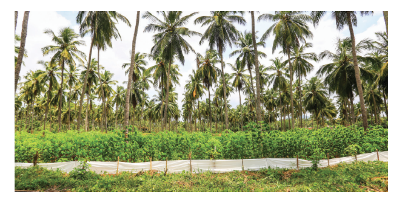
The coconut plantation is intercropped with other varieties such as manioc.