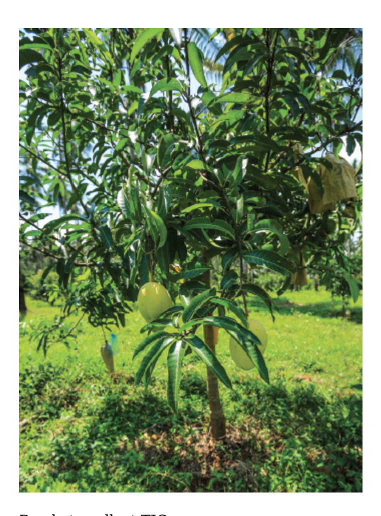
Ready to collect TJC mangoes.