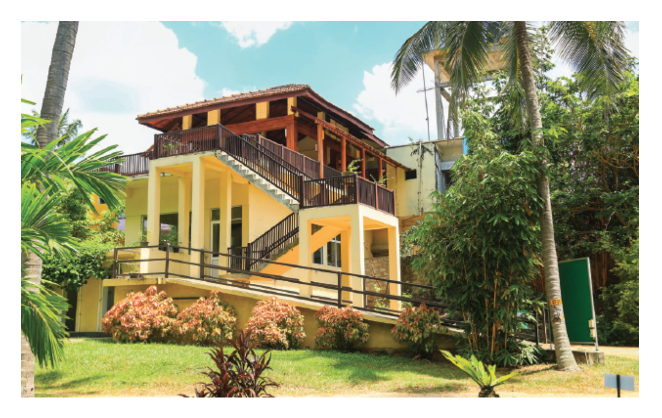
The restaurant that has been provided as a self-employment initiative to the women of the village.