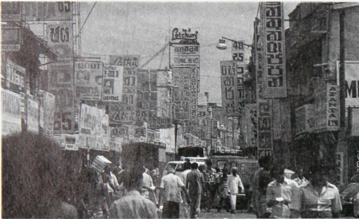
The heart of Pettah -a treasure trove of trinkets.