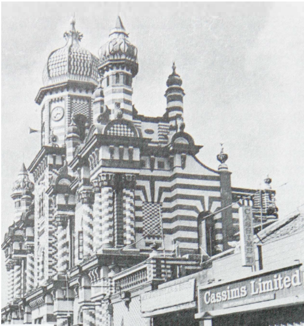
The red and white banded Pettah Mosque. on Second Cross Street.

Lanka's delights lie invitingly ahead of you: the golden beaches the ruined cities and lush tea gardens in the cool highlands. They are readily accessible from Colombo-the roads passable, the distances short and the train is spewing out a nostalgic hiss-waiting to carry you off.