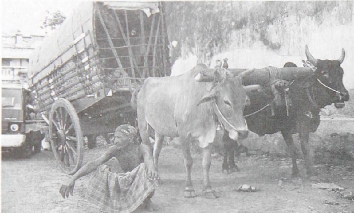
A bullock cart with wizened owner rest in a quiet alley amidst the downtown rush.