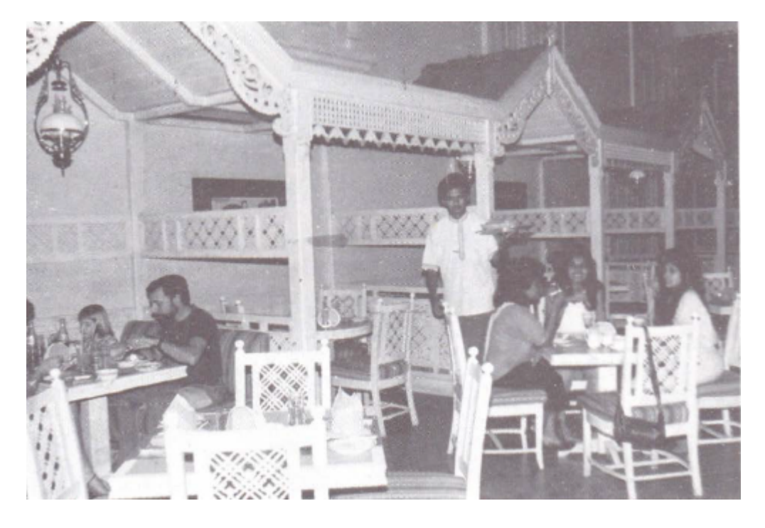
Ports of Call Restaurant at the Taj Samudra Hotel.