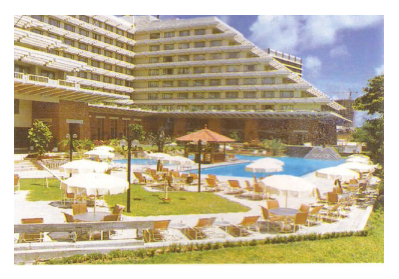
Poolside Terrace at the Ramada Renaissance, Colombo.