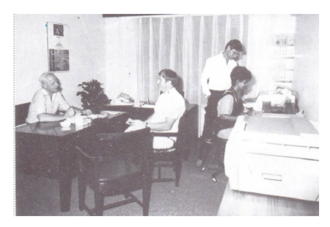
Inside the Business Centre at the Hotel Ceylon Inter-Continental, Colombo.