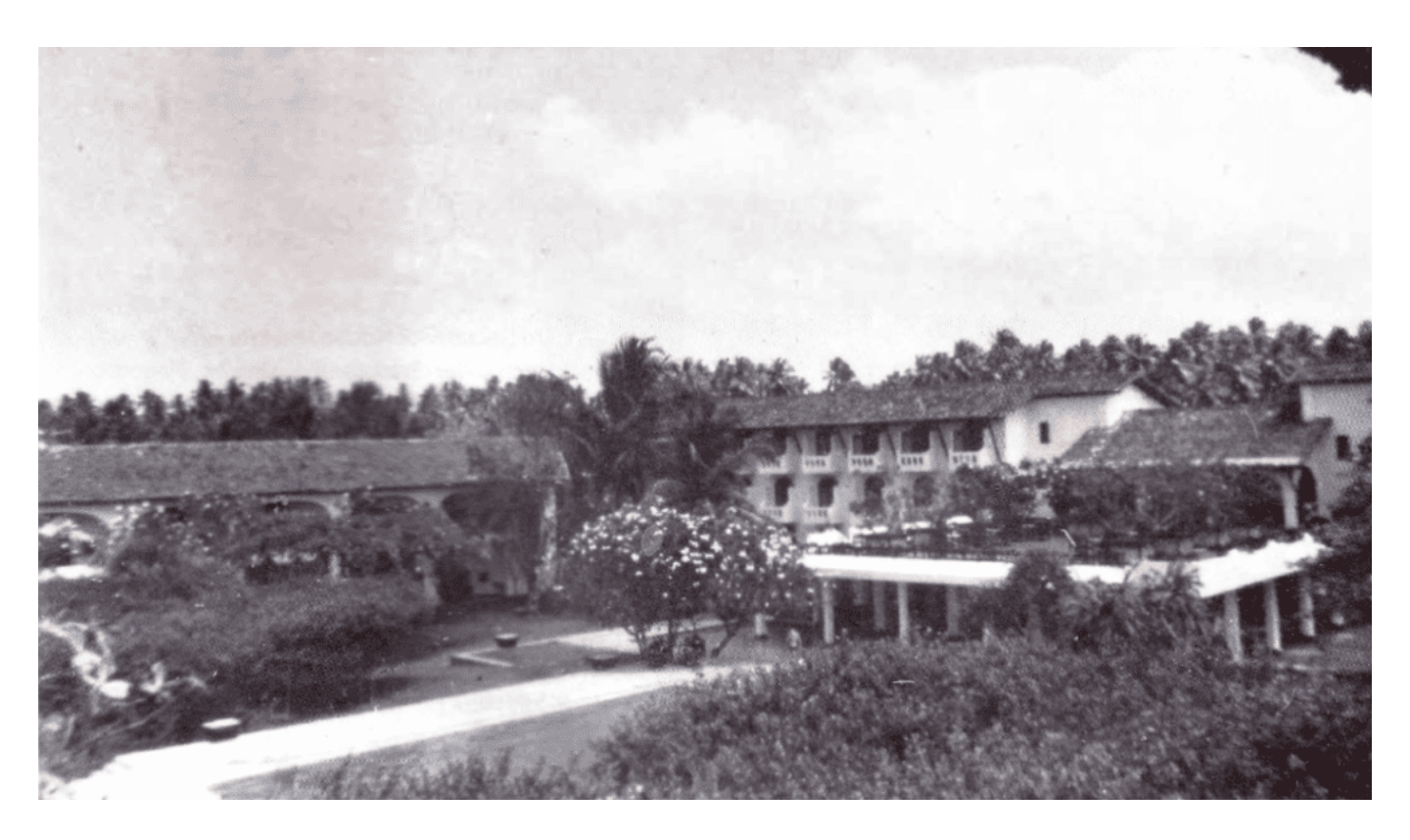
A view of the Hotel Neptune amidst all its greenery at Beruwela.