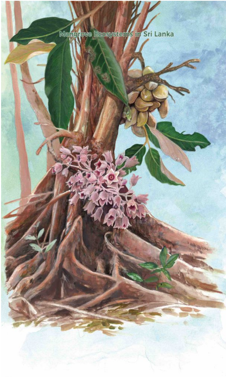
Looking-glass Tree by Pulasthi Ediriweera.