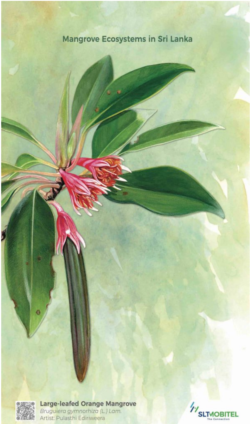
Large-leafed Orange Mangrove