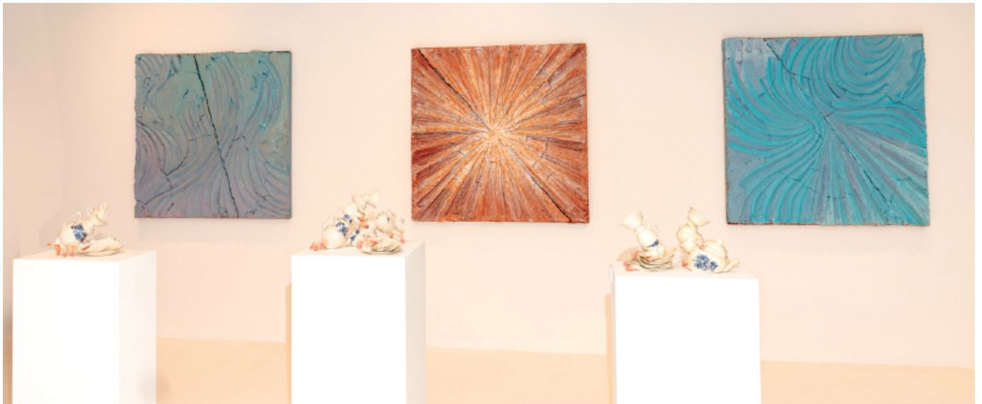
Figurative sculptures by Ronit Baranga.