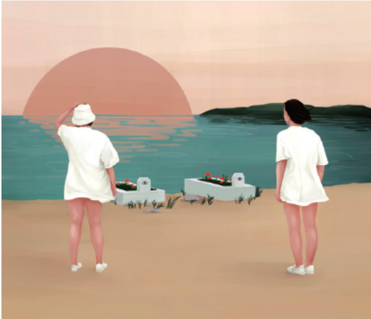
Beyond the death by Ece Haskan.