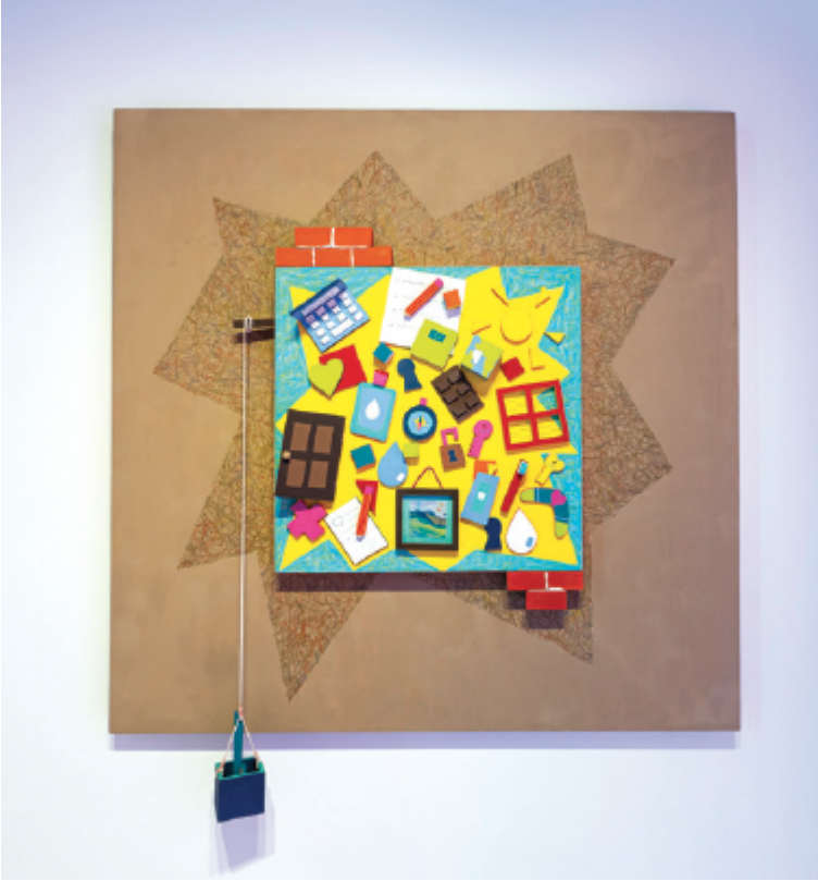
Three-dimensional wooden sculptures based on two-dimensional drawings by Ece Ağırtmış.