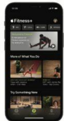
The browse experience in Apple Fitness+ makes getting started with a great workout quick and simple.