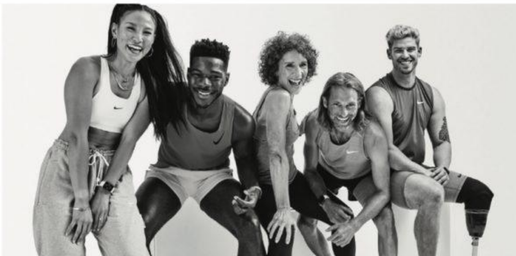
The Fitness+ trainers are a diverse, inclusive, and approachable team made up of people with their own unique and inspiring story.