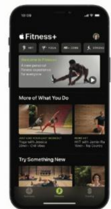
The browse experience in Apple Fitness+ makes getting started with a great workout quick and simple.