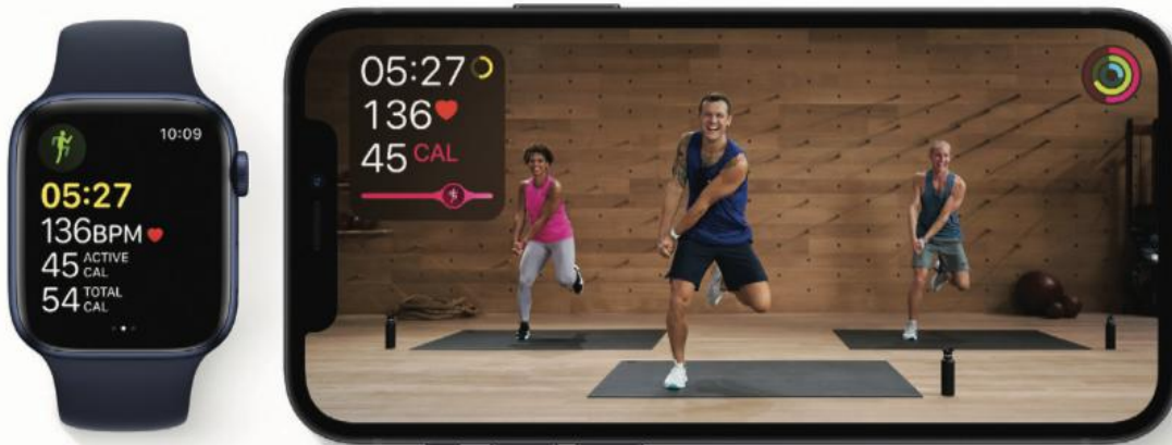
Apple Fitness+, the first fitness experience built around Apple Watch.