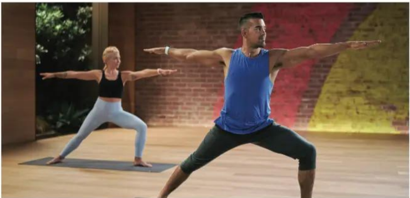
Dustin Brown leads a Yoga workout on Fitness+.

Apple Fitness+ intelligently incorporates workout metrics from Apple Watch for a first-of-its-kind personalized and immersive workout experience.