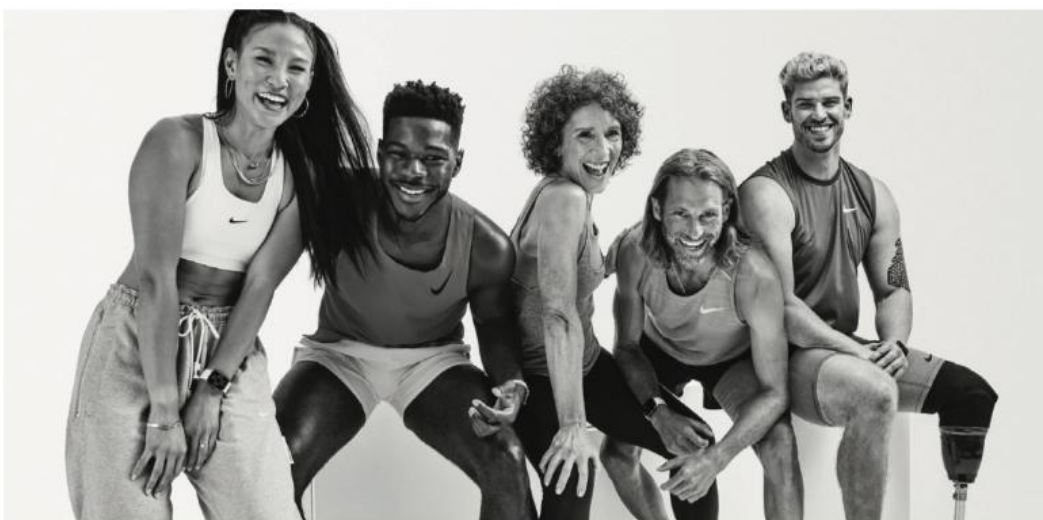
The Fitness+ trainers are a diverse, inclusive, and approachable team made up of people with their own unique and inspiring story.