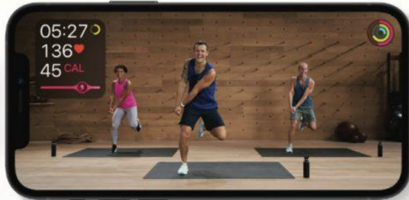
Apple Fitness+, the first fitness experience built around Apple Watch.