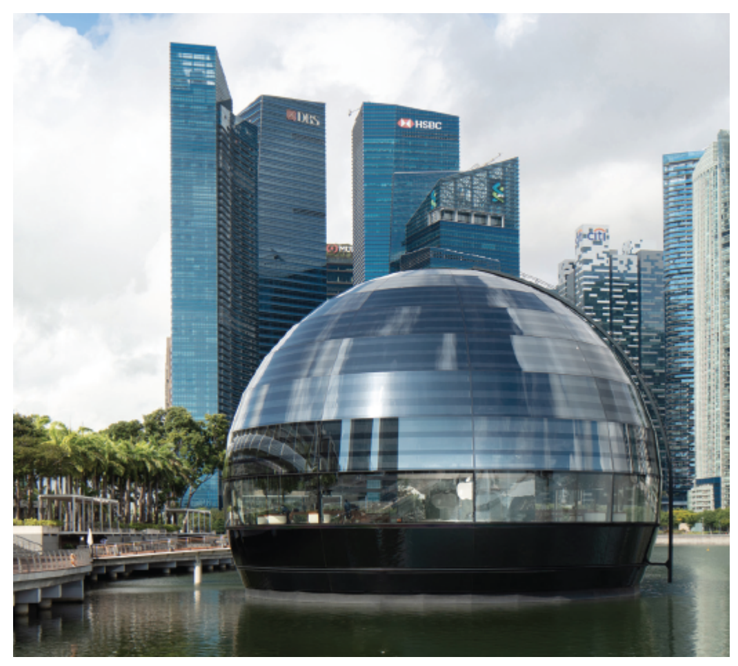
The mesmeric structure floats on the Singapore Bay.