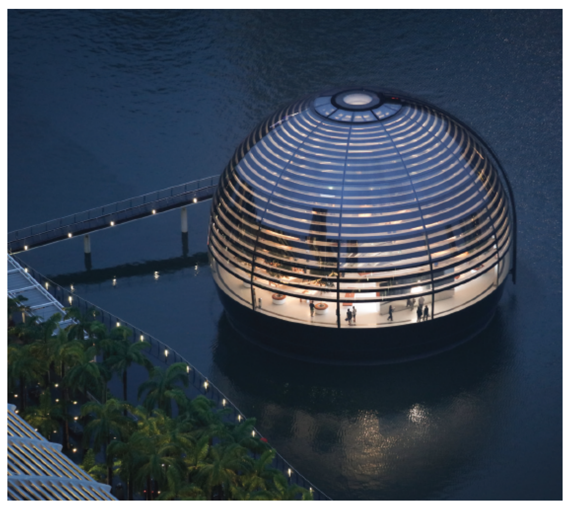
The unique landmark floats reflecting a celebration of light.