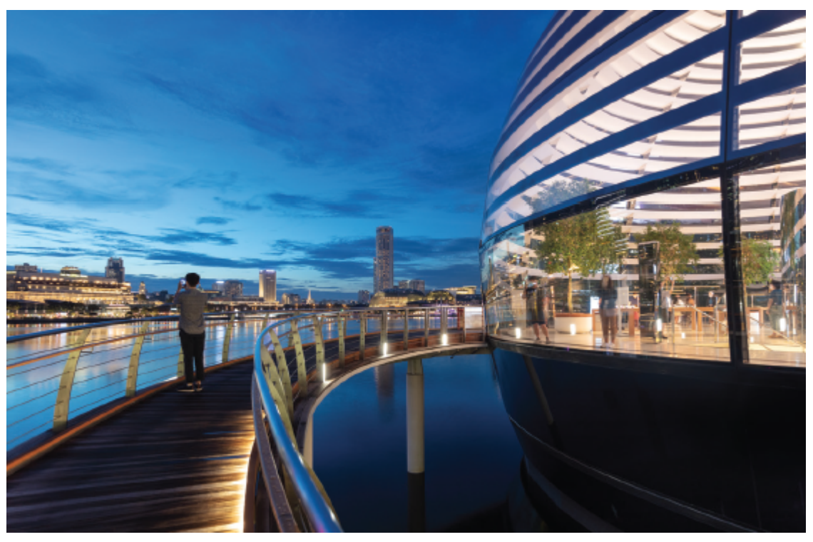
Visitors can engulf in stunning vistas of the Marina.