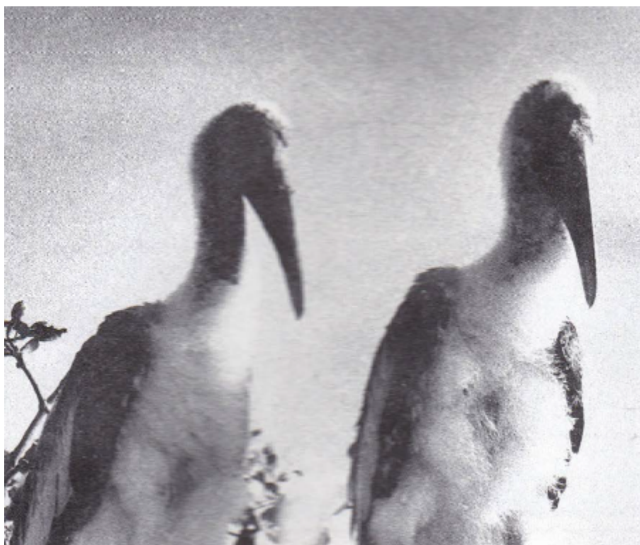
Young Painted Stork nestling.