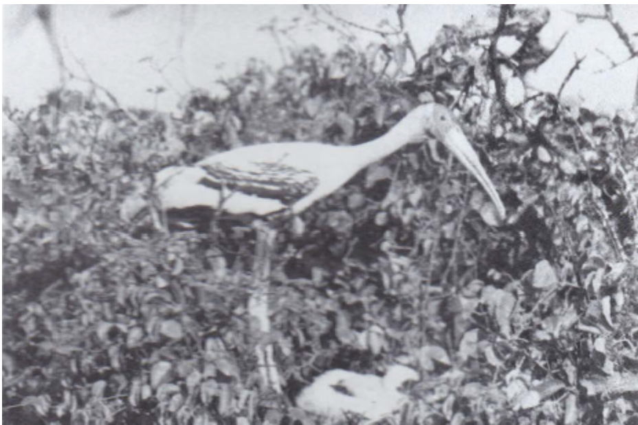
A Painted Stork with young.

If ever you feel like putting in a stint of watching, you don't have to pack a bag and trek to the wilds of the Dry Zone. The Colombo Zoo offers you the perfect setting for observing the ceaseless activities of a large colony of Sri Lankan waterbirds at close range. The Zoo is open daily from 6 a.m. to 6 p.m. and charges a nominal entrance fee. It also offers restaurant, picnic and parking facilities.