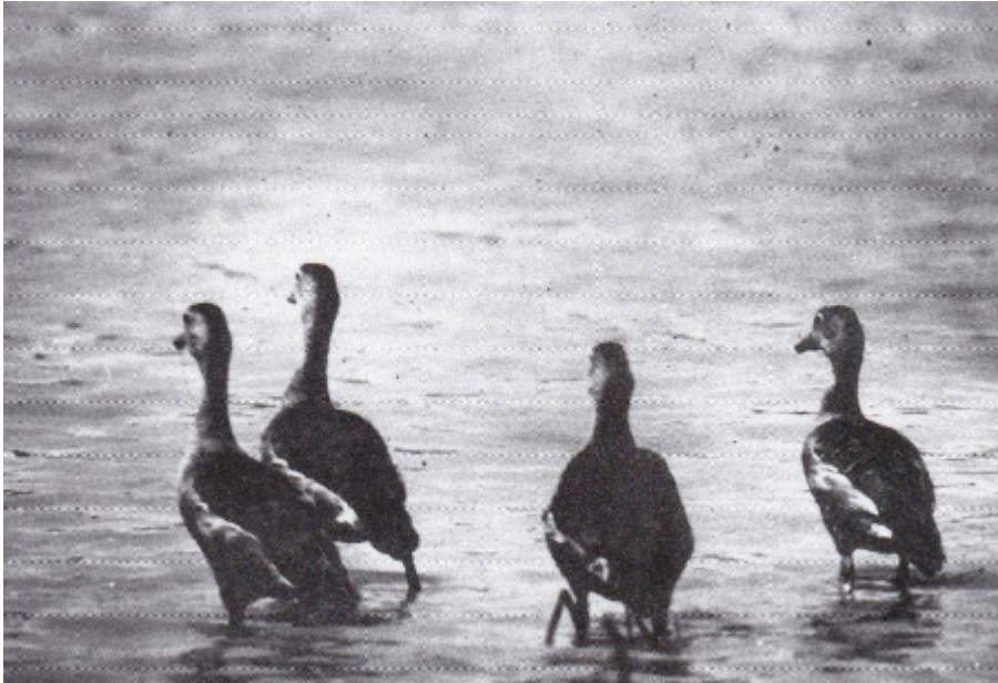
Teal are among the better known water birds' of Sri Lanka.