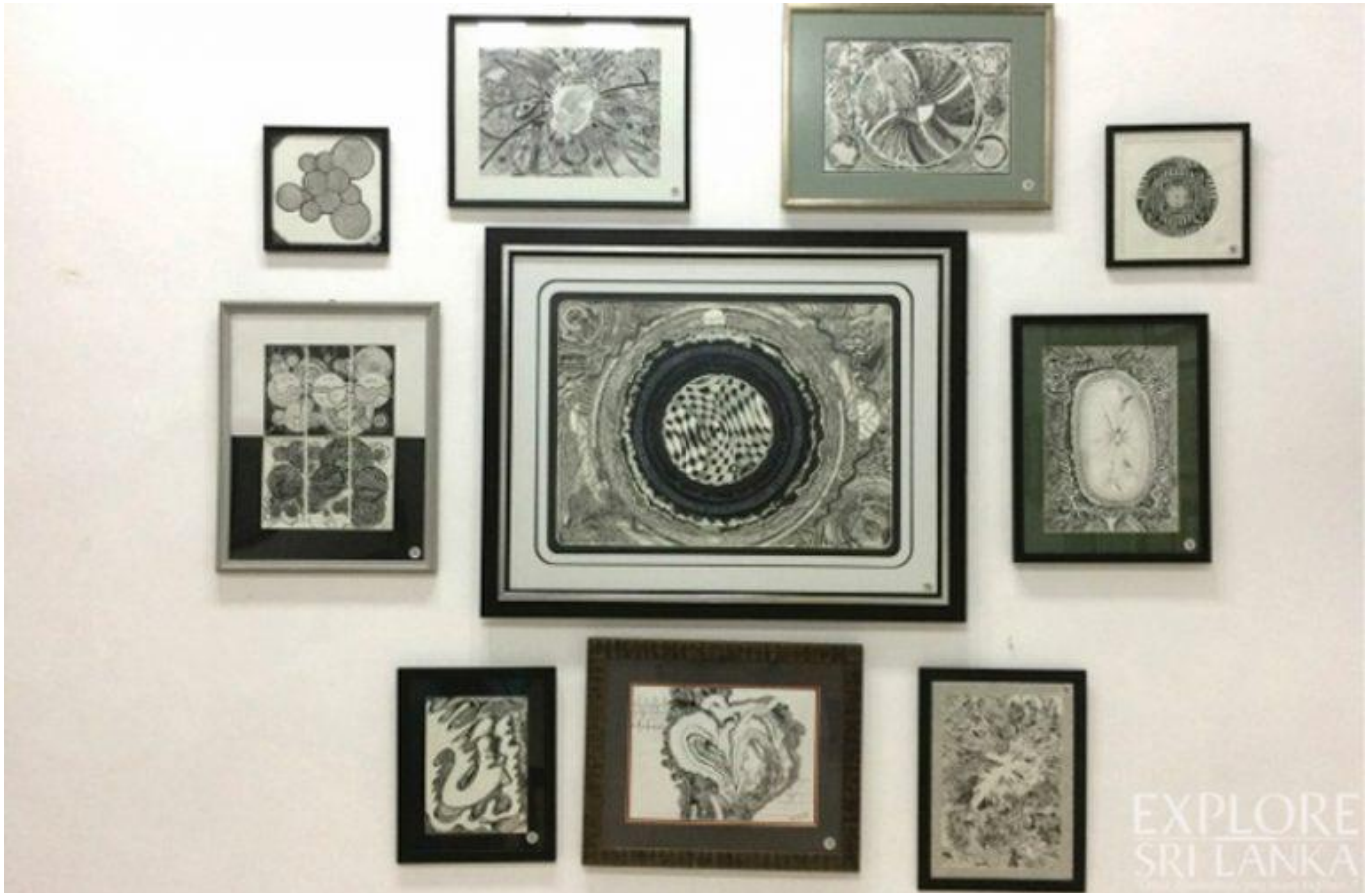
The exquisite works on display at the BlackLit Galleria