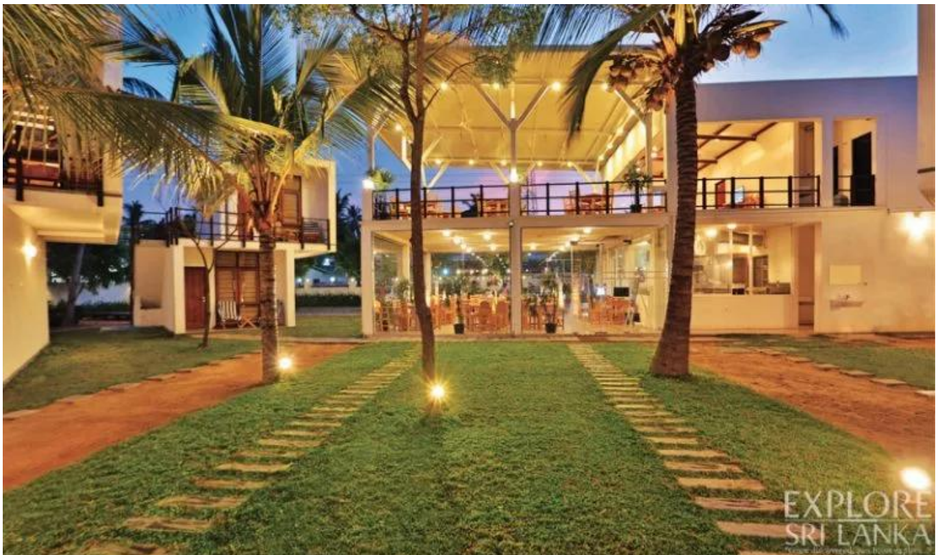
Evenings are great at Arugambay Roccas

22 perfectly symmetrical cubes- commodious rooms with attached bathrooms face the stunning turquoise blue waters of the sea, surrounding the Water Cube. Of the 22 cubes, 11 are located at ground level and offer verandas where guests can sit reading a book or napping, while the remaining first floor 11 cubes offer balconies where guests can enjoy the breeze and observe the seascape. The air-conditioned rooms offer hot water and Wi-Fi. Whilst the interior is compact and has a simple layout, there is elegance within the rooms.