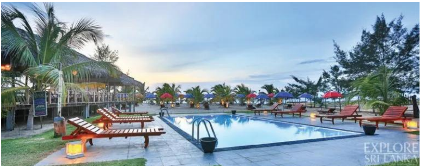
Lounge on the sun beds near the Water Hole as the sun sets

The Kadal is the chill-out lounge and is just a short walk away from the Water Hole. Raised above the ground on a platform, the Kadal's combination of dancing (rocking) as well as sleeping (lounging) chairs, stunning views of the ocean and the sound of waves crashing against the beach are capable of lulling the guest to a relaxing stupor. The Tamil word 'kadal' means 'sea' and is the perfect name for this chill-out area from where you can hear the constant thunder of waves.