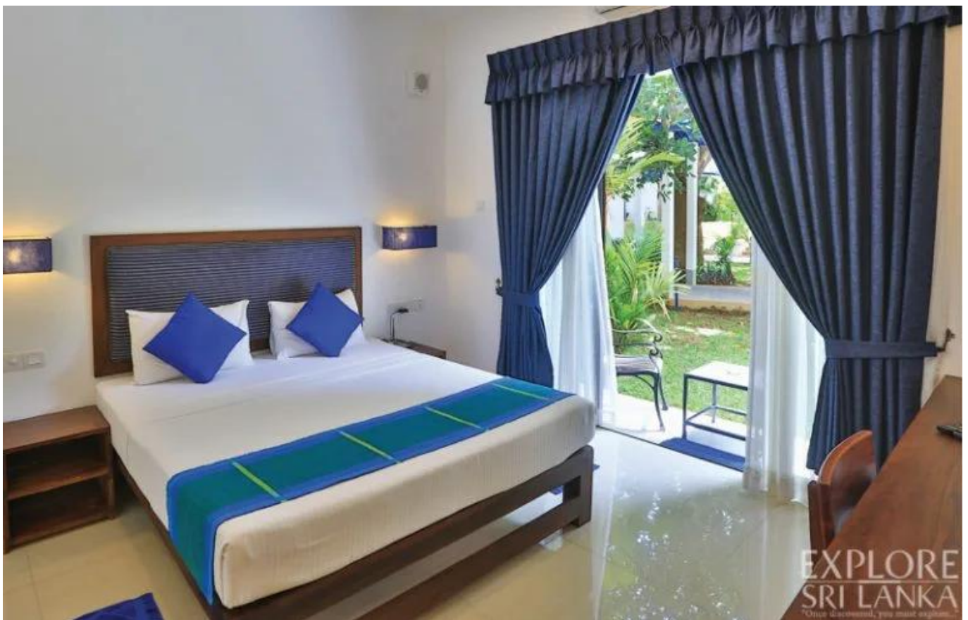
The makings of a comfortable stay

King-sized beds in double and triple rooms are perfect for families. However, Blue Wave offers three additional twin rooms and four rooms with interconnecting facilities for large families. There is a room that has been designated for differently abled guests' convenience as well. Each room from the first floor up offer private balconies.