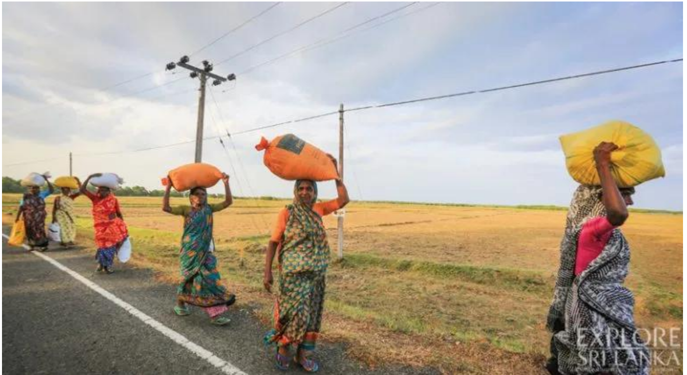
After a busy day of harvesting paddy

specific time to visit. The weather is glorious throughout the year.