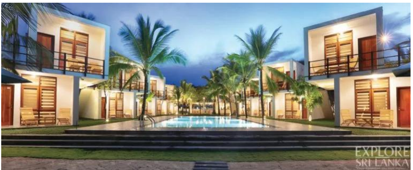
The Water Cube looks like a fairy tale oasis

The visitor steps outside the Square to the grassy lawn bordered by coconut and neem trees. The pathway across the lawn leads up to the Water Cube. At the attached pool for children, young guests play in the water.