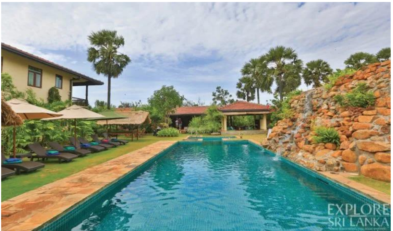
A miniature waterfall cascades into the pool

The open-air area where you can lounge in comfort either reading a book or simply relaxing makes it ideal for the yoga classes conducted during the day.