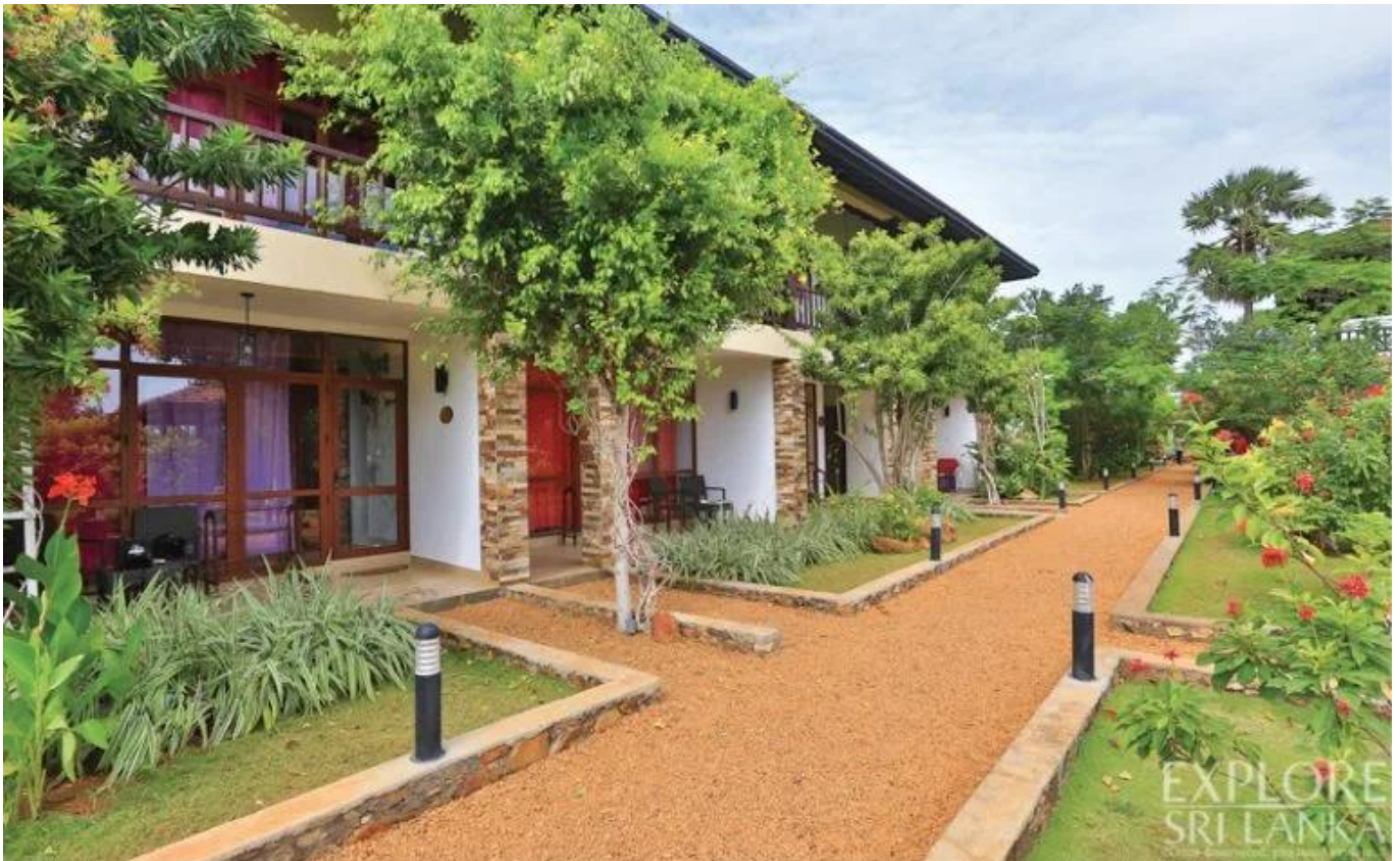
A garden paradise