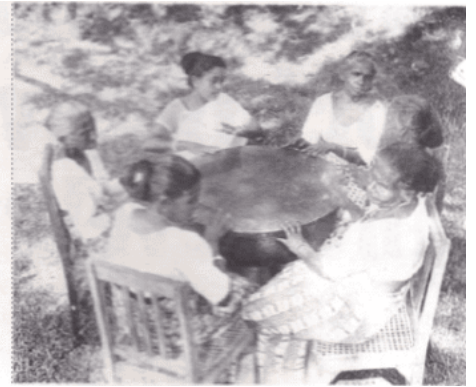
Climbing the grease-pole and pillow fighting - traditional events at New Year celebrations. The women of the village gather round the Rabana, to beat out age-old rhythms. (Suresh de Silva)