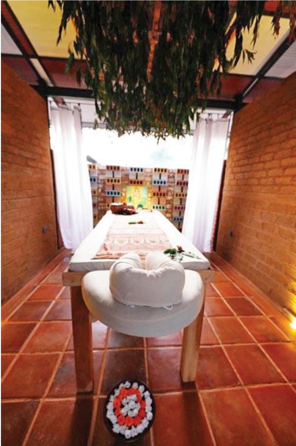
Ayurvie Sigiriya offer guests a range of ayurvedic goodness.