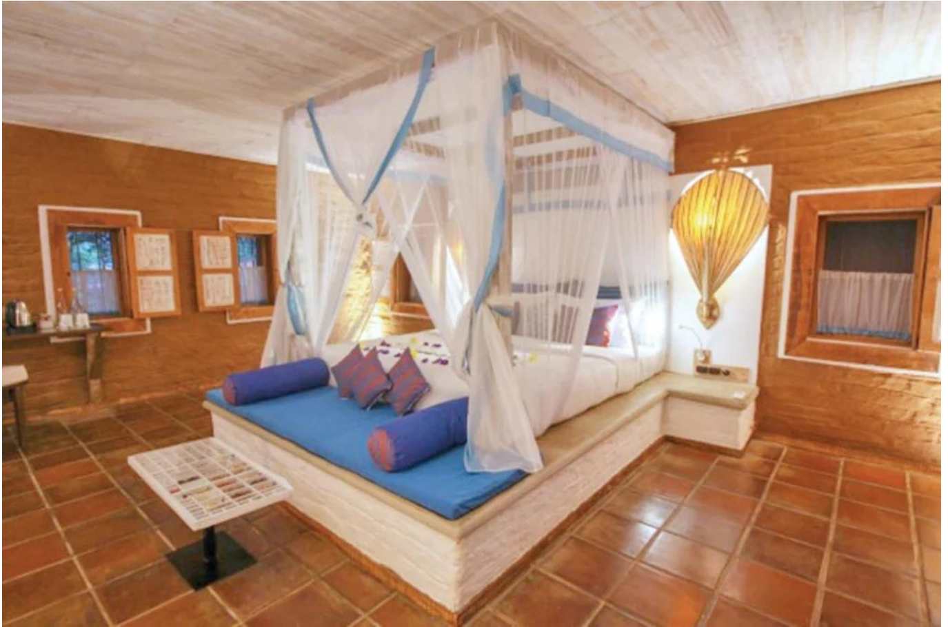
Ayurvie Sigiriya offer guests a range of ayurvedic goodness.