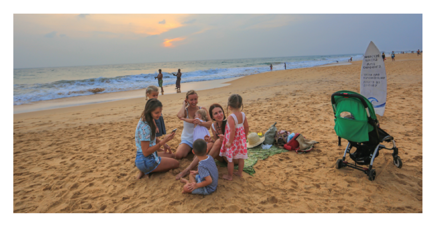
Families and young ones enjoy themselves on the Narigama beach.