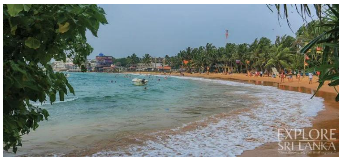
Unwind amidst the laidback atmosphere of the tropics

The evening light was turning to dusk as the sun set in the southern sky. As if being called by the whispers of the ocean, those on the beach walked almost in unison towards their respective abodes. Lights twinkled on, creating a lovely atmosphere. From Hikkaduwa, passing through the town we proceeded along the Galle Road towards Bentota. The view from the bridge, across the lagoon, of the glittering illuminations was mesmerizing in the night sky.