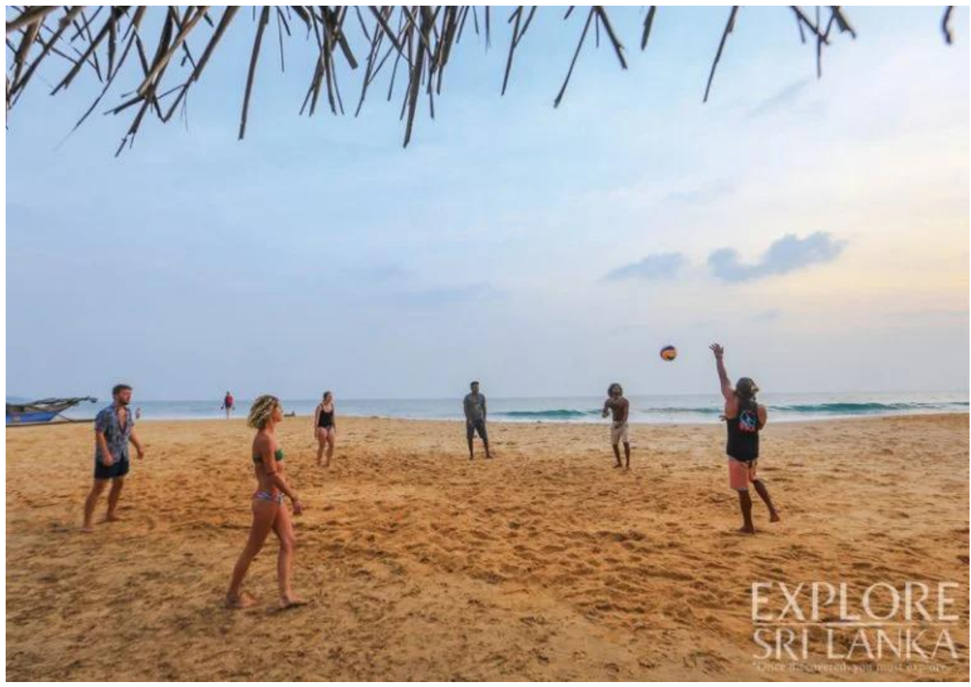
Enjoy your evenings with a game of volleyball in Narigama.

Hikkaduwa is the ideal place for surfing during the months of November to April. Waves can reach up to a height of three to ten feet. Surfboards were arranged at various points, as if indicating that Hikkaduwa was a place to surf. Beginners were practicing on land, balancing themselves on rope, a skill they would need when using a surfboard. Generally, surfers who ride the waves in the east coast during May to October, move towards the south from November to April. Though light was fading, there were surfers waiting for the perfect wave. Balancing on their boards they patiently watched and as soon as a wave rose, they would paddle and instantaneously stand to surf the waves with great skill, balancing and moving to the rhythm.