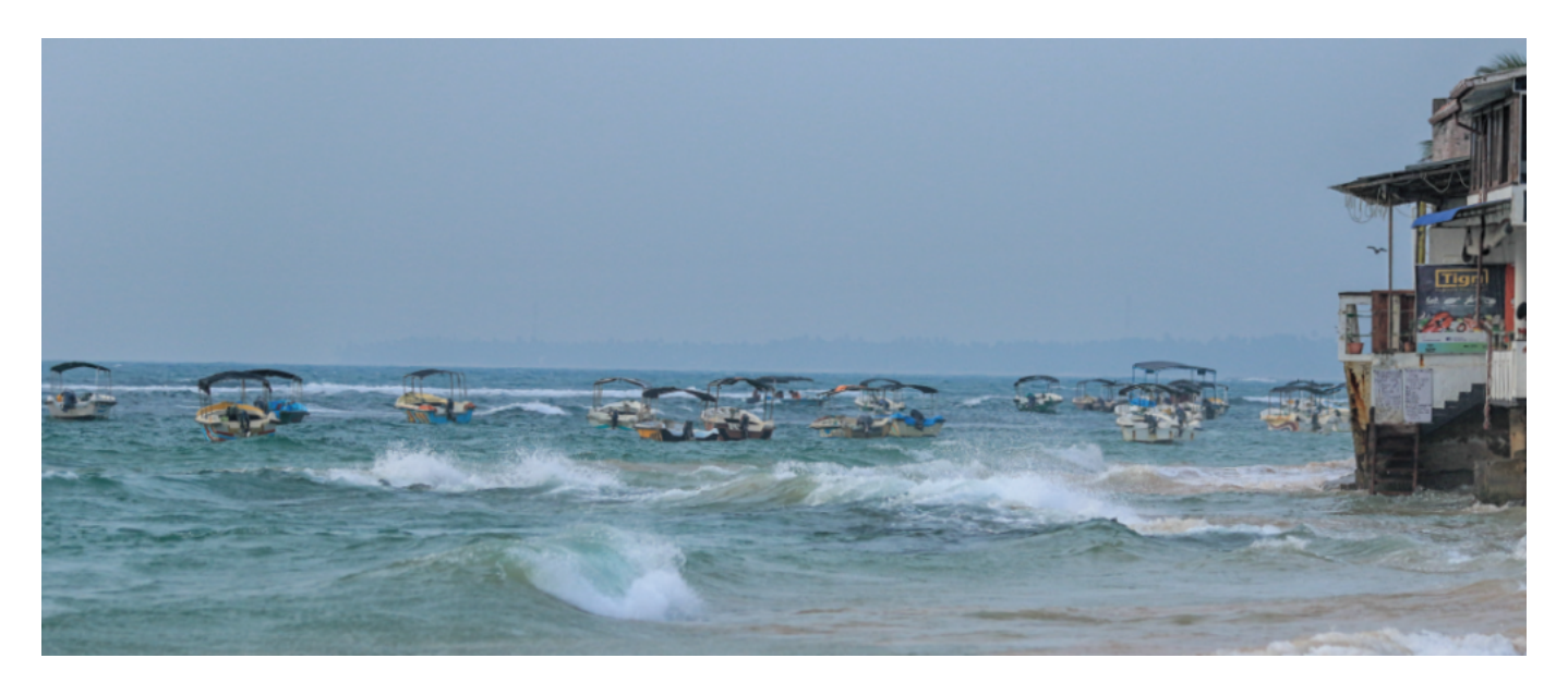
Visitors can embark on a thrilling boat ride over the turquoise waters.