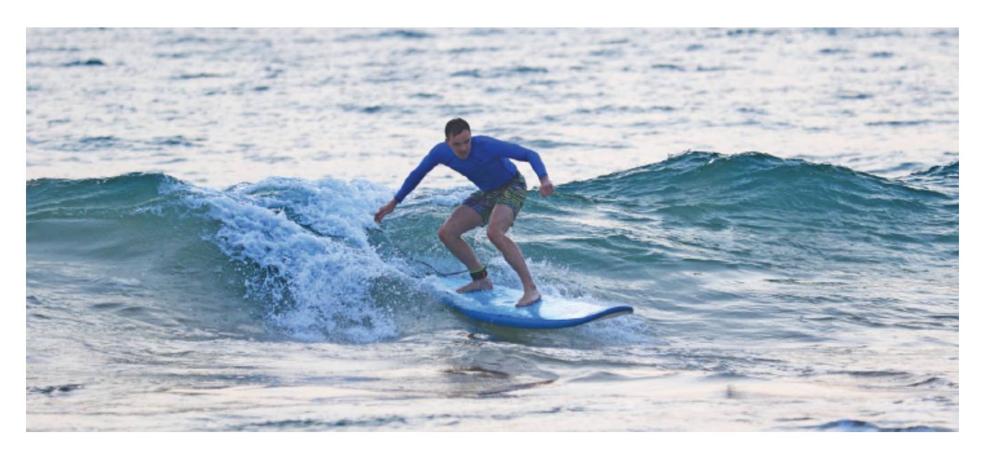
From November to April, Hikkaduwa attracts surfers to ride the waves.