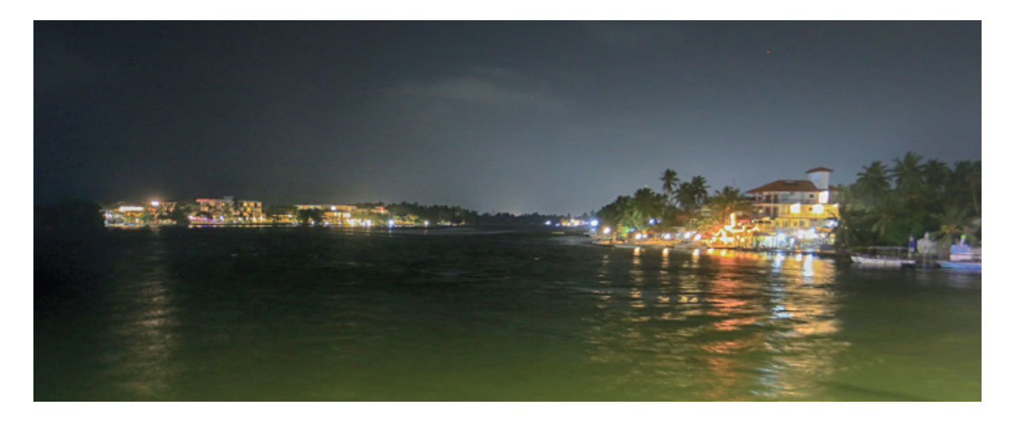
Twinkling lights create a lively and electric atmosphere in Bentota.