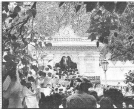
The Sri Maha Bodhiya at Anuradhapura