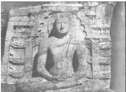
Seated Buddha statue at Gal Vihara Polonnaruwa.

One of the island's largest known irrigation reservoirs is the Parakrama Samudra, a veritable inland sea constructed in the 11th Century.