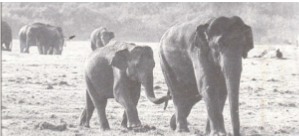
Elephants at Yala