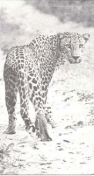
Leopard at Yala