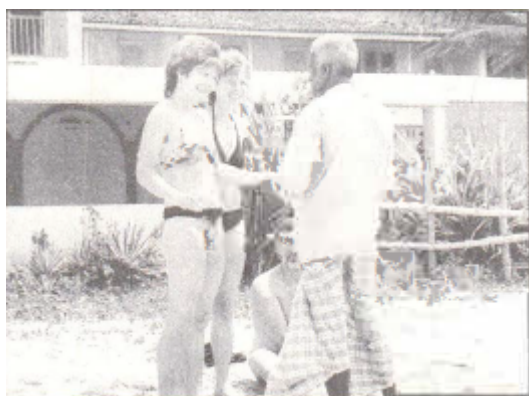
Tourists at Hikkaduwa

99 km from Colombo, caters to the low-budget traveller as well as to the visitors to luxury hotels. Attracted by the lovely • beach and the bright batiks, masks, jewellery and other crafts sold along this strip of Galle Road, visitors to the island have made this a tourist town. A haven for surfers, underwater explorers and water sports enthusiasts, the beaches also attract bathers right through the year. Glassbottomed boats are available for hire to those not inclined to make a dive for a glimpse of the country's best-known coral gardens.