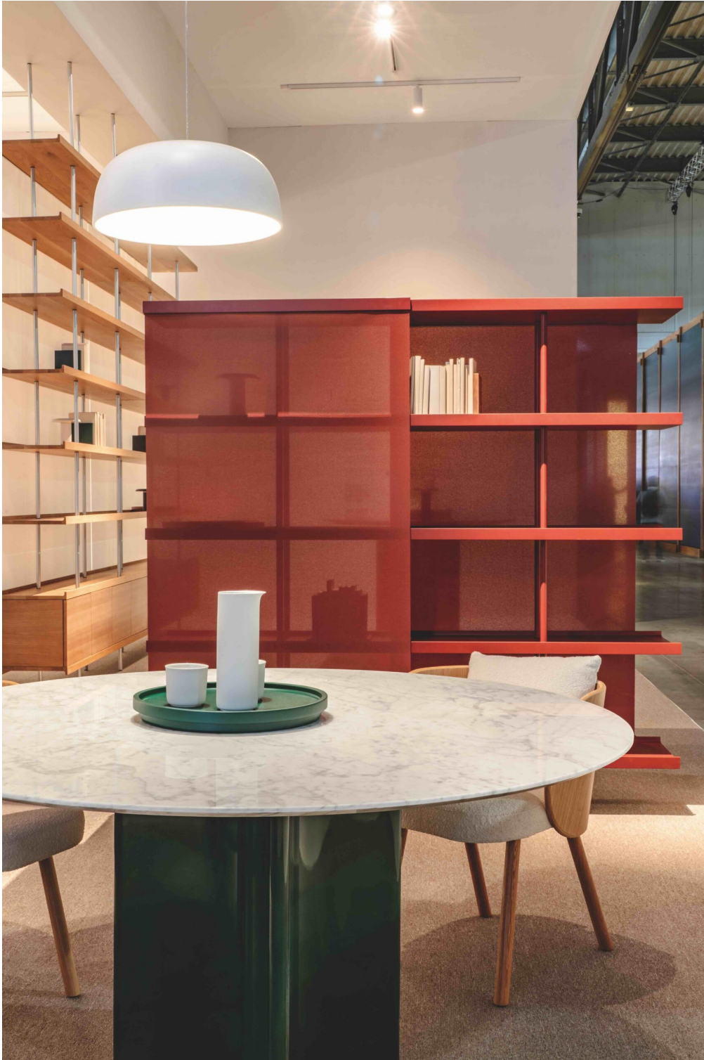
The round dining table (COLUMN collection) and freestanding shelving unit (BEAM collection) on display at Salone del Mobile 2026.