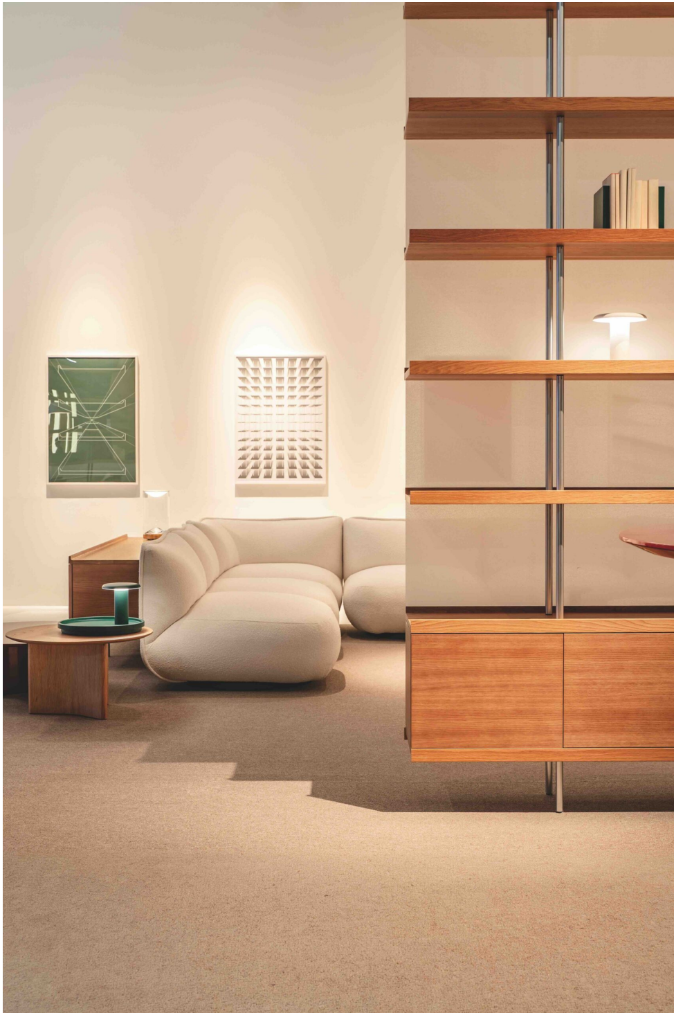
The BEAM collection's ceiling-fixed shelving unit on display at Salone del Mobile 2026.