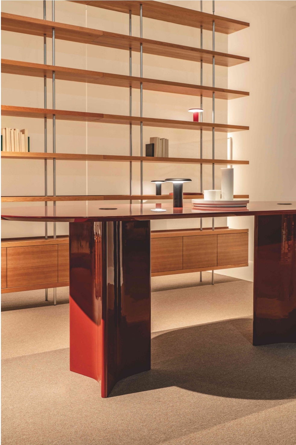
The flat-oval standing table (COLUMN collection) and the ceiling-fixed shelving unit (BEAM collection) on display at Salone del Mobile 2026.