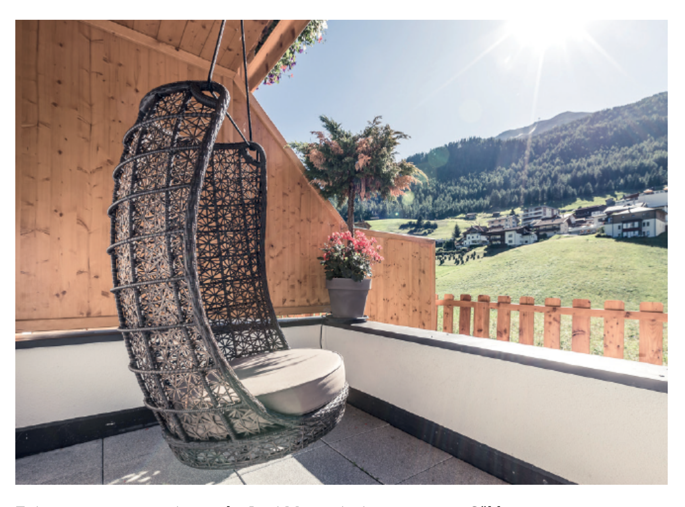
Enjoy a summer vacation at the Leni Mountain Appartements, Sölden .