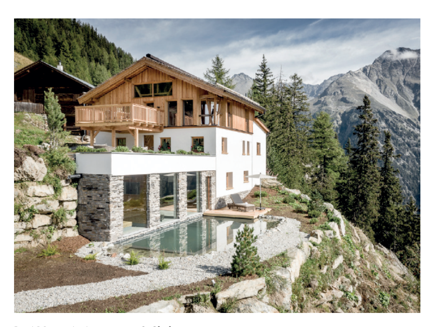
Leni Mountain Apartments & Chalet.