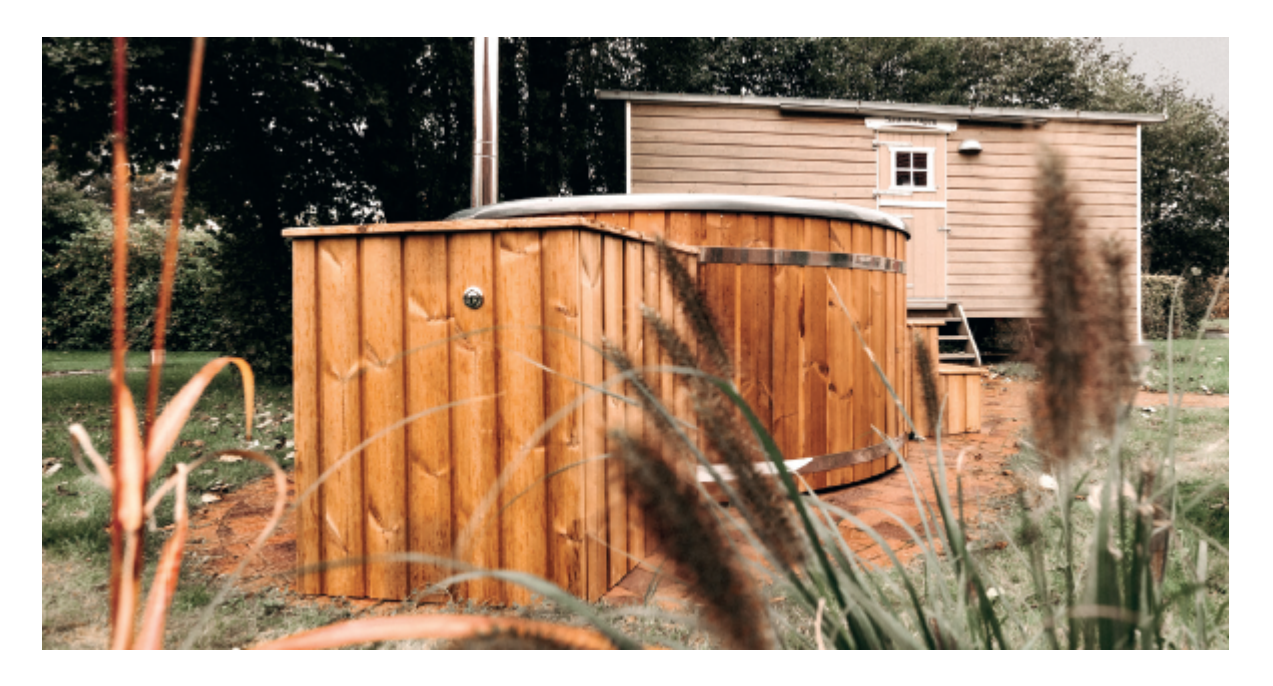
In the midst of the fields, relax your tired limbs in the shepherd's cart sauna or the wooden whirlpool.