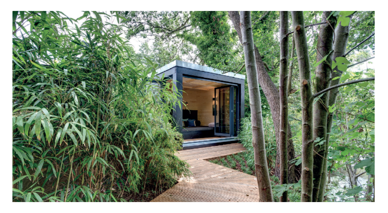
Cubes from Strandhaus Boutique Resort & Spa Spreewald to relax and enjoy nature.