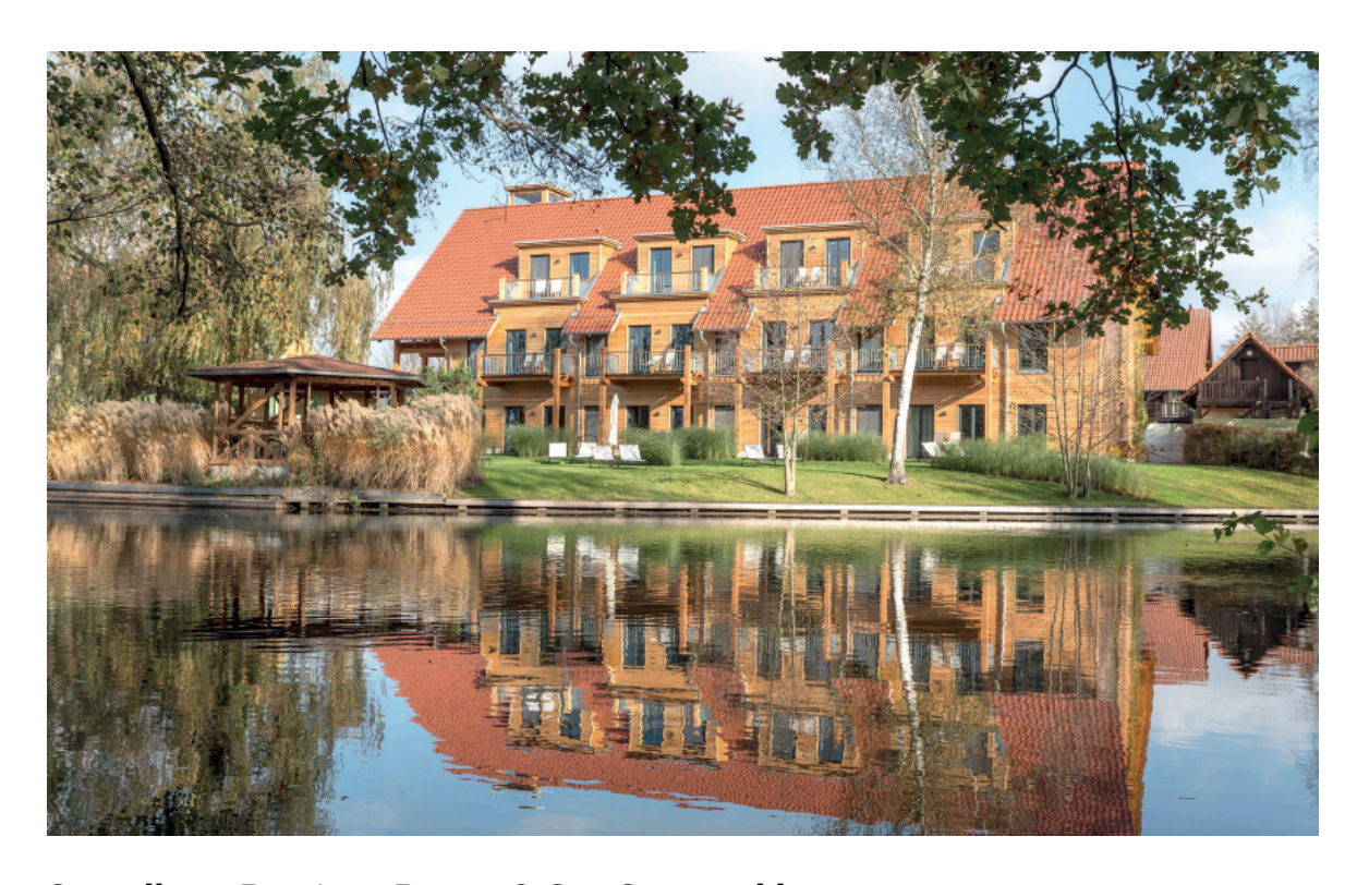
Strandhaus Boutique Resort & Spa Spreewald.