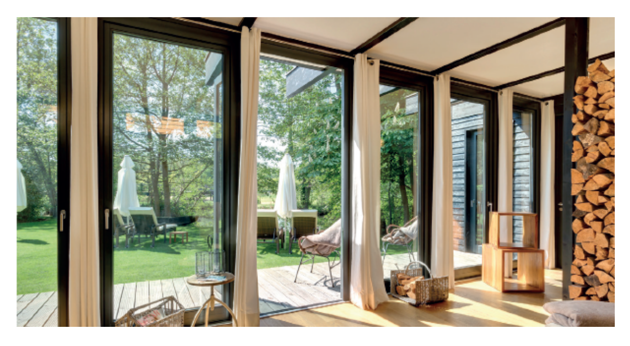
Strandhaus Boutique Resort & Spa Spreewald with spacious rooms, an elegant spa area and fantastic views.