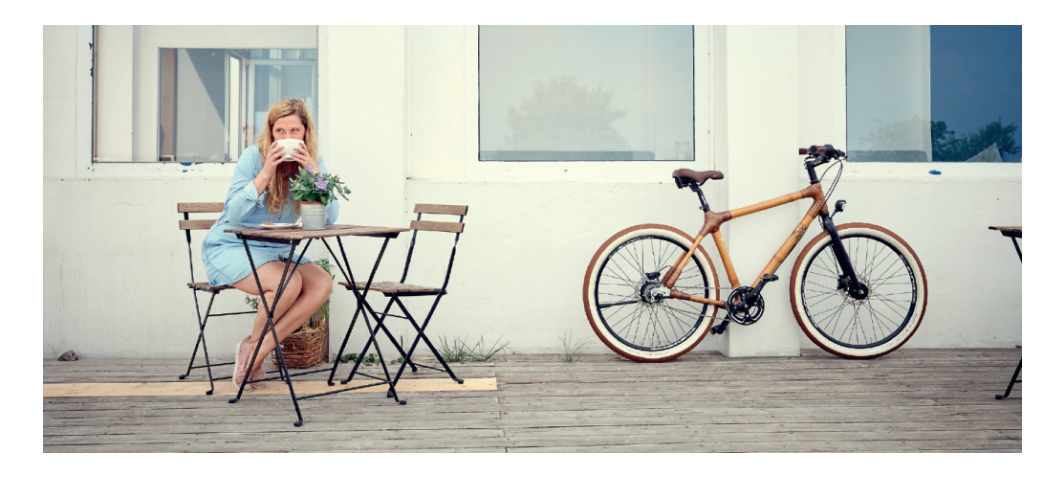
Enjoy refreshing beverages from the café and explore the area from Lifestylehotel SAND.