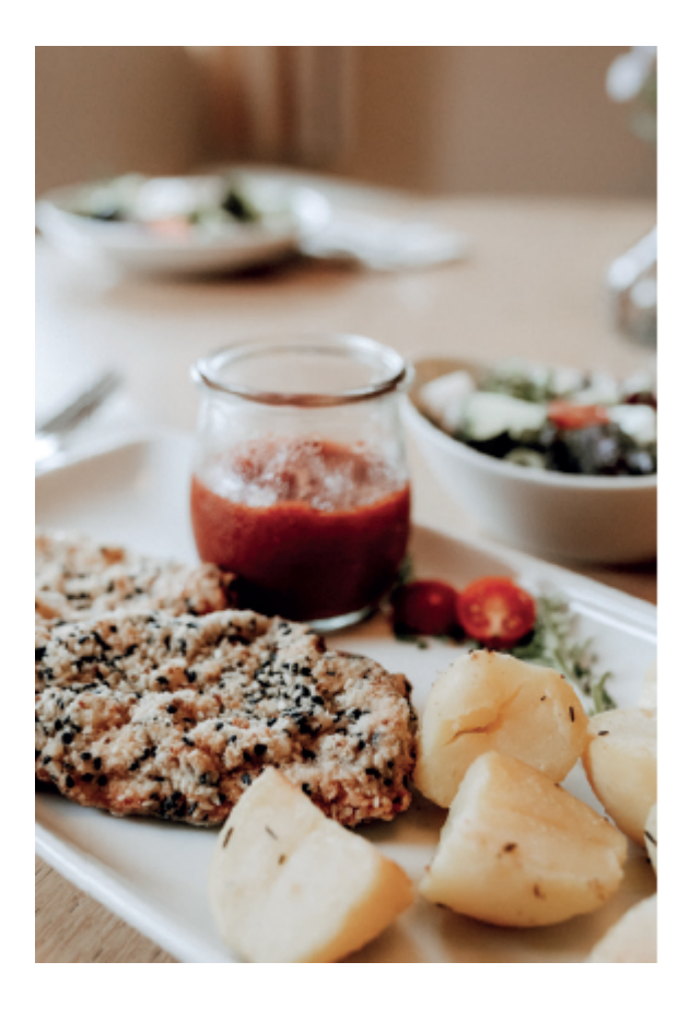
Delightful food from Okelmann's in Warpe.