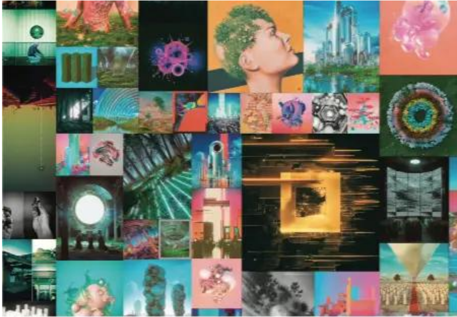
From simple drawings to life in 3D.