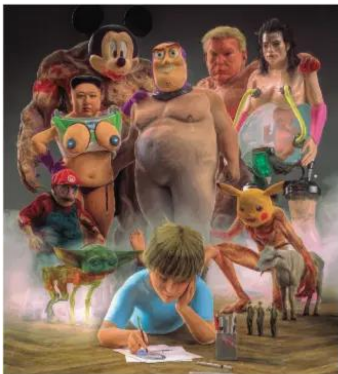
Beeple's evolution: 01.07.21