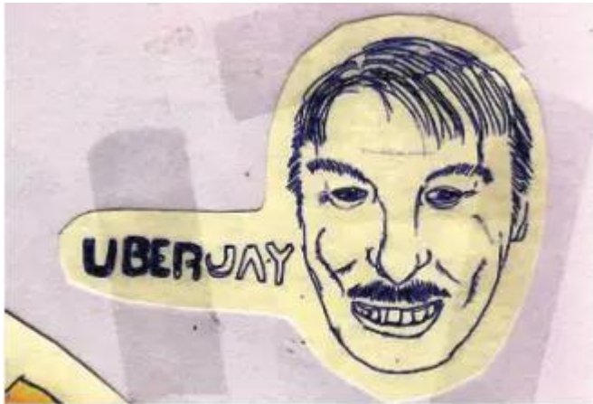
Beeple's evolution: 05.01.07