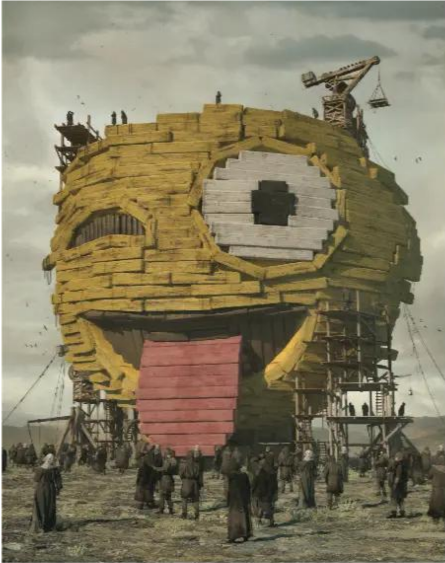
Beeple posted a new work of art online everyday for 13 and a half years.