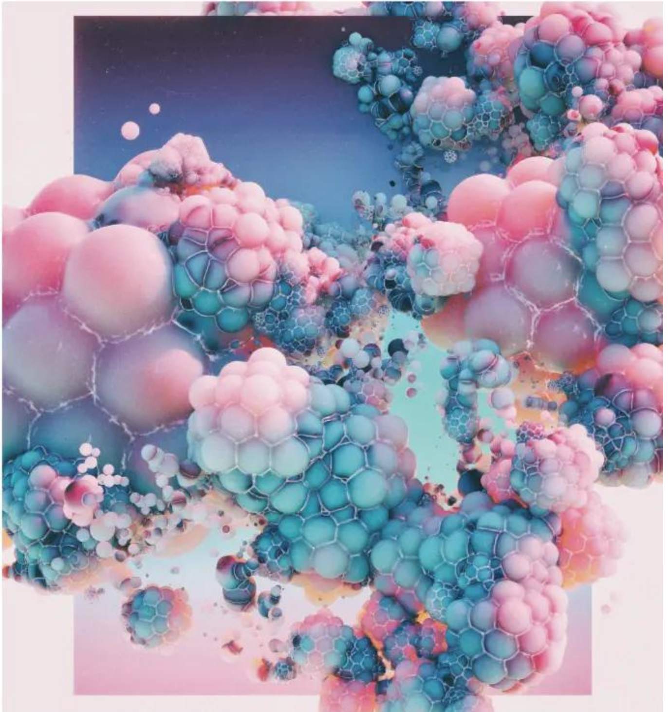
These photographs: zooming in reveals pictures by turn abstract, fantastical, grotesque or absurd, deeply personal or representative of current events.