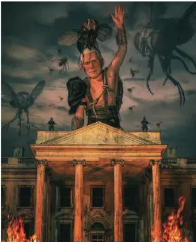
Beeple's evolution: 10.07.20