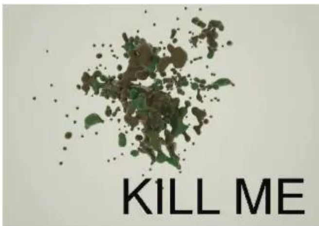
Beeple's evolution: 11.27.14