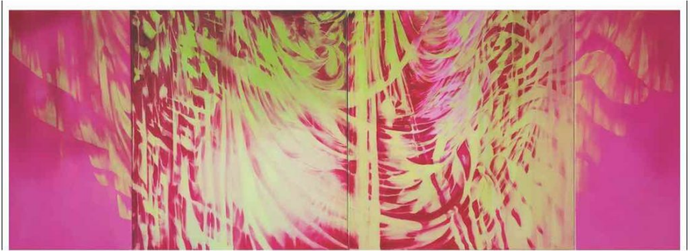
Selvage of Time (2022).