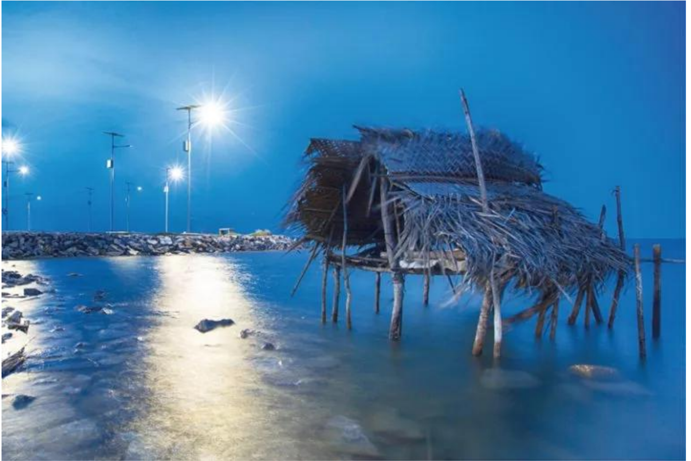
A fishing hut on stilts rests close to the shore

We spotted a leisure spot, curving into the ocean off the road before we reached the famed arched overpass of the bridge. It was a vantage point that offered the best views of the causeway and its environs. Granite rocks that fortified Sangupiddy shimmered in the light. The waters now shone in jade under the shadows of night. Winds nudged the lagoon waters towards the rocks and they grudgingly relented, creating soft ripples in the still waters that do not run deep. A hut erected by prawn fishermen nests atop the waters. Looking back, views of the sleepy Pooneryn waved us goodbye.