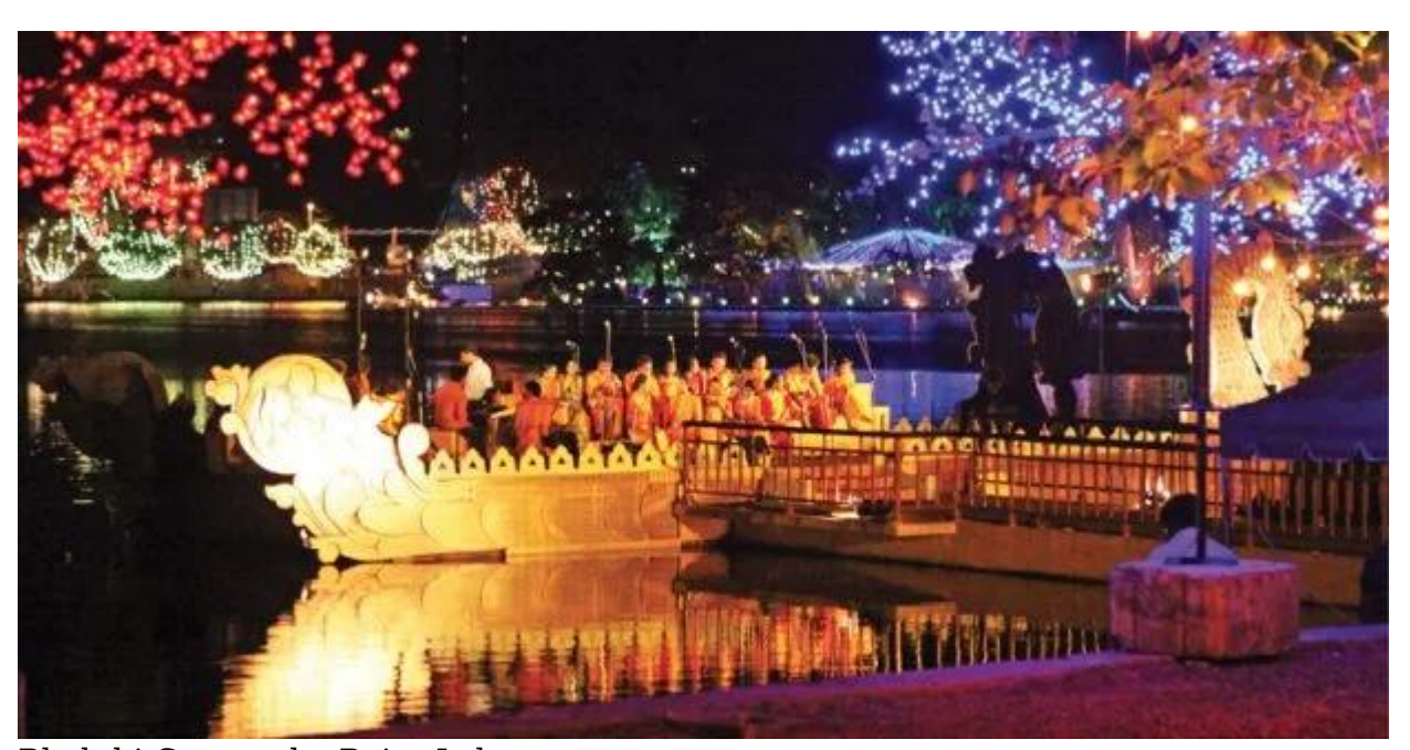
Bhakthi Gee on the Beira Lake

From full moon poya day on May 11 till May 14, Bhakti Gee - devotional songs, will be sung by choirs formed by staff of public and private institutions. The Vesak Kalapaya (Zone) will be made of all elements that are traditionally associated with the sacred Vesak celebrations. The main pandal or thorana will have scenes from the story of Sage Mahoshada. Vesak inspired creations by the Armed Forces, Civil Defence Force, Youth Services Council, The Tower Hall Foundation, and the Ministry of Cultural Affairs, the University of Visual and Performing Arts and other institutions will adorn the streets. There is also plenty of space for artistic work done by anyone who wishes to spread the "Buddhalmabana preethi", the true joy of being inspired by the Buddha. Students from 30 schools have been given the opportunity to create displays based on lessons in their textbooks.