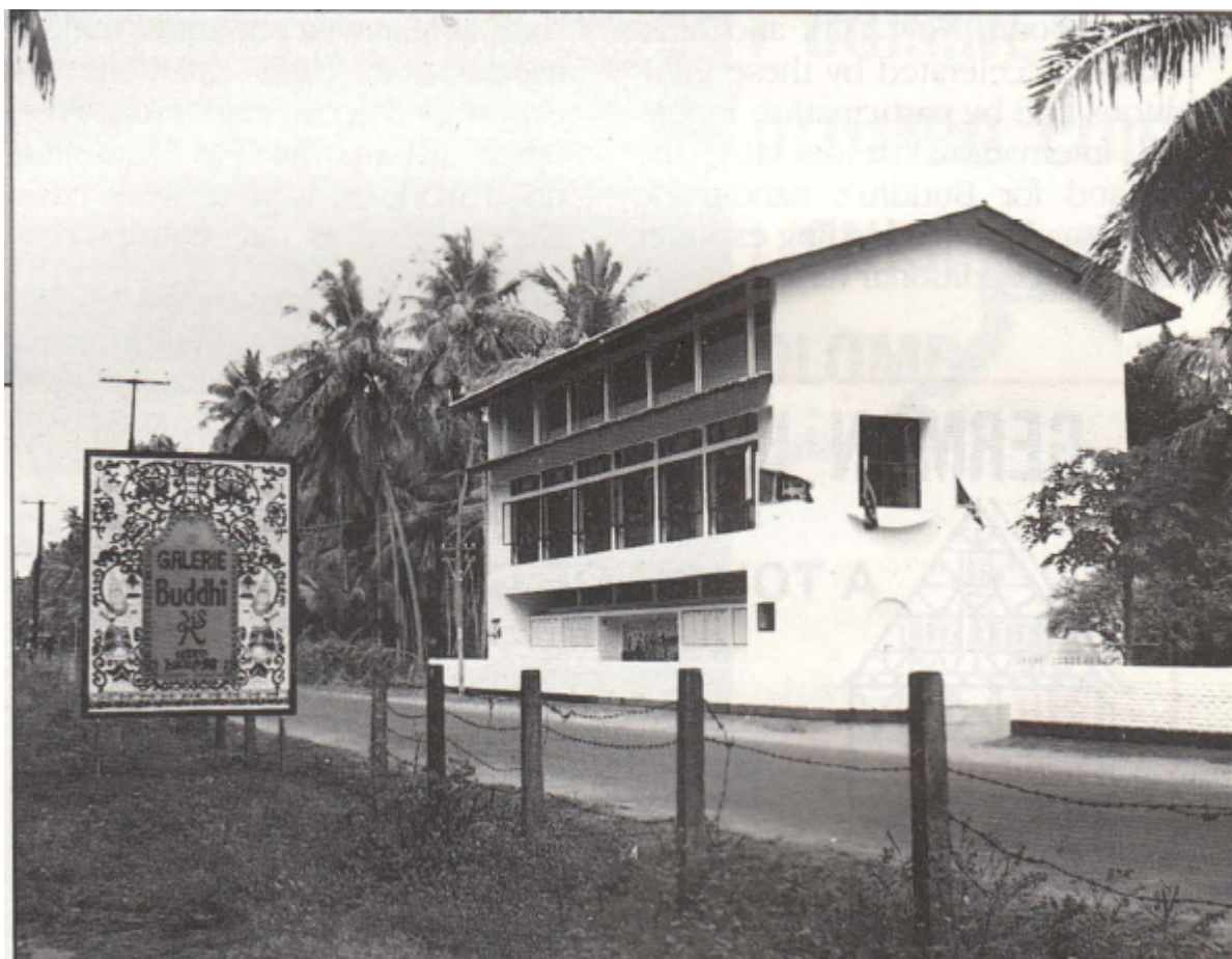
Budhi's showroom at Marawila.

certainly, as the place where quality hand-made Buddhi's batik creations are most freely available!