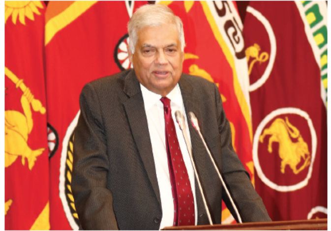
President Ranil Wickremesinghe.