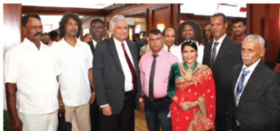
President Ranil Wickremesinghe with Paper Moon Kudils, Arugambay Roccas, Peanut Farm, Upali Beach Surf Resort and Mambo's Arugambay.