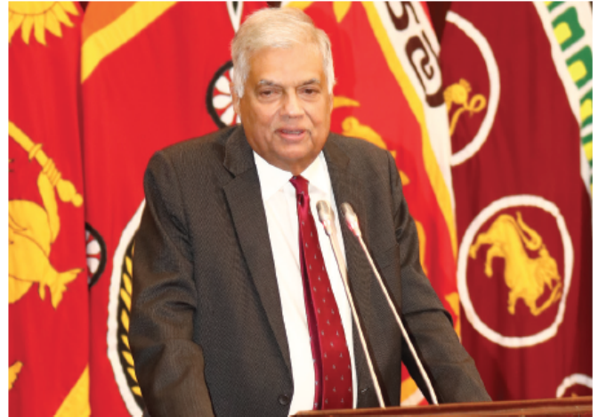
President Ranil Wickremesinghe.