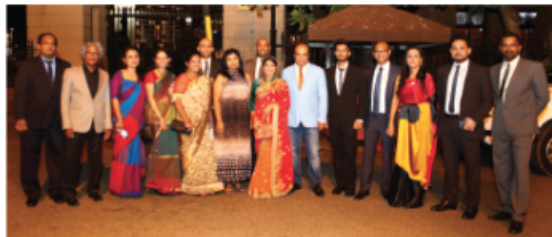
BT Options staff.