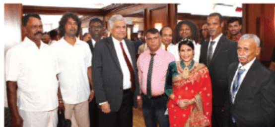
President Ranil Wickremesinghe with Paper Moon Kudils, Arugambay Roccas, Peanut Farm, Upali Beach Surf Resort and Mambo's Arugambay.