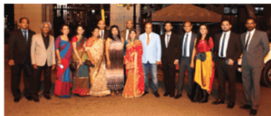
BT Options staff.