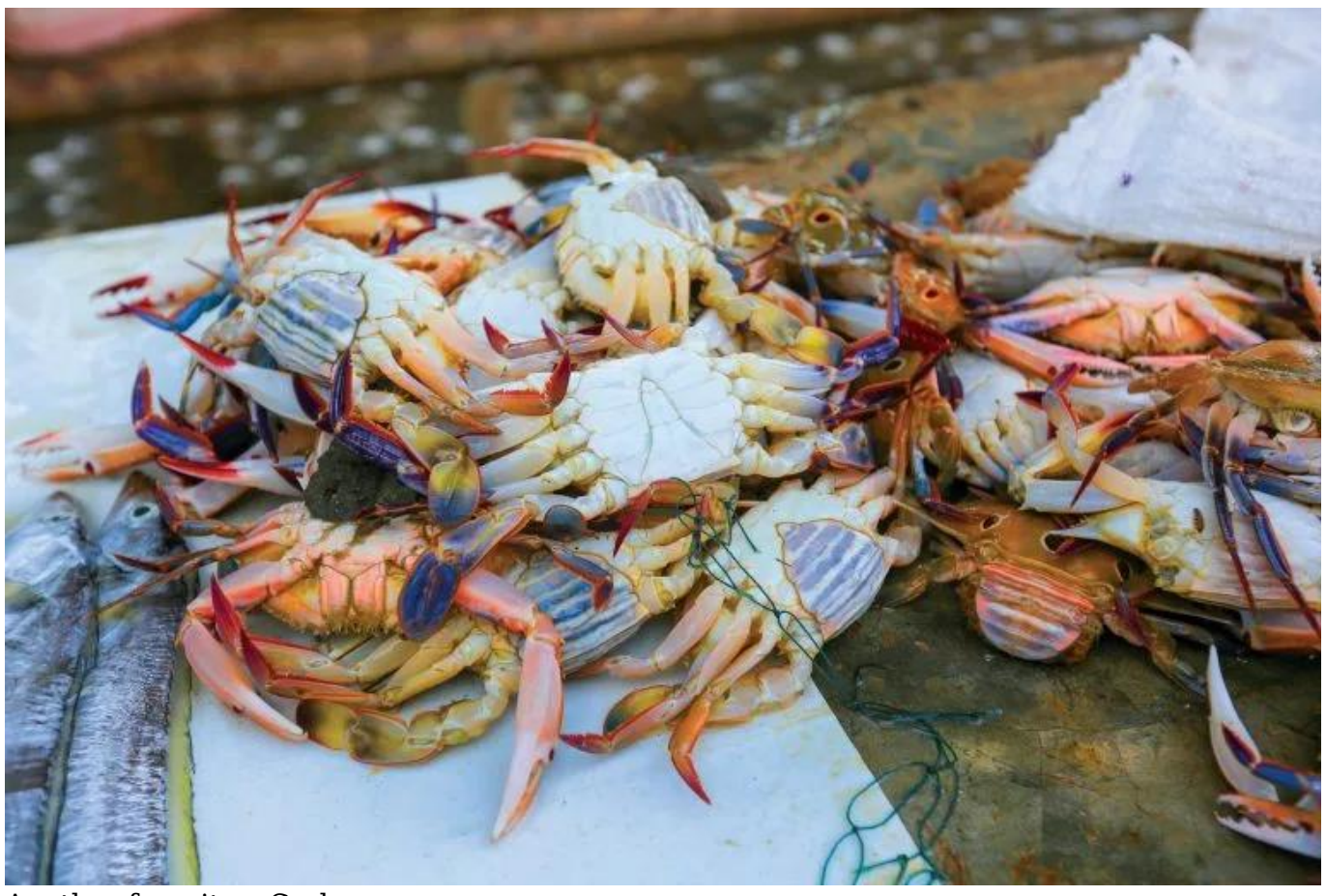
Another favorite - Crabs.