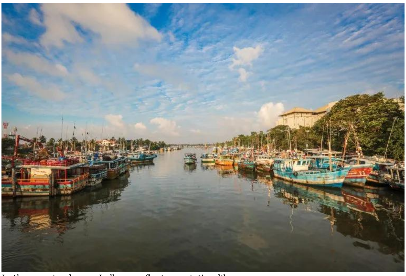
In the morning hours, Lellama reflects a painting-like scene.