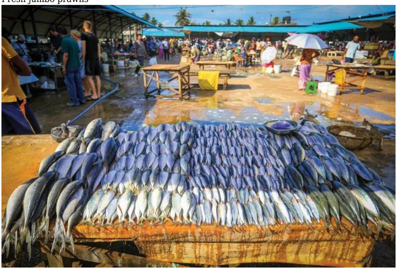
Silvery bodies of fish gleamed under the morning rays