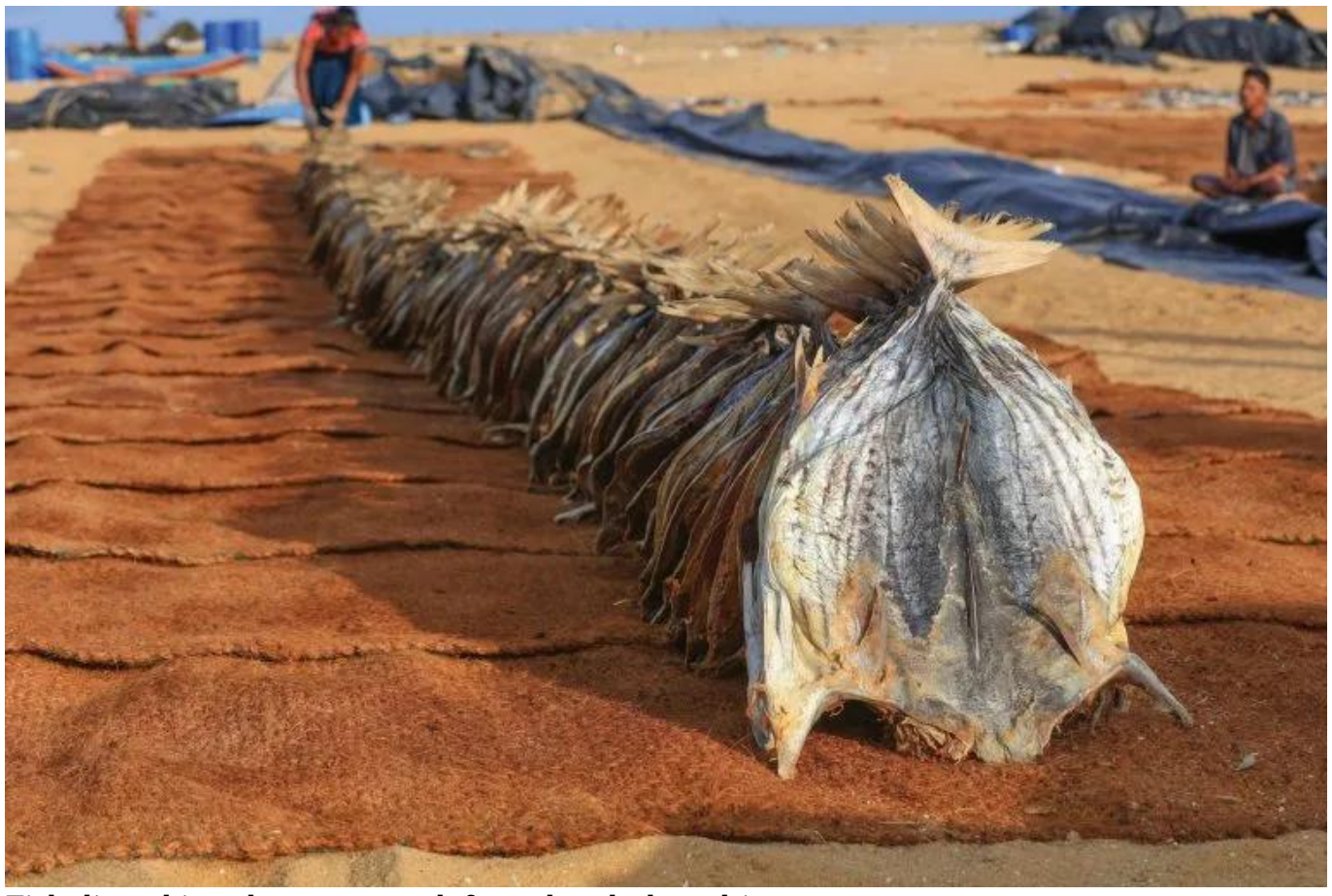
Fish dipped in salt waters are left to absorb the saltiness.