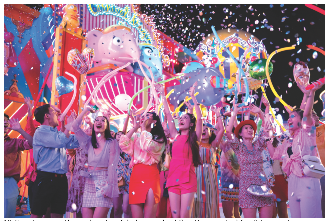
Visitors immerse themselves in a fabulous and exhilarating carnival fun fair experience.

Carnival Magic 999 Moo 3 (next to Phuket FantaSea), Kamala, Kathu District, Phuket Province carnivalmagic.fun