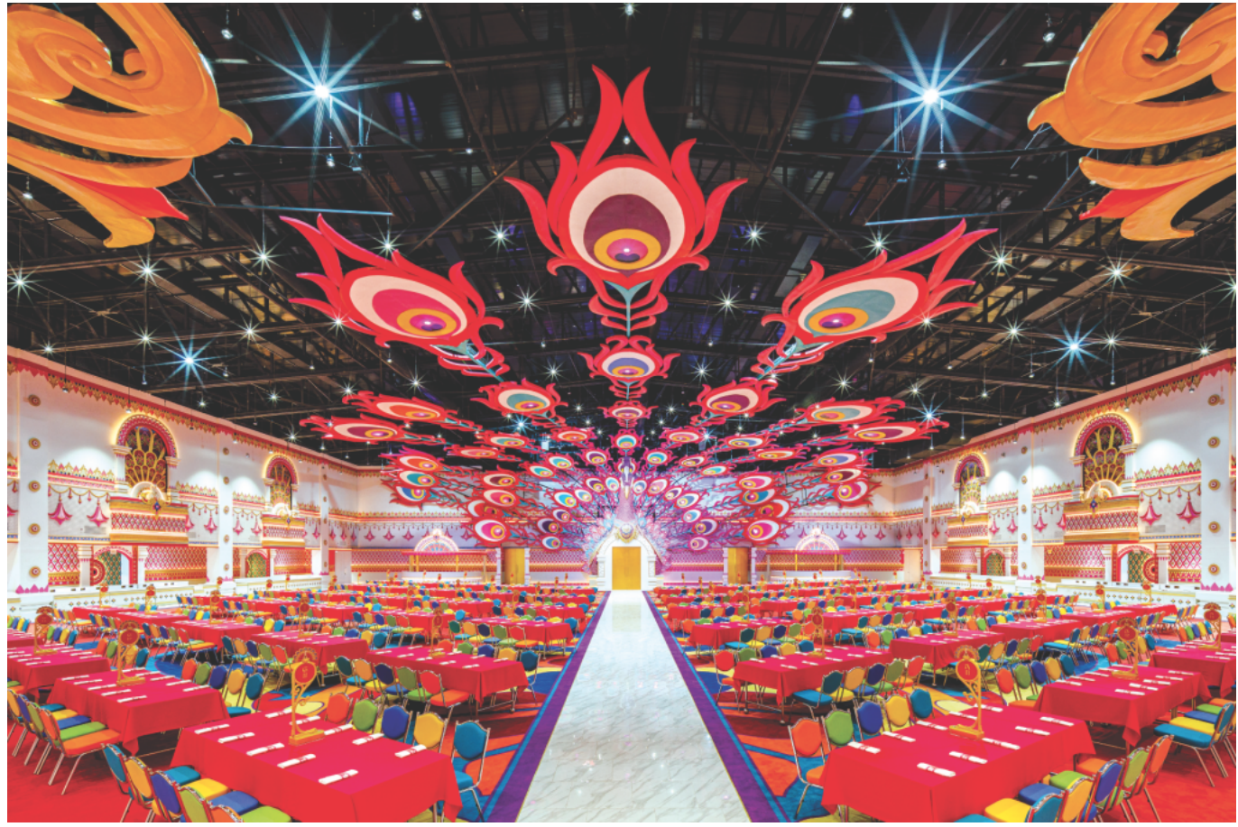
The Bird of Paradise Restaurant, with its grand and unique design theme of two giant peacocks fanning their tail, can serve 3,000 guests.