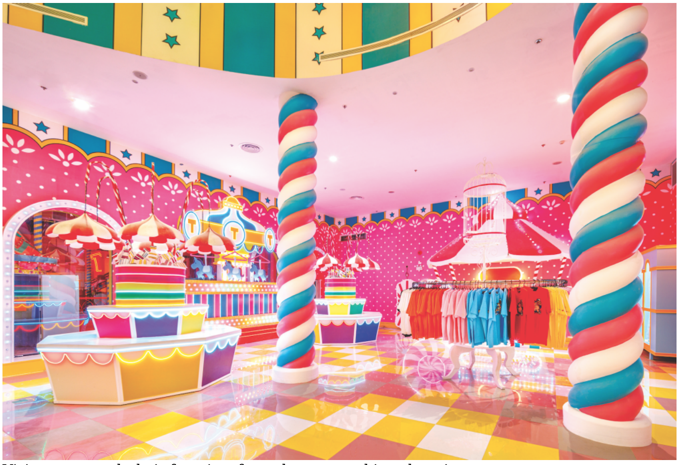
Visitors can grab their favorites from the eye-catching shopping corner.