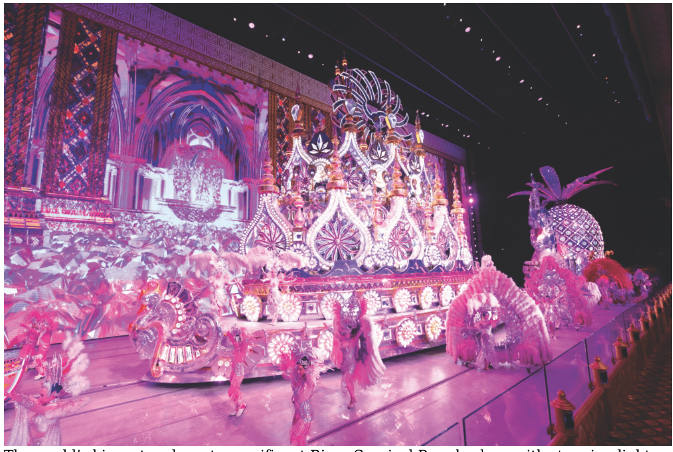
The world's biggest and most magnificent River Carnival Parade show with stunning light effects.