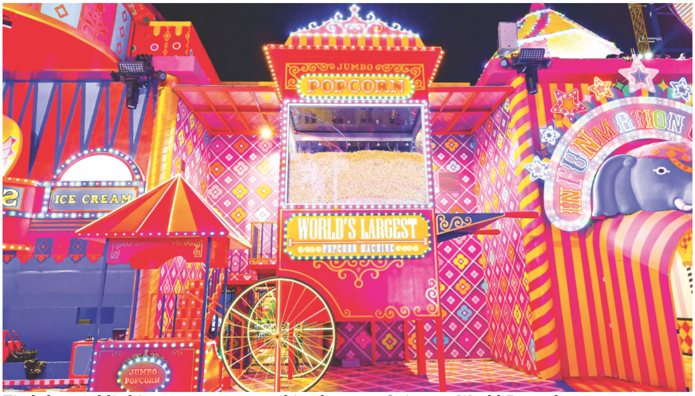
Find the world's biggest popcorn machine here - a Guinness World Record.