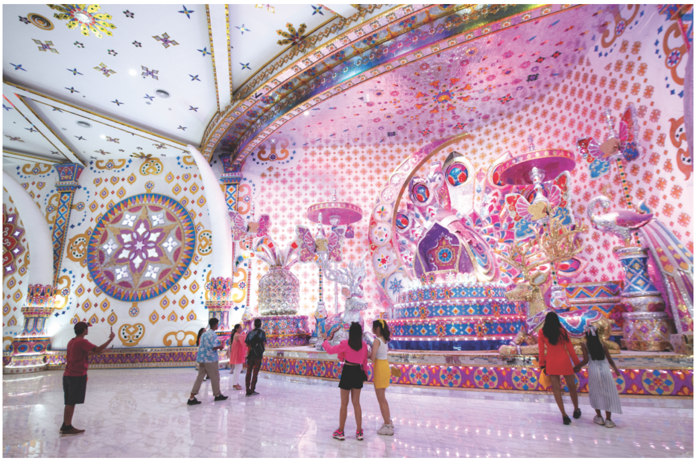
Visitors explore and enjoy the dazzling ambiance at the Kingdom of Lights.