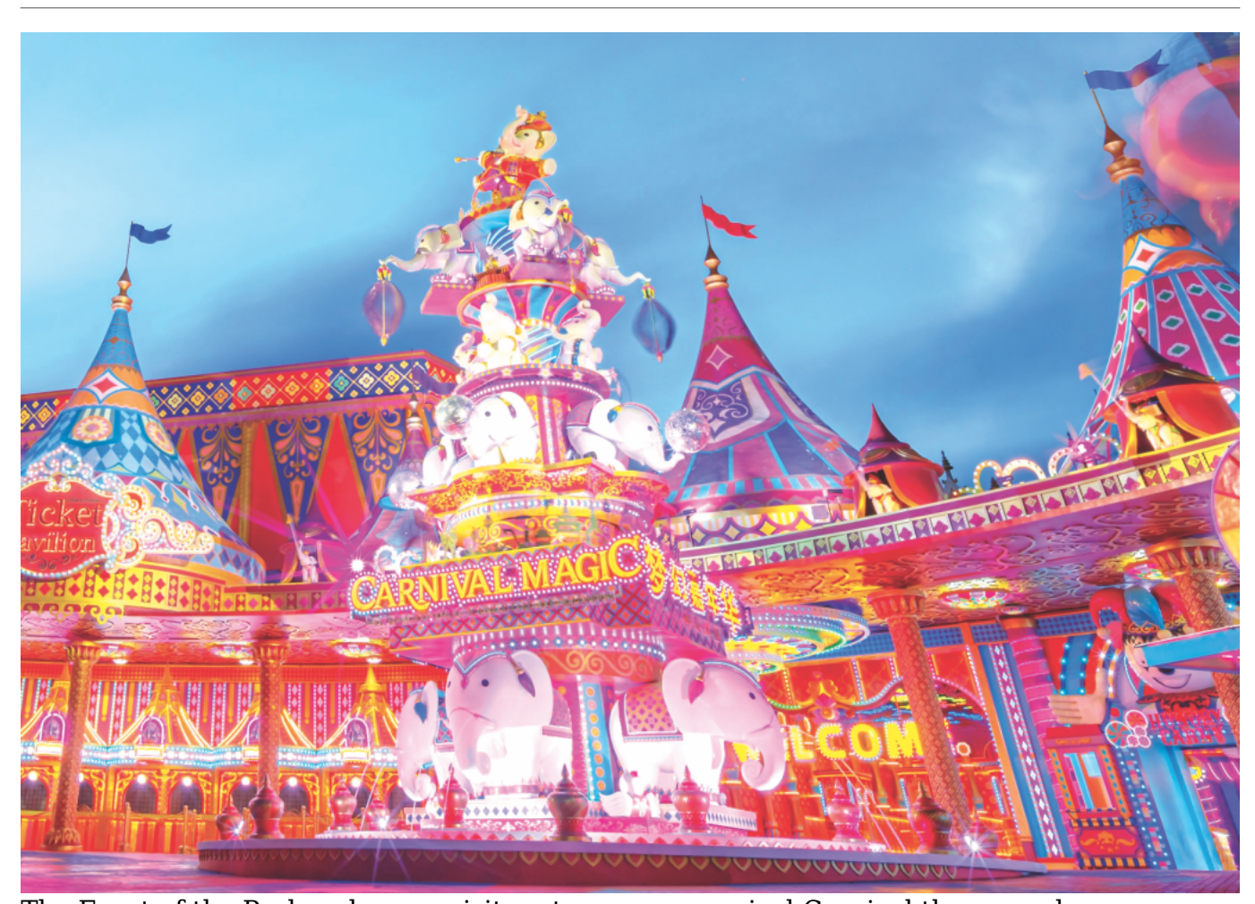
The Front of the Park welcomes visitors to a super magical Carnival theme park.

Carnival Magic, the world's first Thai Carnival theme park, is set to become Phuket's newest landmark. The 6.6-billion-baht venue aims to serve as a tourist magnet that can help revitalize the island's tourism market.