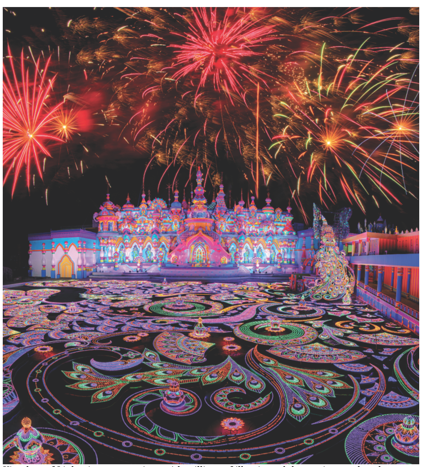
Kingdom of Lights is a masterpiece with millions of illuminated decorations and sculptures.