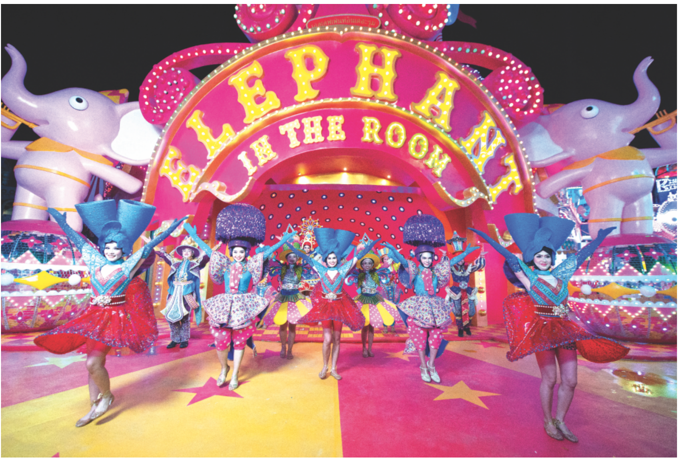
The Carnival Fun Fair zone is vibrant and attractive.