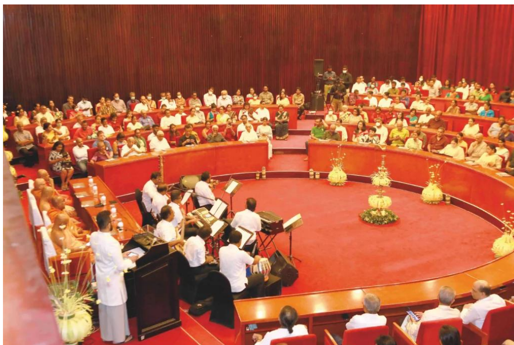
A beautifully orchestrated evening.