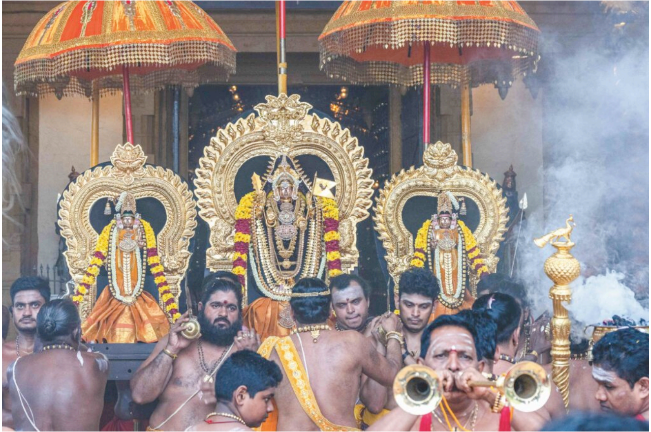
During the Manjam festival, Lord Murugan and his consorts are carried in a solemn procession.