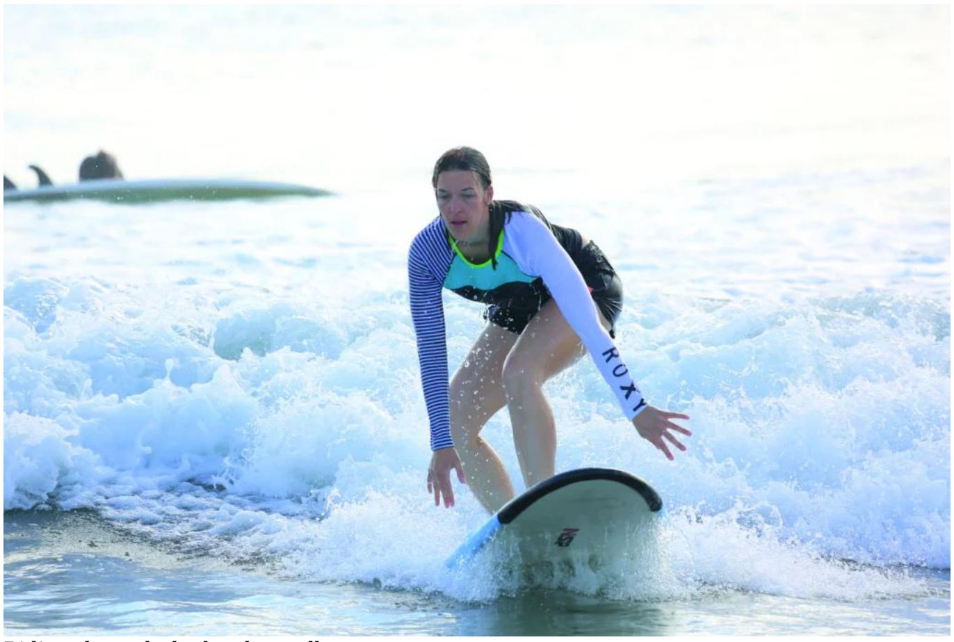
Riding through the lovely swells.