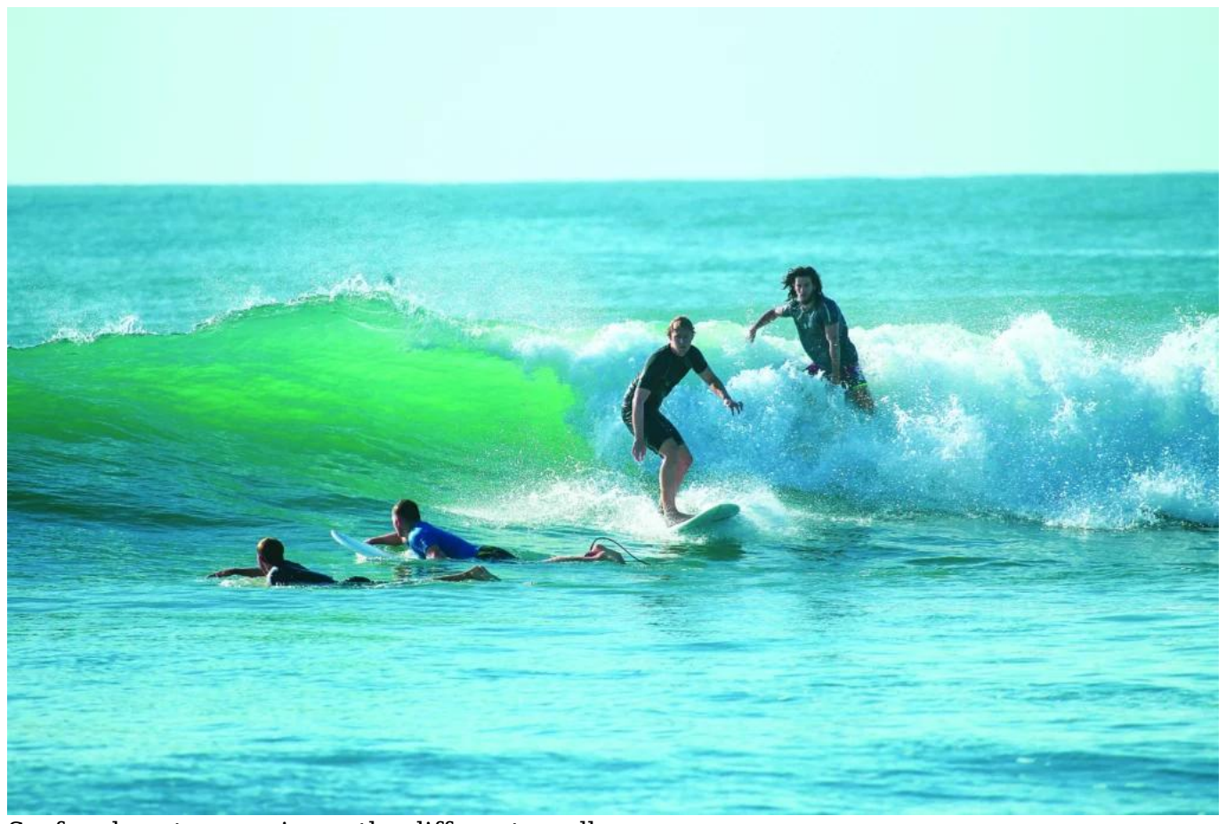
Surfers love to experience the different swells.