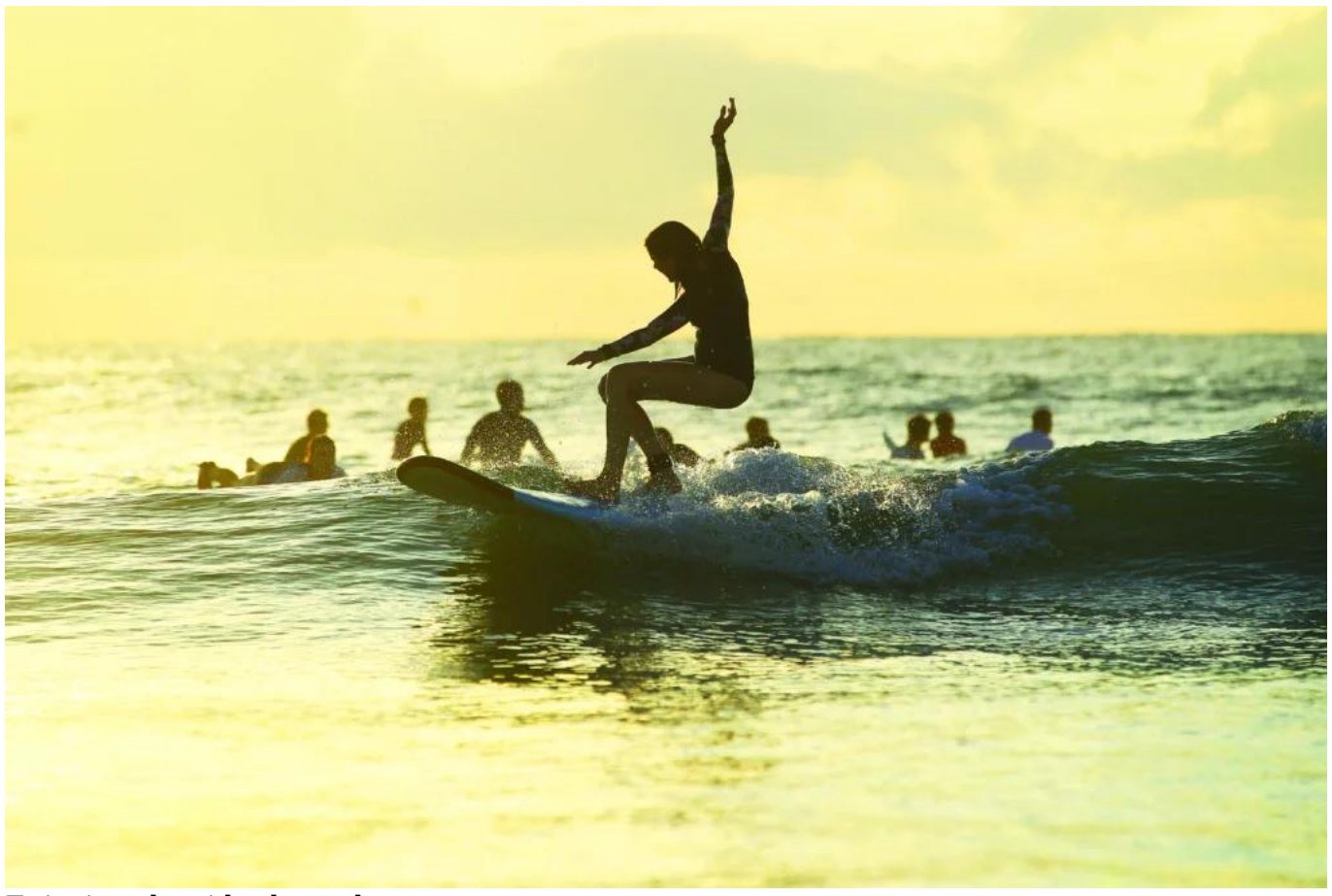
Enjoying the ride through