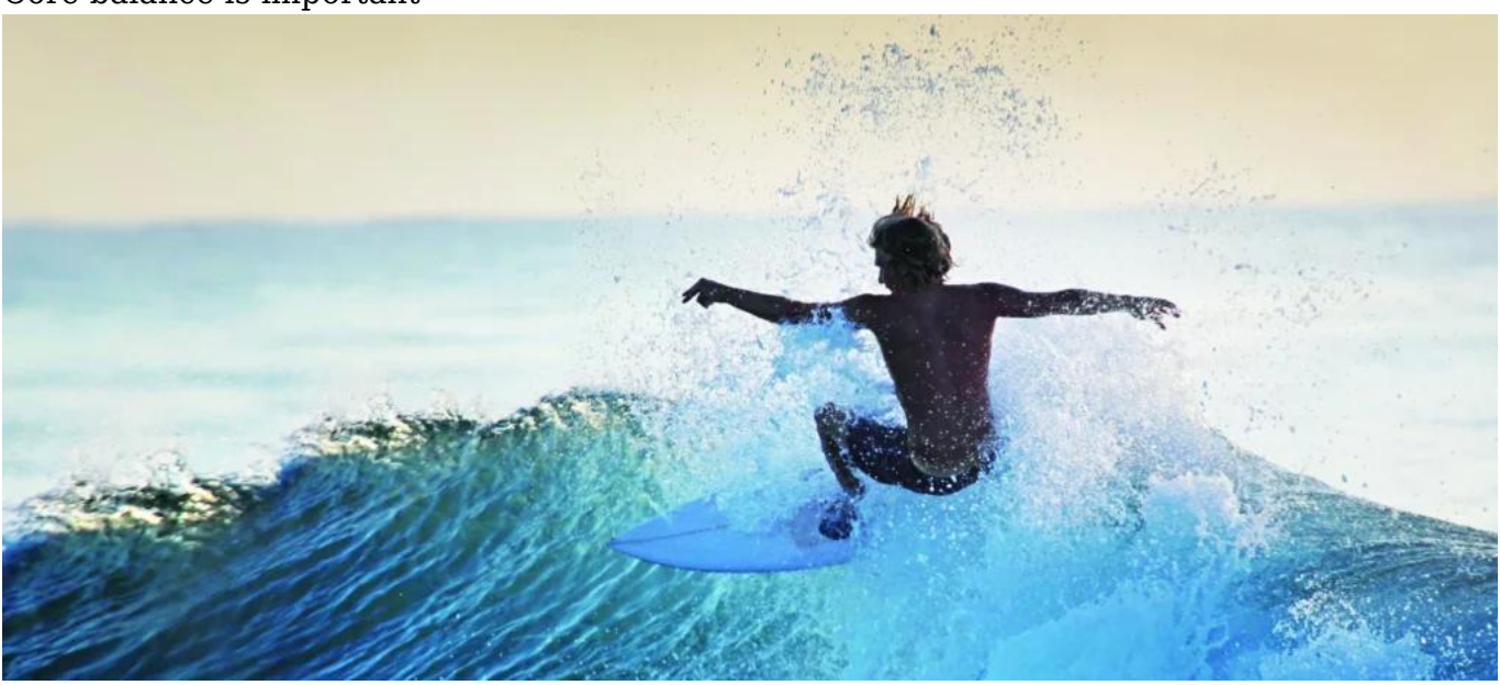
A pro in action.