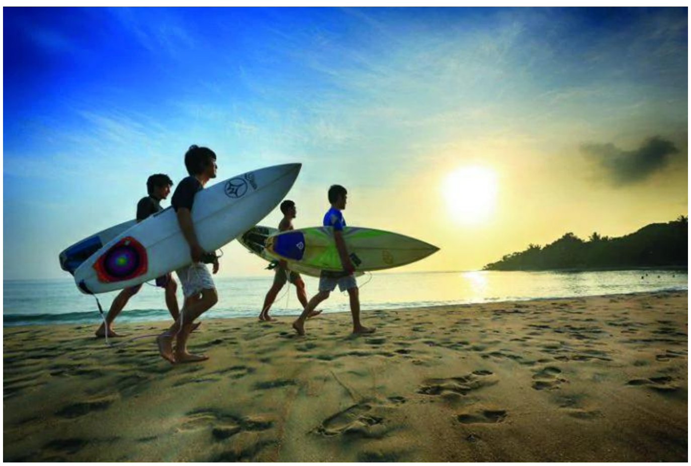
Come, let's go surfing.

Sun, sand, and surf; the season to head to the Eastern shoreline of Sri Lanka is now. Arugambay, the island's much-loved surf capital, is where the spotlight shines. While many roads lead you here, the Pottuvil road that winds through the Lahugala Sanctuary is the perfect greeting to your wild adventure to the East Coast. Traveling through the early morning hours or in the evening, one is bound to receive a glimpse of elephants. Knee deep in the scenic backgrounds, the gentle giants indulge in the leafy greens twisting their trunks with a spray of water. Passing the sanctuary, the road through Pottuvil is a scenic depiction of life in the East; villagers going through their day, fishermen tiring away in the waters, and luminous, neat paddy and buffaloes cooling in the ponds and goats scattered on the roadsides are a pleasant sight to watch. Funky saying glint in the sun, and surf-shaped signboards sway in welcome. Arugambay is the picture of a resort town with friendly smiles all around and refreshing thambili (king coconut) in hand. That "good vibes happen on the tides" is the theme along this coast. Tourists are seen on bicycles, scooters, or even tuk tuks heaving their surfing boards to the wave hotspots.