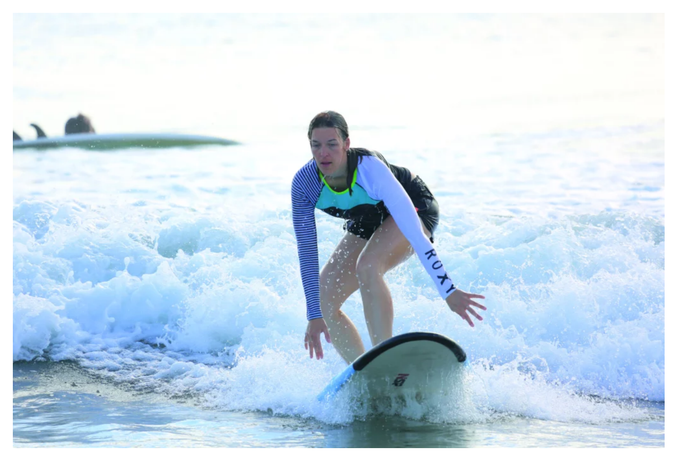
Riding through the lovely swells.