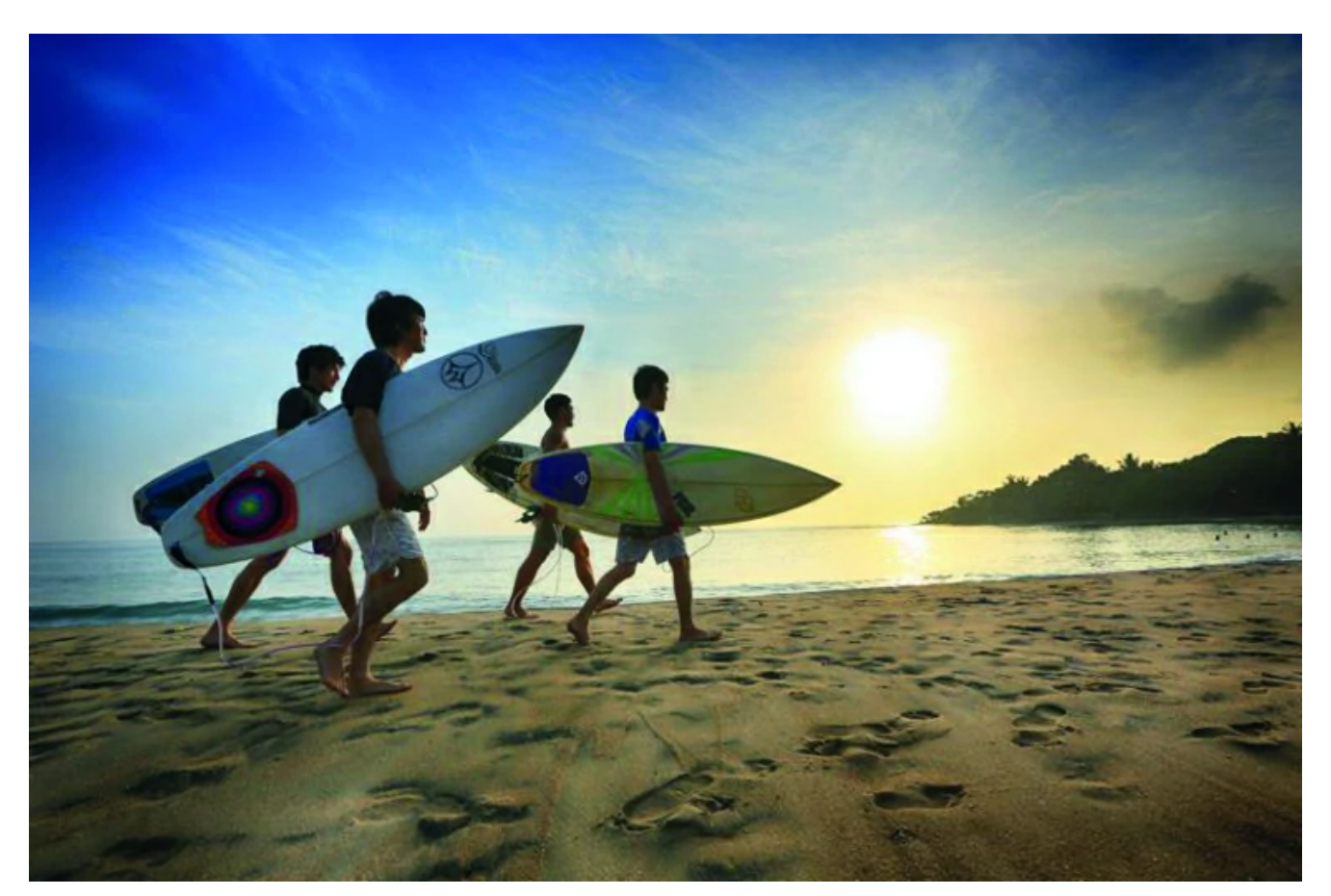
Come, let's go surfing.

Sun, sand, and surf; the season to head to the Eastern shoreline of Sri Lanka is now. Arugambay, the island's much-loved surf capital, is where the spotlight shines. While many roads lead you here, the Pottuvil road that winds through the Lahugala Sanctuary is the perfect greeting to your wild adventure to the East Coast. Traveling through the early morning hours or in the evening, one is bound to receive a glimpse of elephants. Knee deep in the scenic backgrounds, the gentle giants indulge in the leafy greens twisting their trunks with a spray of water. Passing the sanctuary, the road through Pottuvil is a scenic depiction of life in the East; villagers going through their day, fishermen tiring away in the waters, and luminous, neat paddy and buffaloes cooling in the ponds and goats scattered on the roadsides are a pleasant sight to watch. Funky saying glint in the sun, and surf-shaped signboards sway in welcome. Arugambay is the picture of a resort town with friendly smiles all around and refreshing thambili (king coconut) in hand. That "good vibes happen on the tides" is the theme along this coast. Tourists are seen on bicycles, scooters, or even tuk tuks heaving their surfing boards to the wave hotspots.