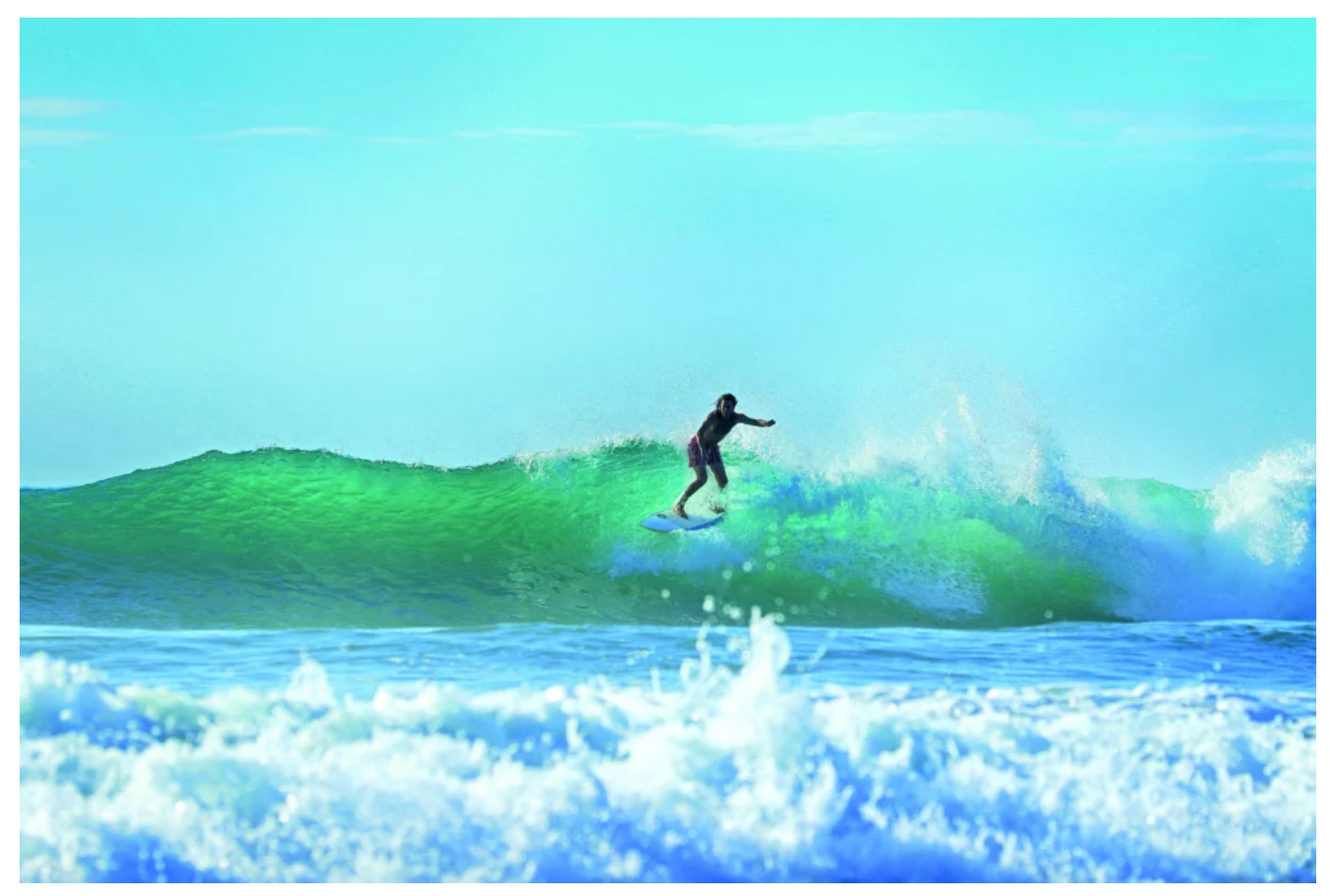
The best views of the Arugambay Main Point can be enjoyed from Upali Beach Surf Resort and Café.