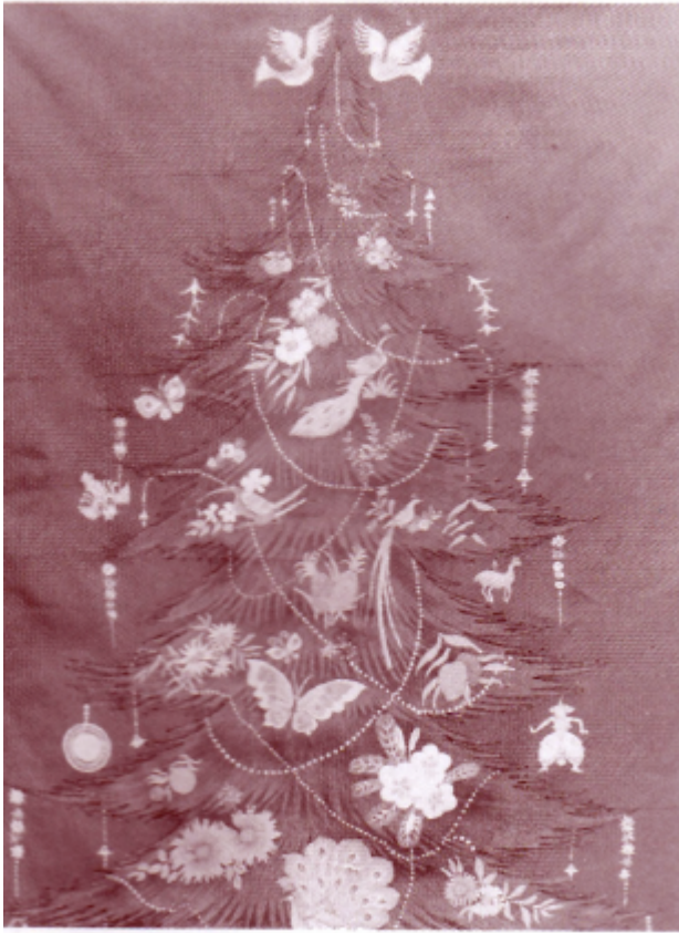
The mood of Christmas in Batik; A wall hanging depicting a Christmas tree, from the Gift Boutique.