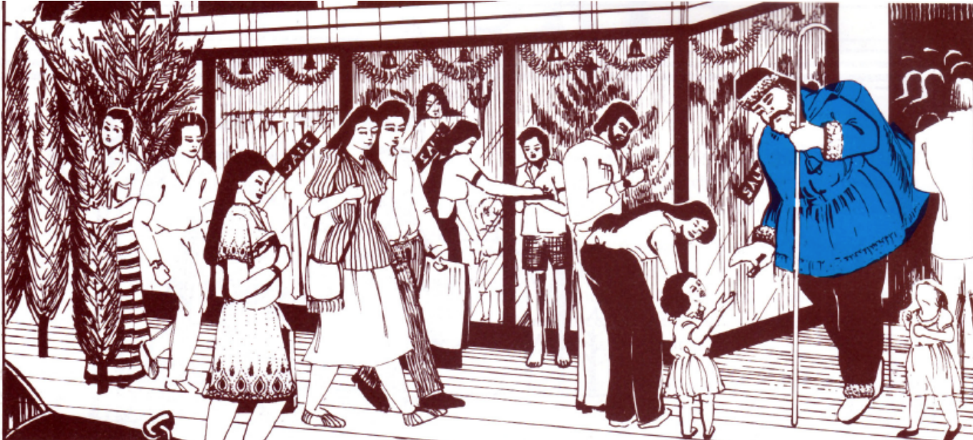
Santa Claus greets children at the entrance to many shops during the Christmas shopping spree .