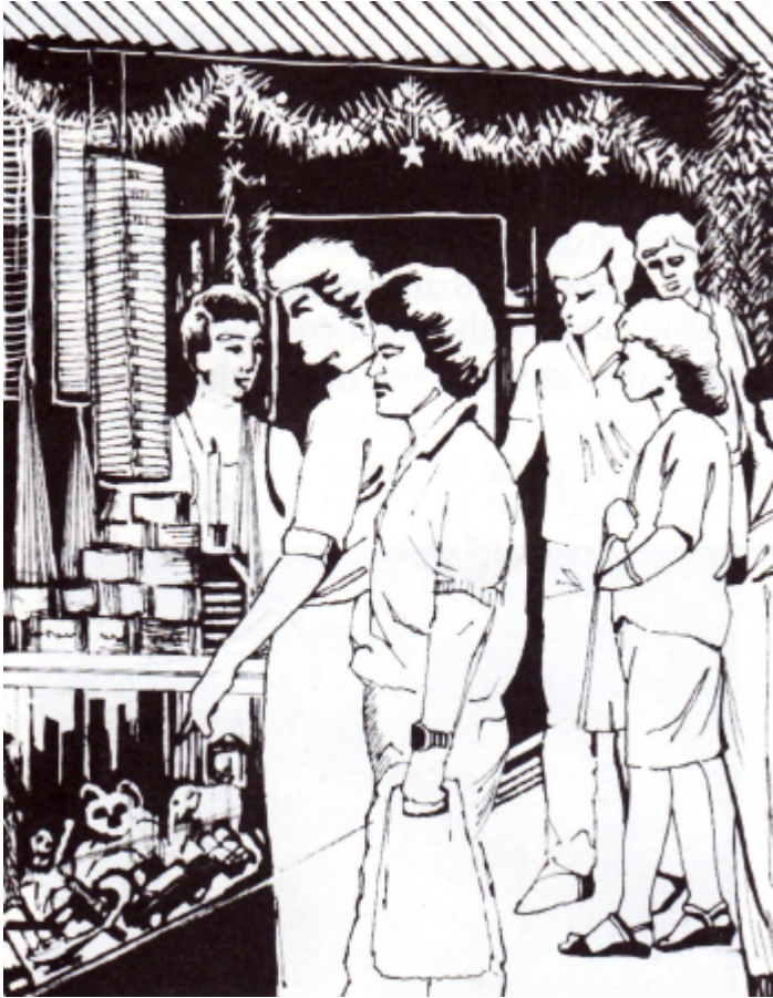
Crackers and fireworks are hot selling items during the Christmas season.