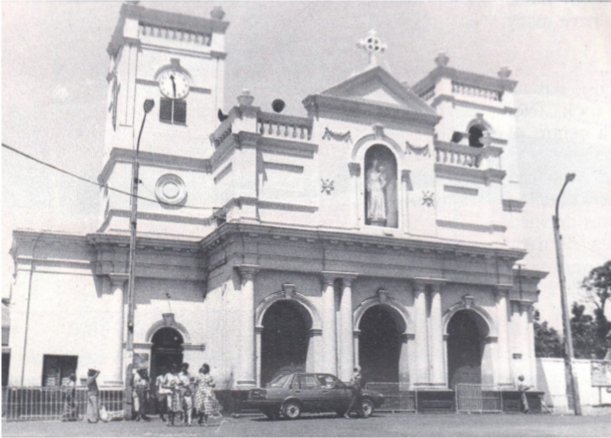
St. Anthony's Church at Kochchikade draws many devotees on Tuesdays. (Suresh de Silva)