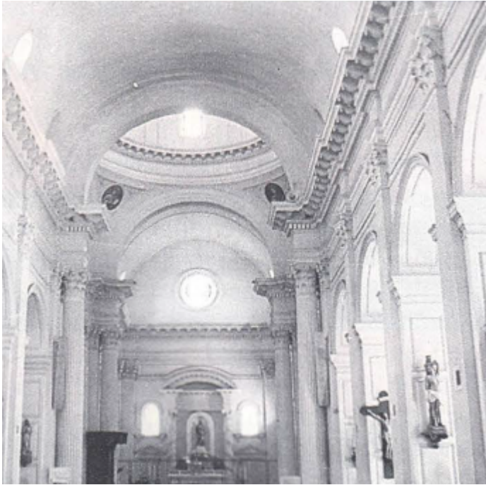
The spacious interior of St. Lucia's Cathedral, Kotahena.