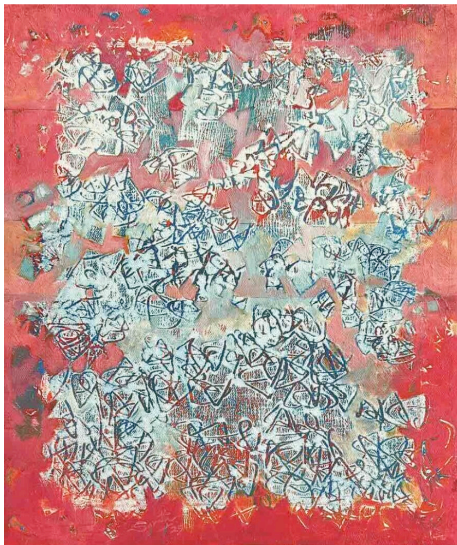
Freedom Search XII.

Cicada—presented by Natanda Dance Theatre Sri Lanka