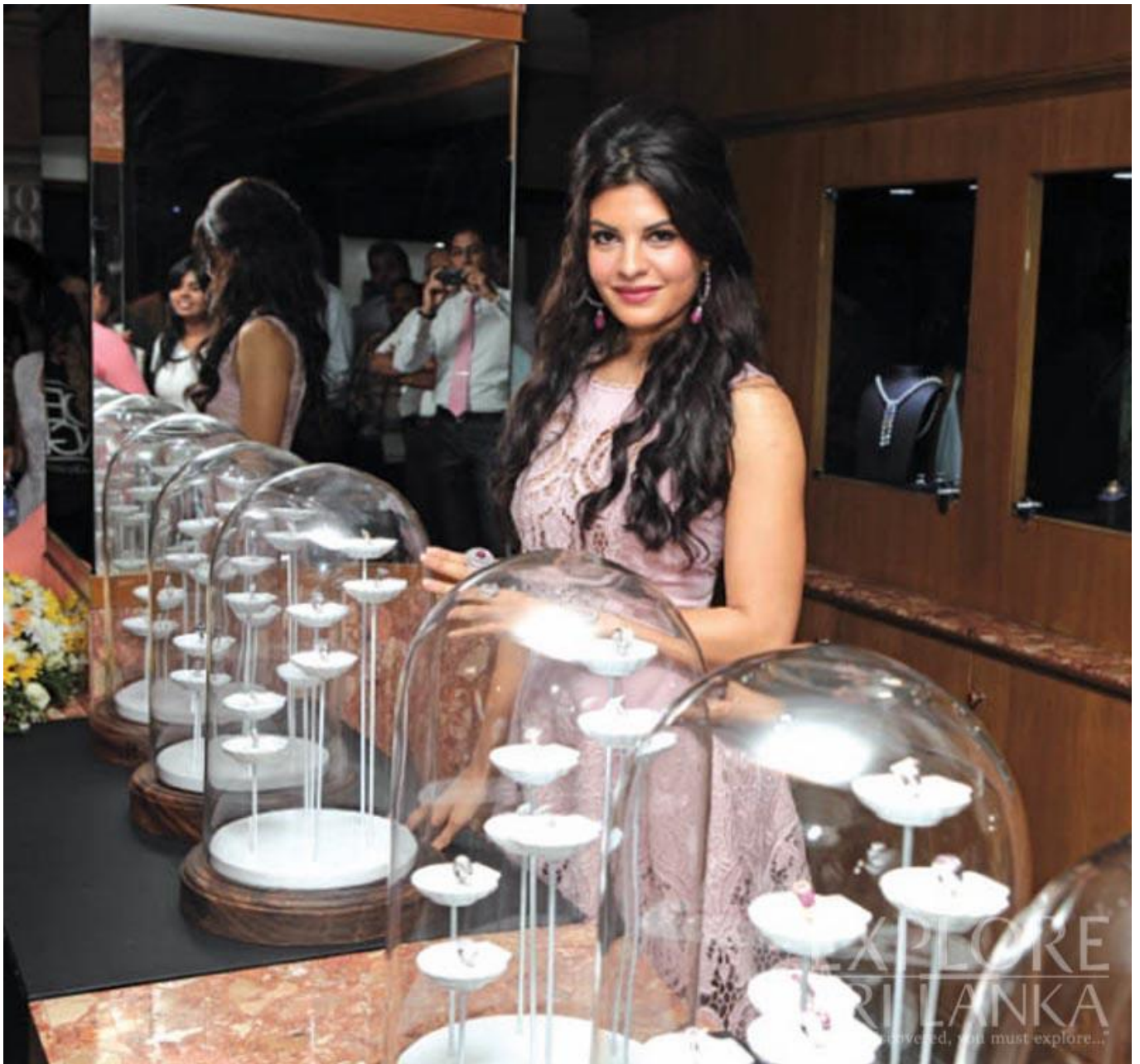
Jacqueline Fernandez with the collection of luxury rings