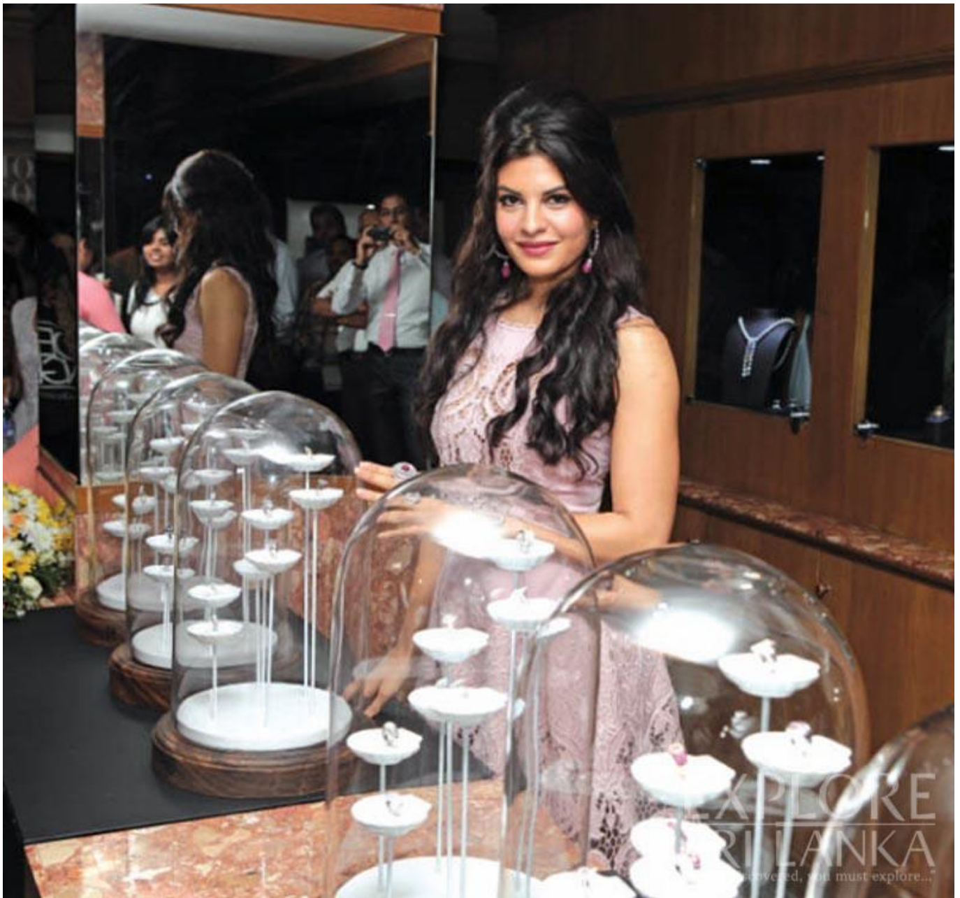
Jacqueline Fernandez with the collection of luxury rings