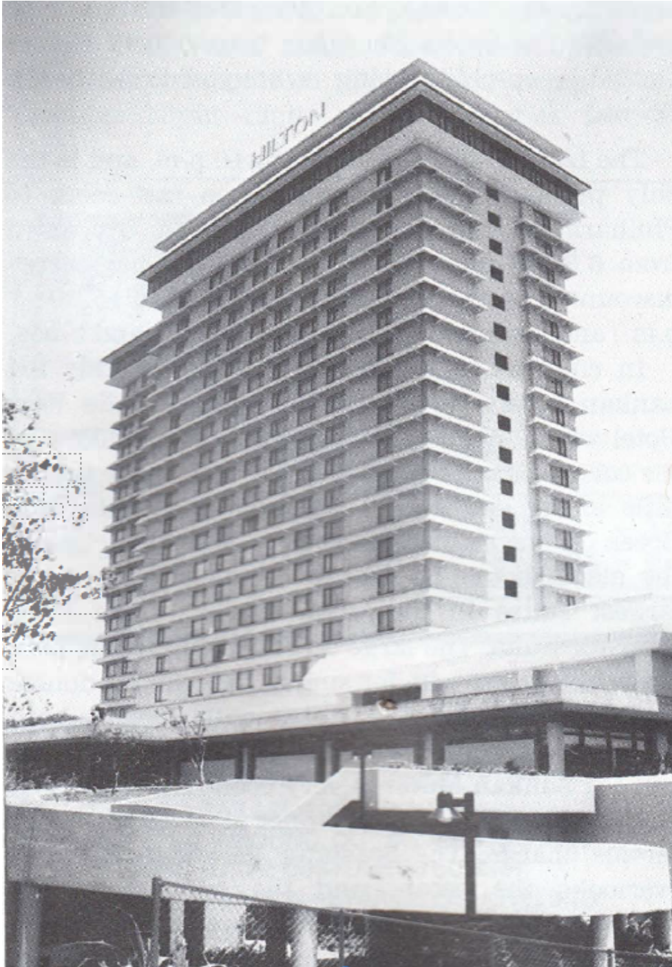
Hilton International, adding to Colombo's skyline.