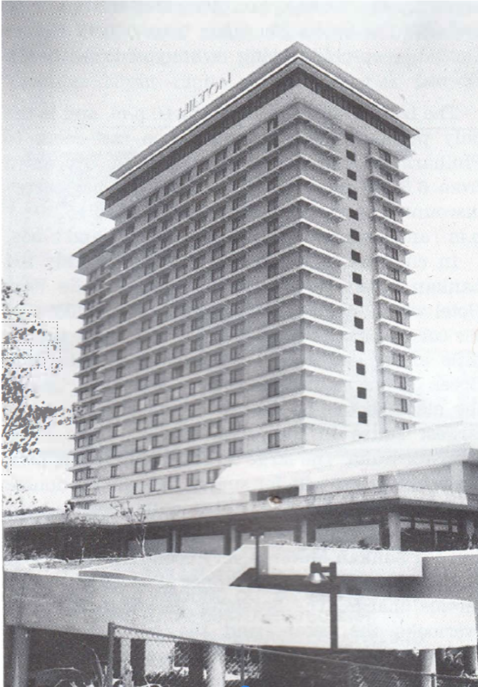
Hilton International, adding to Colombo's skyline.