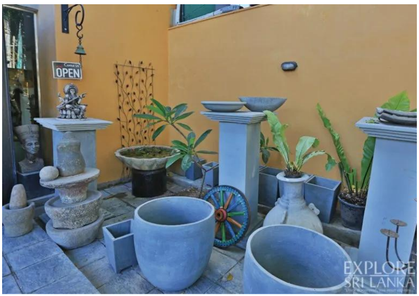
A selection of cement ware for the outdoors

Many objects found here are fresh conceptions, such as the the old brass spittoon turned upside down provides the base for a lotus bud-shaped lampshade made of raw silk. Innovation has brought life back to others, including a vangediya (mortar), transformed by elegant, colourful motifs. A charming tea-set from coconut shell, lamp holders suspended from an old window frame, others attached to solid timber, are some of the most creative displays at the store. From quirky designs ranging to practical interior solutions, Country Life is eponymous.