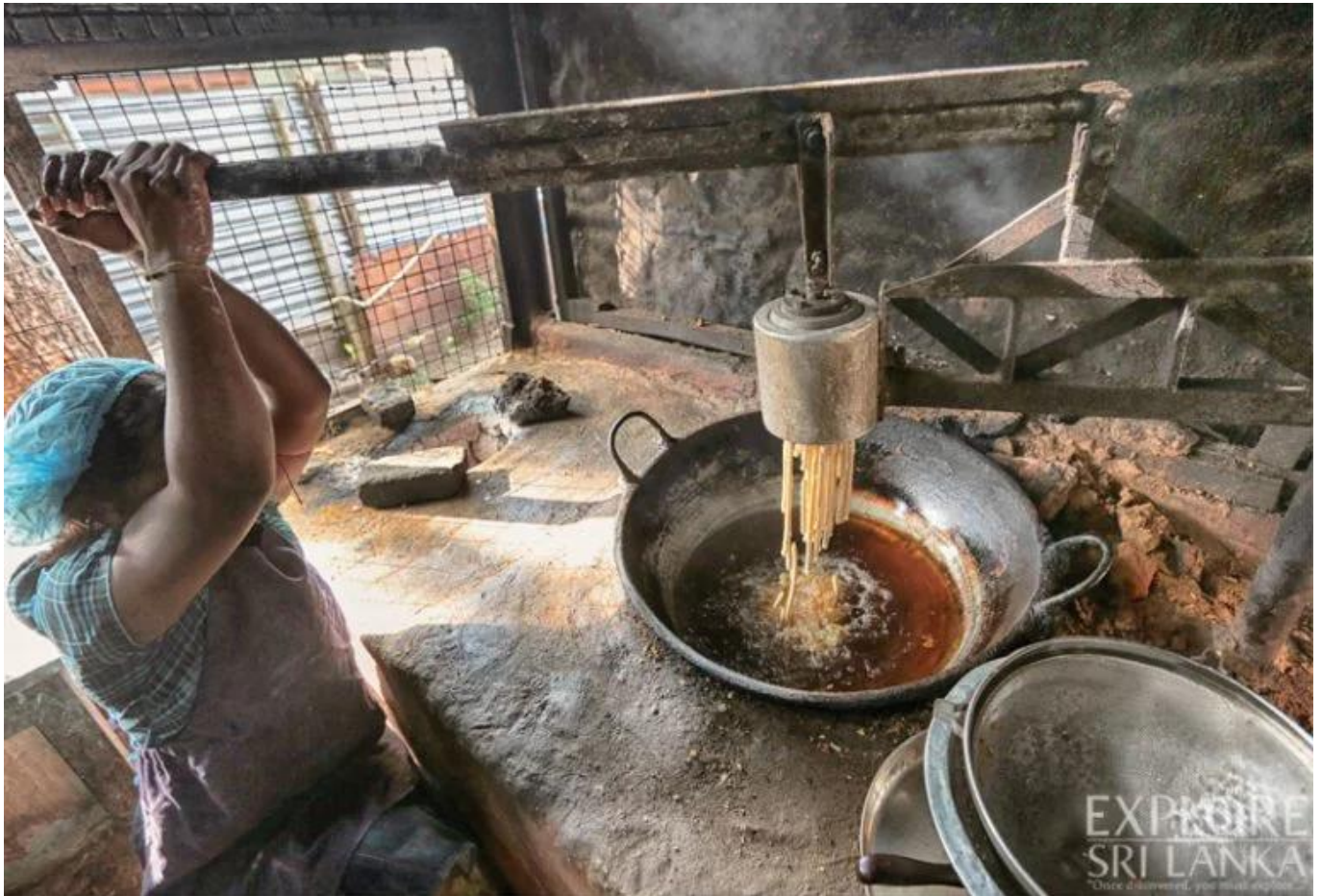
Nirojinika firmly presses the mold in one go

For two kilos steamed and roasted wheat flour a kilo of gram flour is sifted and added. Salt and water from ground garlic is added to flour and kneaded to a dough. After frying, chilli powder is sprinkled and tossed to give a spicy and crunchy taste. Chilli powder should not be added in the initial stage, since this breaks while frying. Our stomachs started to grumble as the spicy aromas filled the air.