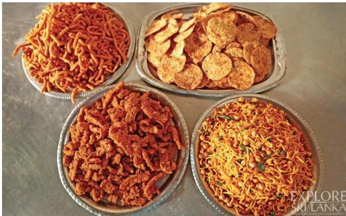
Clockwise from right: Paruthi Thurai vadai, Mixture, Pakoda and Murukku

Swirls of murukku and flat vadai turned a golden brown in the hot oil. The spicy aroma was enticing as we watched the crunchy flavoursome bites of the North take on a mouth-watering form.