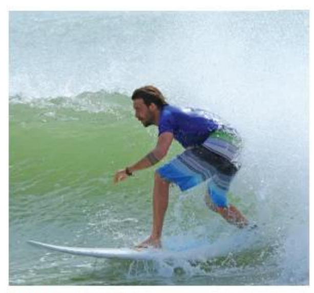
Riding through the lovely swells.

with uplifting applause. Though at times the riders do bail off the board in a comical splash, the whacks of the waves cannot keep these funloving, determined pro riders off the water. For the beginners or those who wish to learn the surf sport, Whisky Point in Pottuvil is quite ideal. The whitecaps of Whisky Point are more lenient and make easy work for the learners. The pros come here too to enjoy the point's cheerful swells and swirls. Climb on to the iconic rock outcrop and enjoy the view and scenic sunrise. Another surf point that is close to Arugambay is the scenic Peanut Farm Point, where the rustic shrub forest and glassy lake borders the beach.