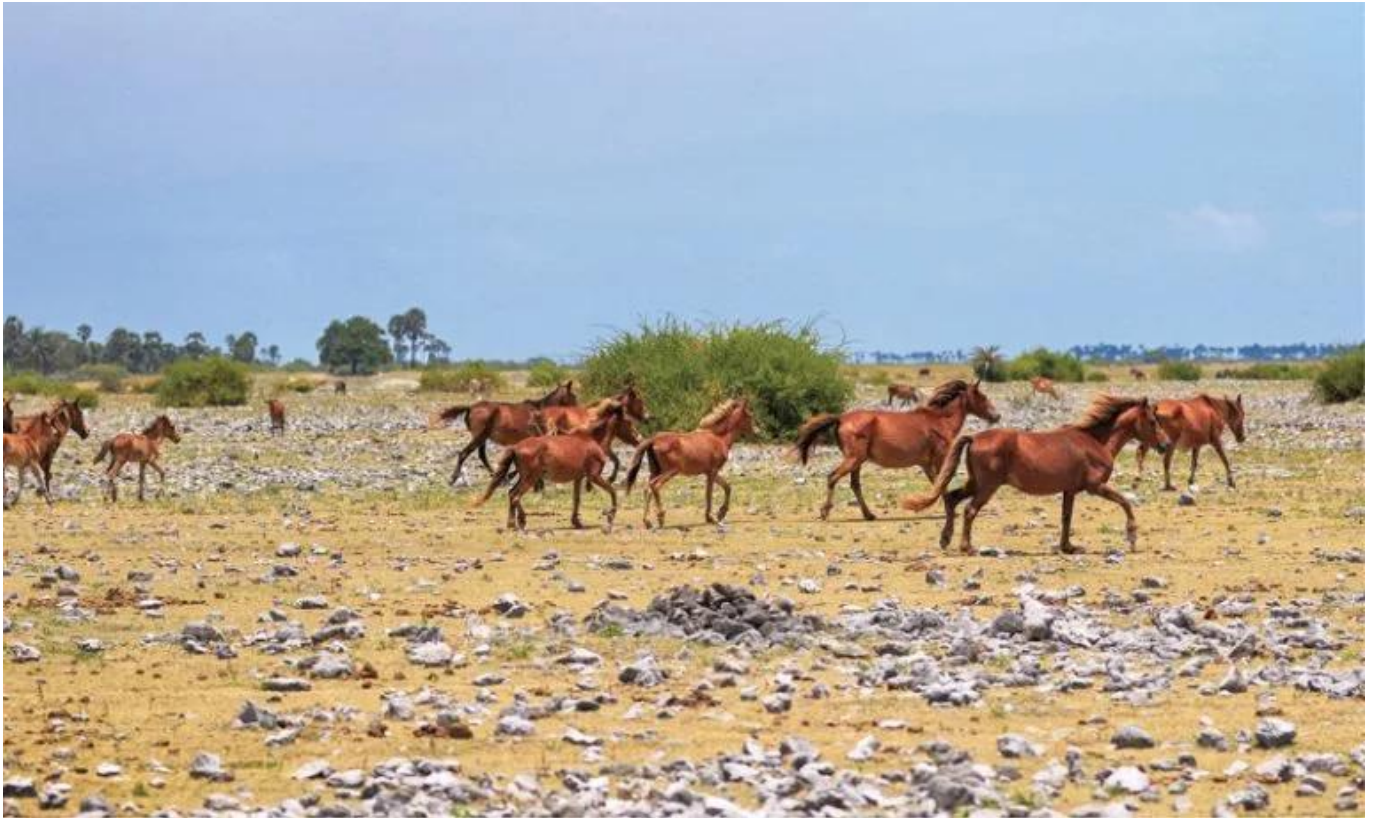
Wild horses: the spirit of freedom in Delft

one. As we came closer, the horses whinnied and began to canter away, their manes rippling in the wind.