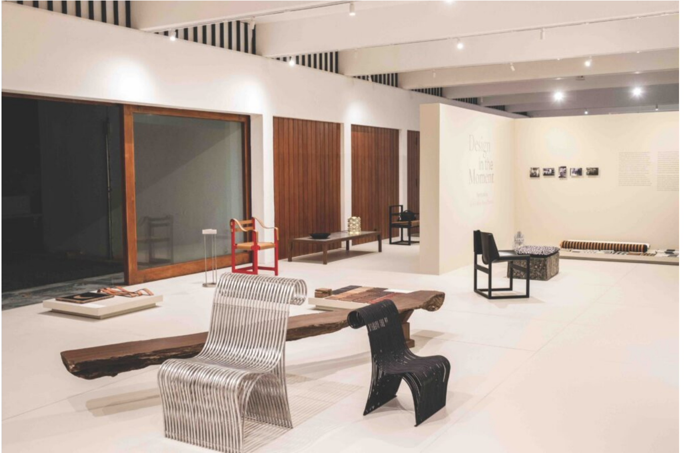
Unique exhibits from 'Design in the Moment'.