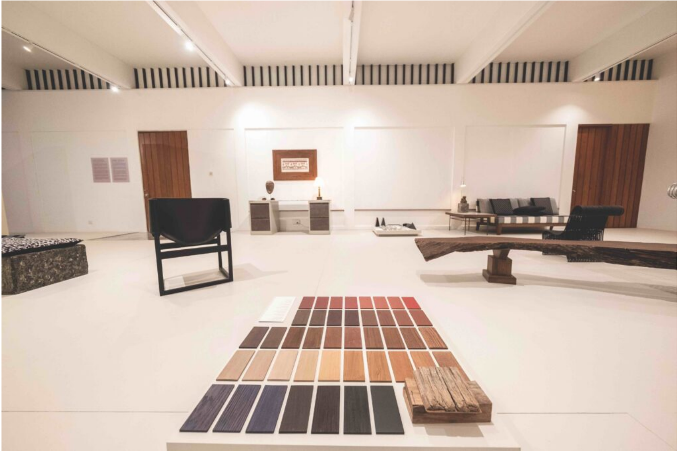
The exhibition explores the histories and context of Bawa's furniture designs.