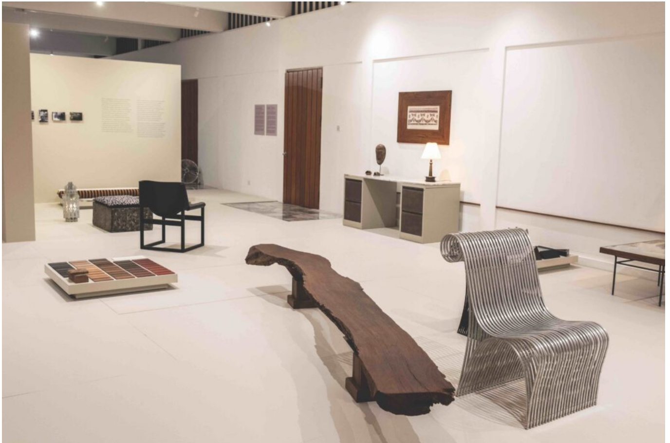
The exhibition features a remarkable array of furniture, including innovative lamps and chairs.